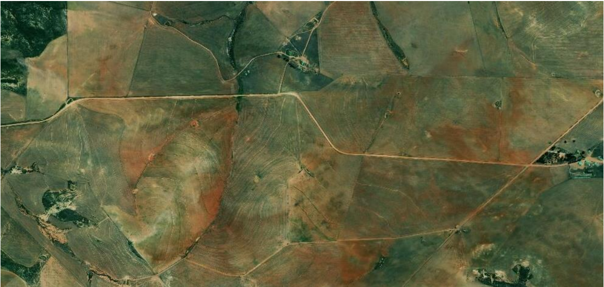
Figure 17. Enon Formation deposits north of the Soutpansvlakte Basin, at elevations of up to 130 m (between Witkop in the east and Baadjieskraal in the west).