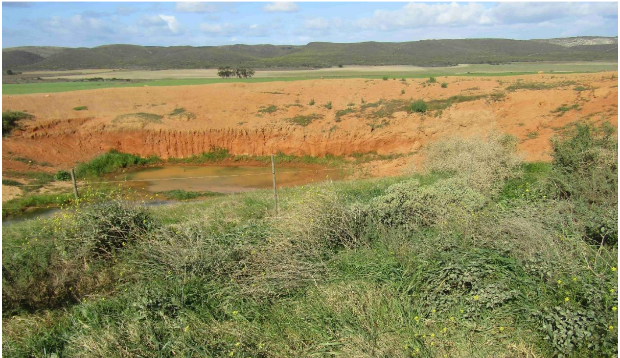
Figure 14. Enon Formation deposits in a hole dug by farmers.