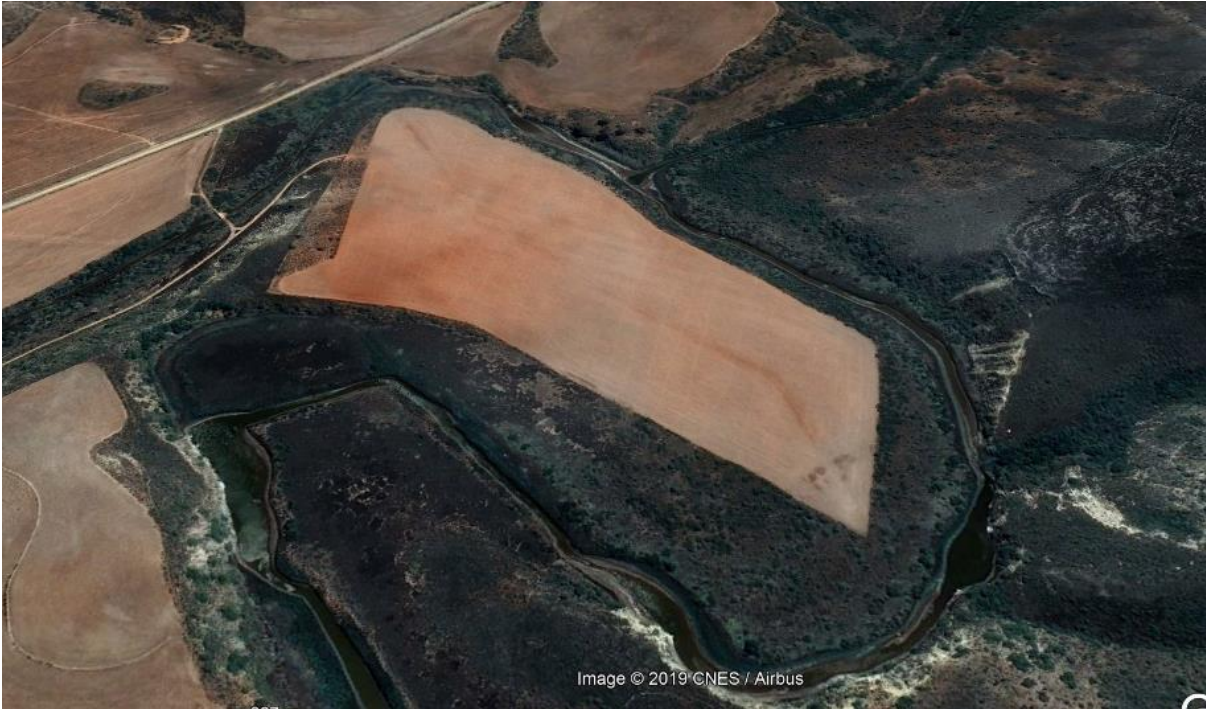
Figure 8. Enon Formation deposits on a shale hill slope, in Oulandshoek, east of the Soutpansvlakte Basin.

The Enon Formation deposits are found on Bokkeveld hill tops and slopes (Figures 8 and 9).