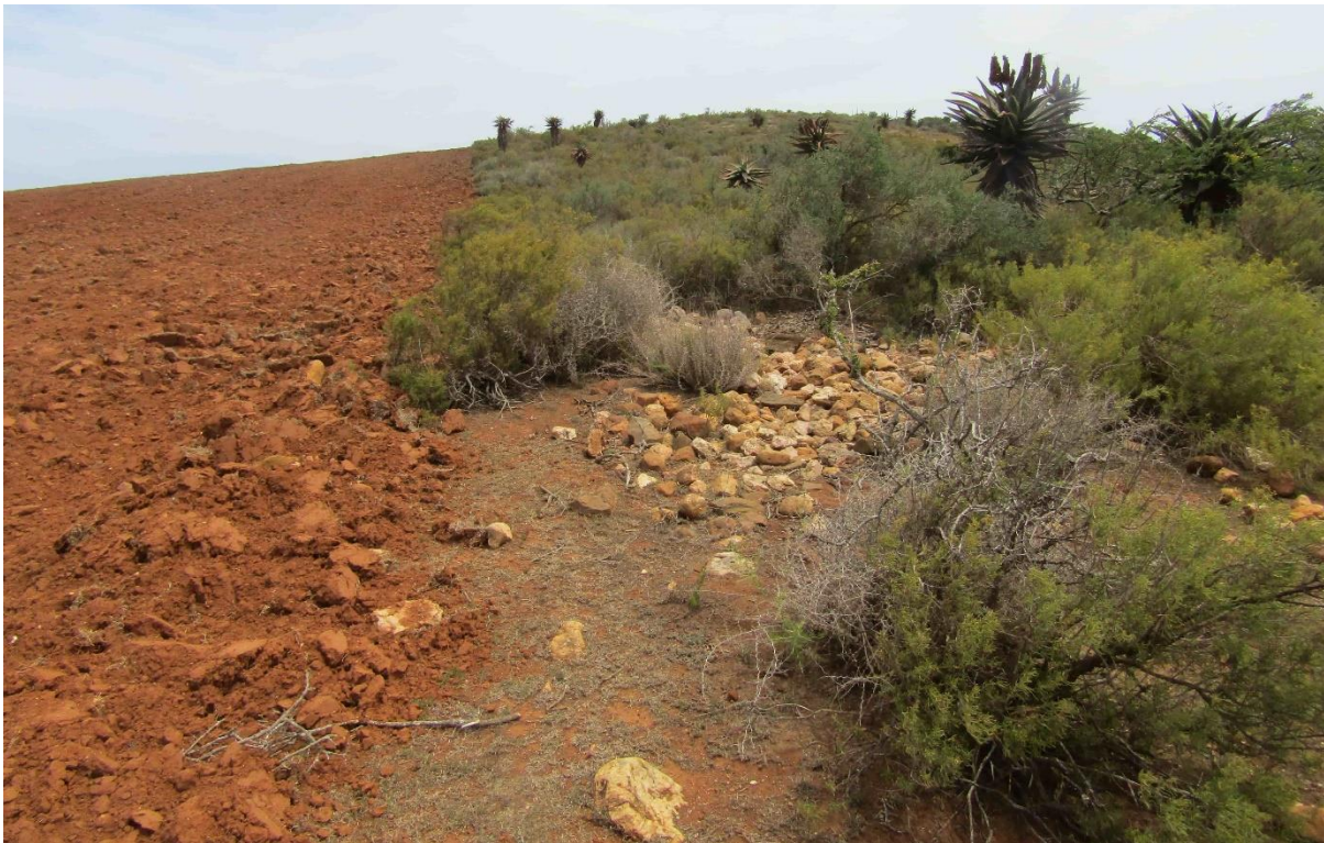
Figure 9. Enon Formation deposits (left) on a shale hill (right, typically with aloes), in Oulandshoek, east of the Soutpansvlakte Basin. A heap of Enon Formation clasts, collected from the field, is seen in the middle of the photo.