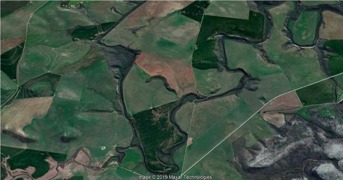
Figure 7. Crops obscure the red colour of the Enon Formation sediments.