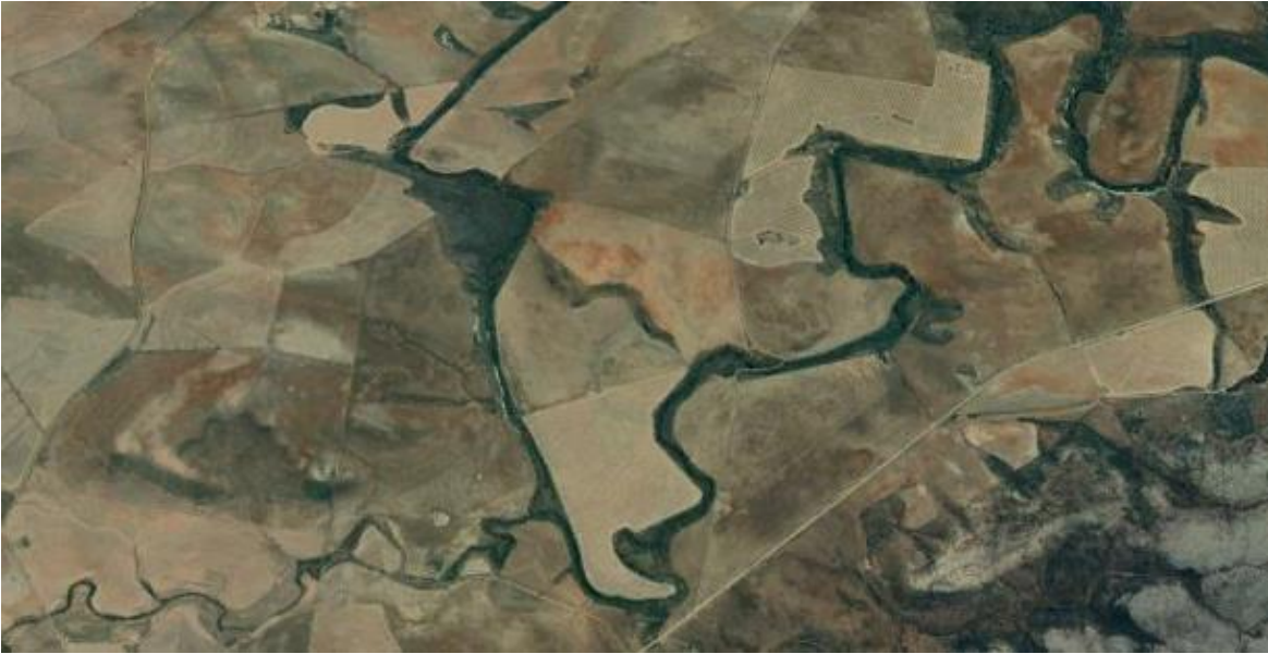
Figure 6. Enon Formation sediments have reddish colour.

Some of the Enon sediments can be discerned by their reddish colour from satellite imagery taken when the fields are bare (Figure 6), as crops mask the reddish colour (Figure 7).