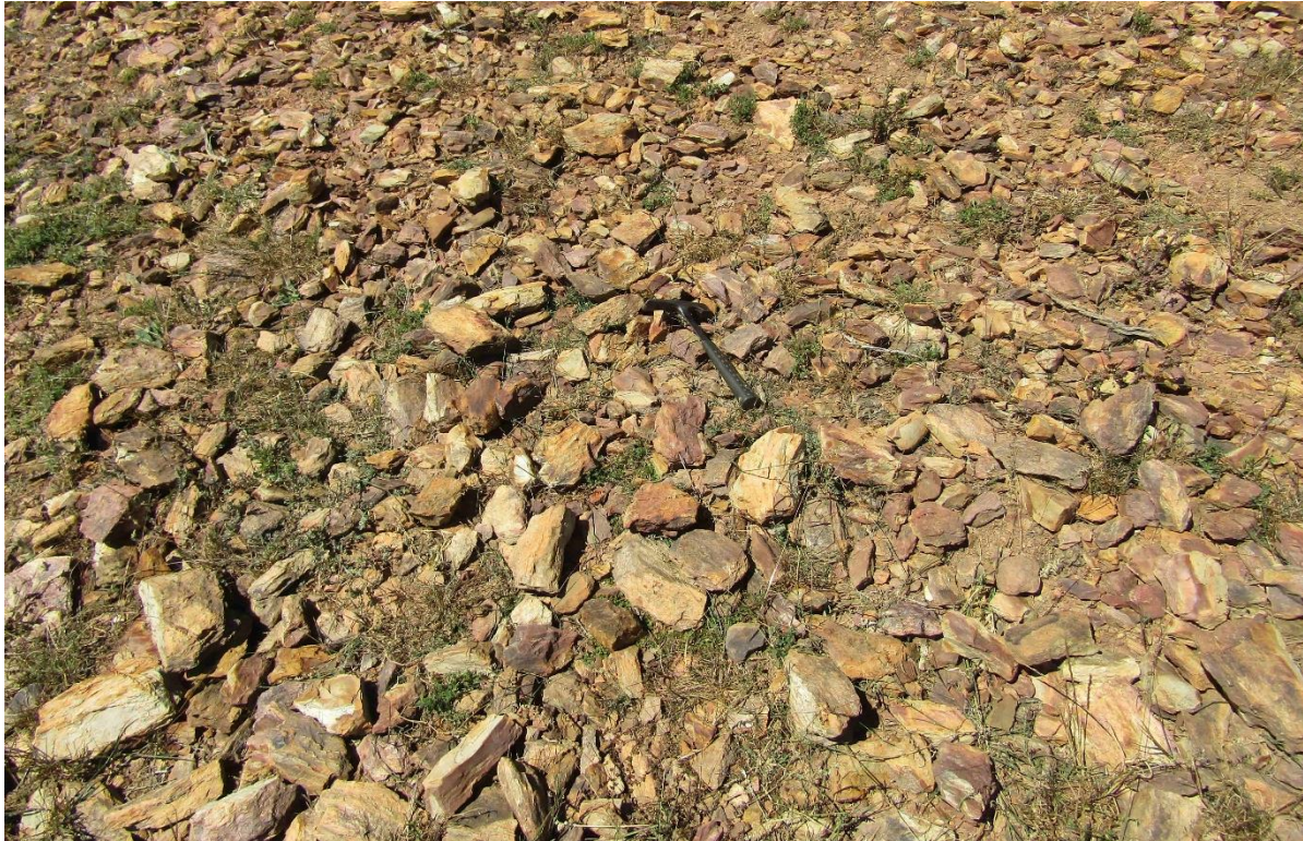
Figure 4. Bokkeveld shales in an open field.

The area north of the Hard Dunes is all Bokkeveld shales. The Bokkeveld shales can easily be seen in road and river cuts and in open fields (Figures 4) The Enon formation sediments can be easily distinguished from the shales (Figure 5).