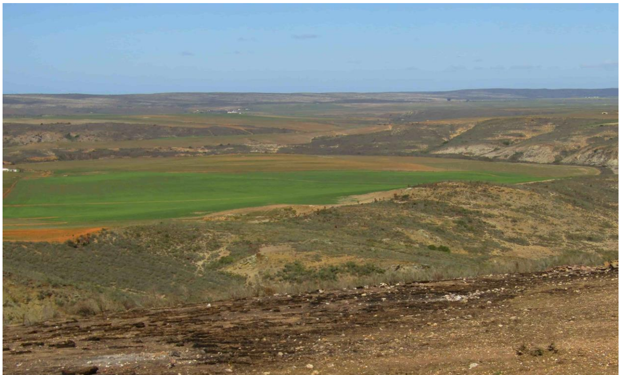
Figure 21. Enon Formation deposits in valleys north of the Soutpansvlakte Basin. View to the south. The distant hills are the Hard Dunes.