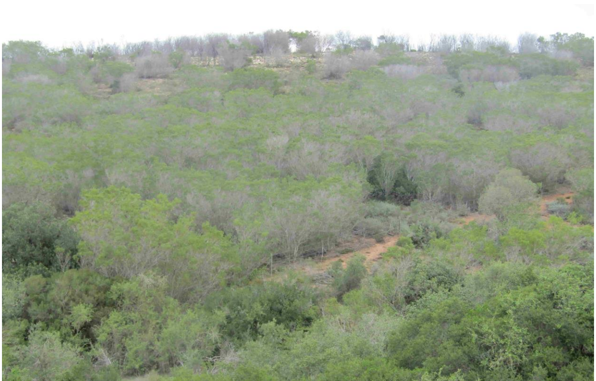
Figure 12. Enon Formation deposits in a ravine, northeast of the Soutpansvlakte Basin. The forest is indicative of the Enon Formation, as these trees do not grow on Bokkeveld Shales.