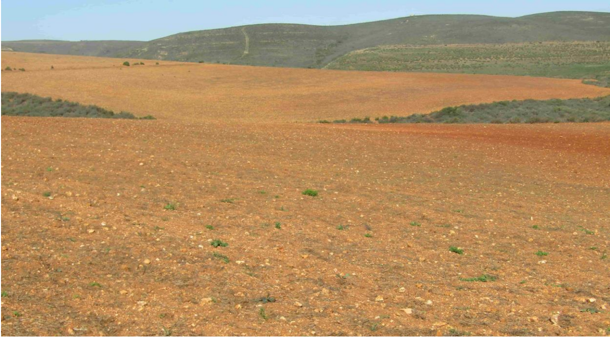
Figure 10. Enon Formation deposits in a valley northeast of the Soutpansvlakte Basin.

The Enon Formation deposits are also found north and east of the Soutpansvlakte Basin, in valleys (Figures 10 and 11), ravines (Figures 12 and 13) and holes and dams dug by farmers (Figure 14).