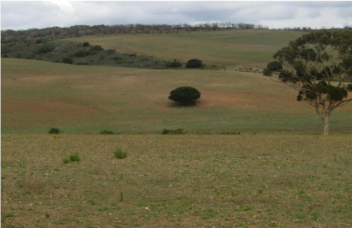
Figure 11. Enon Formation deposits in a valley, northeast of the Soutpansvlakte Basin. The two Milkwood trees in the middle of the photograph are indicative of the Enon Formation deposits (they do not grow where there are only shales (see Appendix Y)).