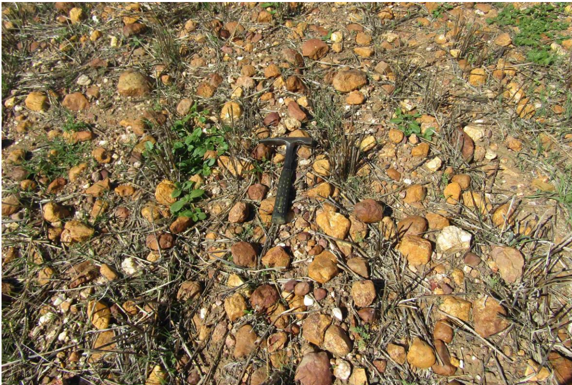
Figure 5. Enon Formation sediments in an open field.