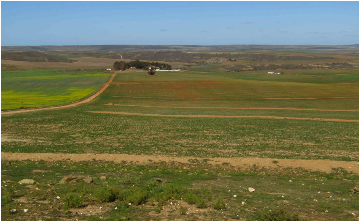
Figure 20. Enon Formation deposits in valleys north of the Soutpansvlakte Basin. View to the south. The distant hills are the Hard Dunes.