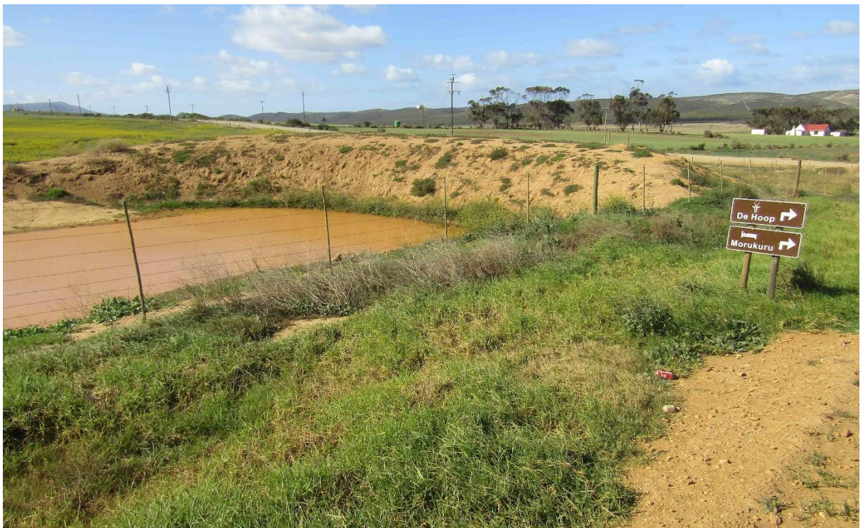
Figure 15. Enon Formation deposits in a dam dug by farmers.