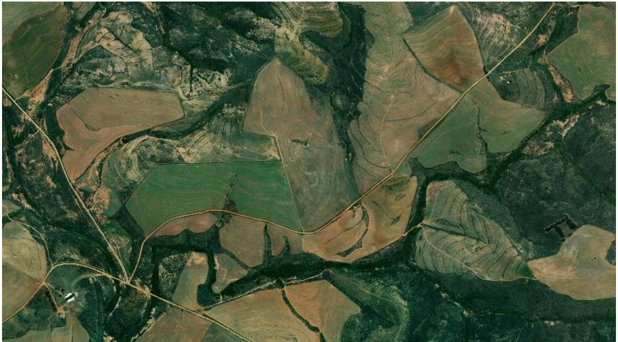
Figure 18. Enon Formation deposits north-east of the Soutpansvlakte Basin (between Brakfontein in the south and Plaatjieskraal in the north).