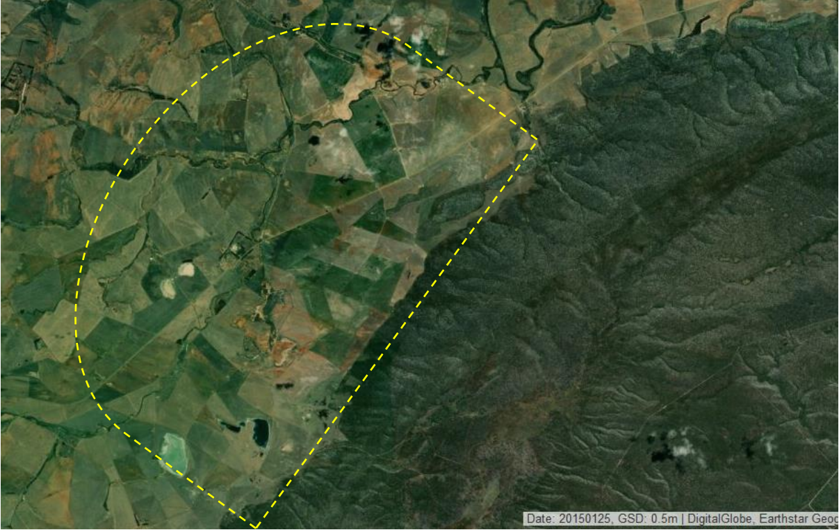
Figure 16. Generalised boundaries of the Soutpansvlakte Basin.

The above photographs show just a few of many locations where the deposits of the Enon Formation – in some areas very thin - were mapped north and east of the Soutpansvlakte Basin. The valley and the extensions are shown below on satellite images (Figures 16 to 19).