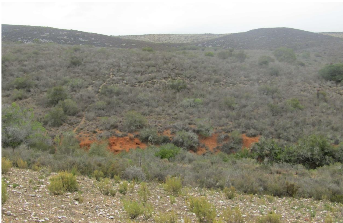
Figure 13. Enon Formation deposits in a ravine.