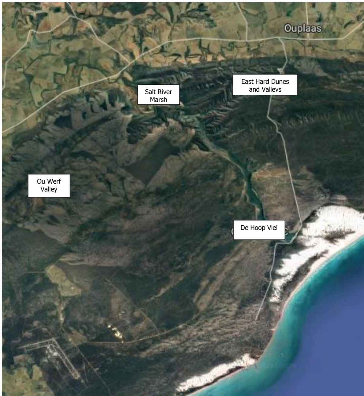
Figure 2. Satellite image of the middle part of the Study Area, showing the areas mentioned in the Field Notes in this chapter,