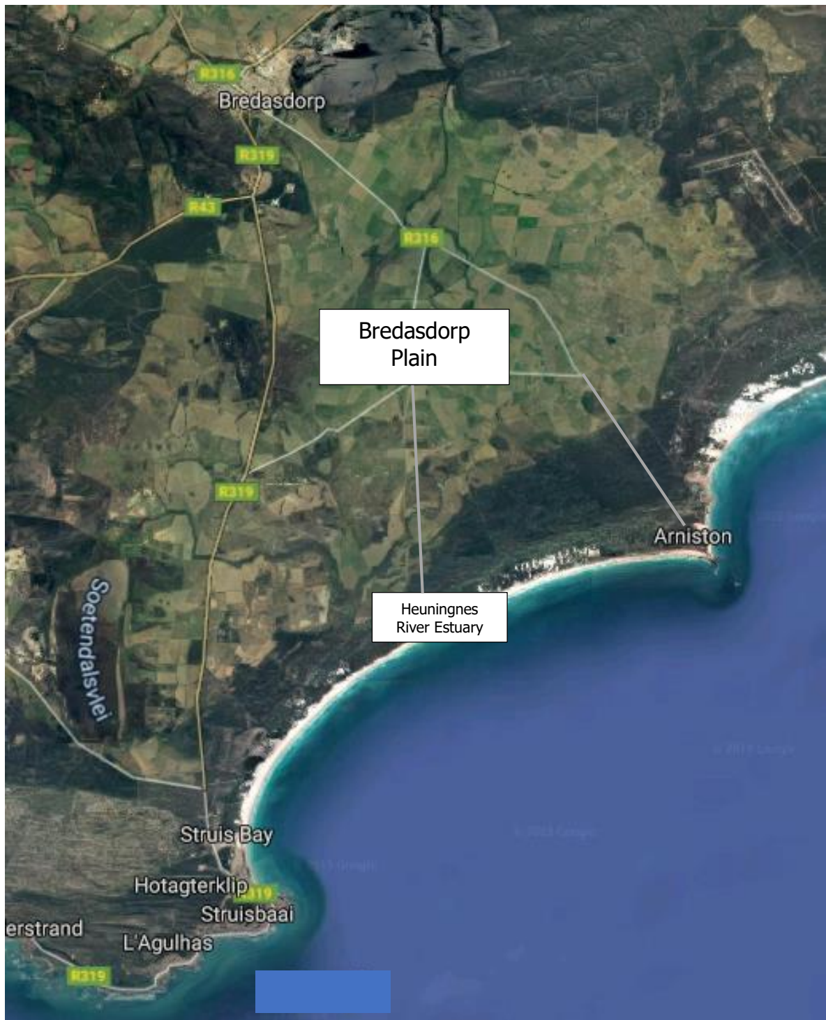
Figure 1. Satellite image of the western part of the Study Area, showing the areas mentioned in the Field Notes in this chapter,