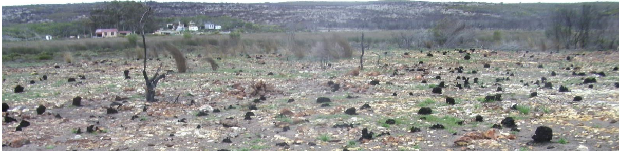
Figure 4. Huts and caravans in the southeast of the valley. View from the west.