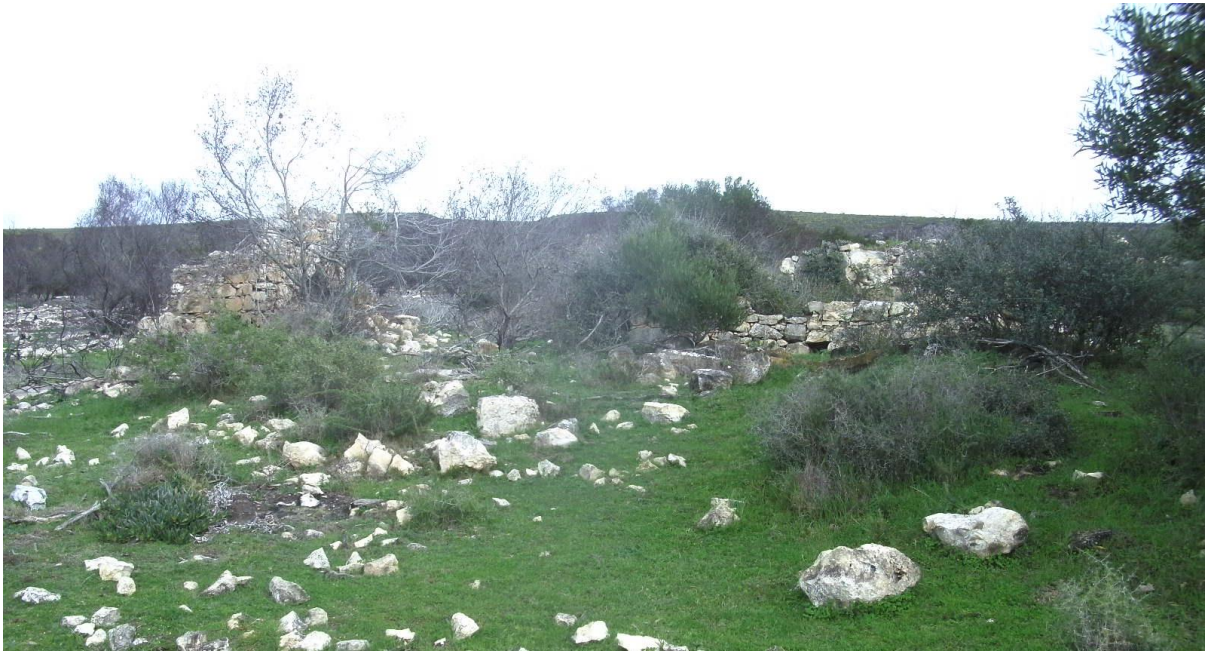
Figure 3. Some of the Ou Werf Farm ruins.