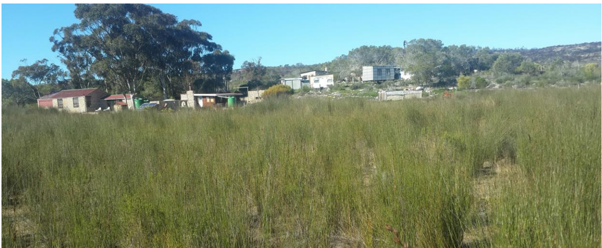
Figure 5. Closer view (from the southwest) of the hut and caravan cluster shown in Figure 4.