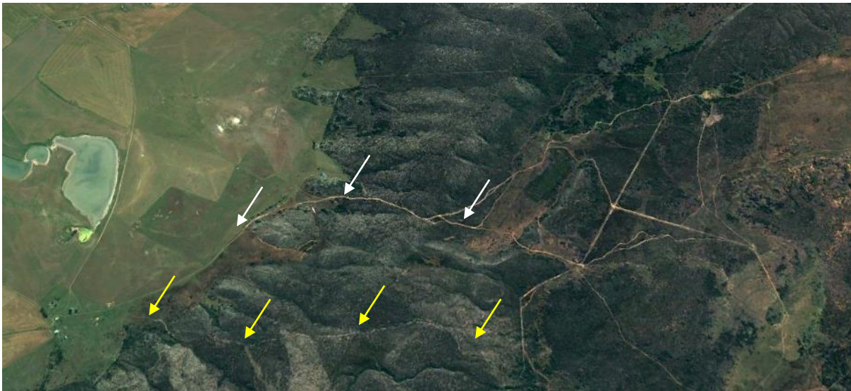
Figure 7. The roads from Soutpansvlakte Farm to the southern part of the Ou Werf Valley: the north road (white arrows) and the south road (yellow arrows).