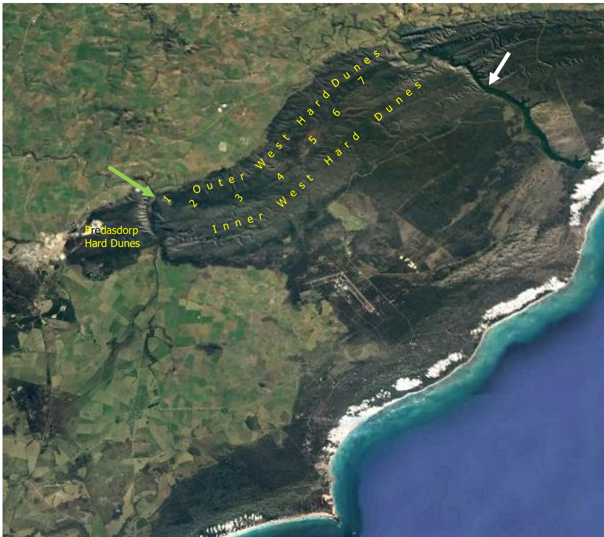
Figure 1. Satellite image of the area west of De Hoop Vlei, showing the West Hard Dunes ranges and the valleys between them [all names were given by the author]. Arrows point on: green - Kars River; white – De Hoop Vlei. Valleys: 1 – West Renoster Valley; 2- East Renoster Valley; 3 – Rietfontein Valley; 4 – Matjesfontein Valley; 5 - Ou Werf Valley; 6 - Hooge Krans Valley; 7 - Patryze Valley. The total length of the valleys is ~20 km.

The valleys are briefly described below and in detail in the following field notes.