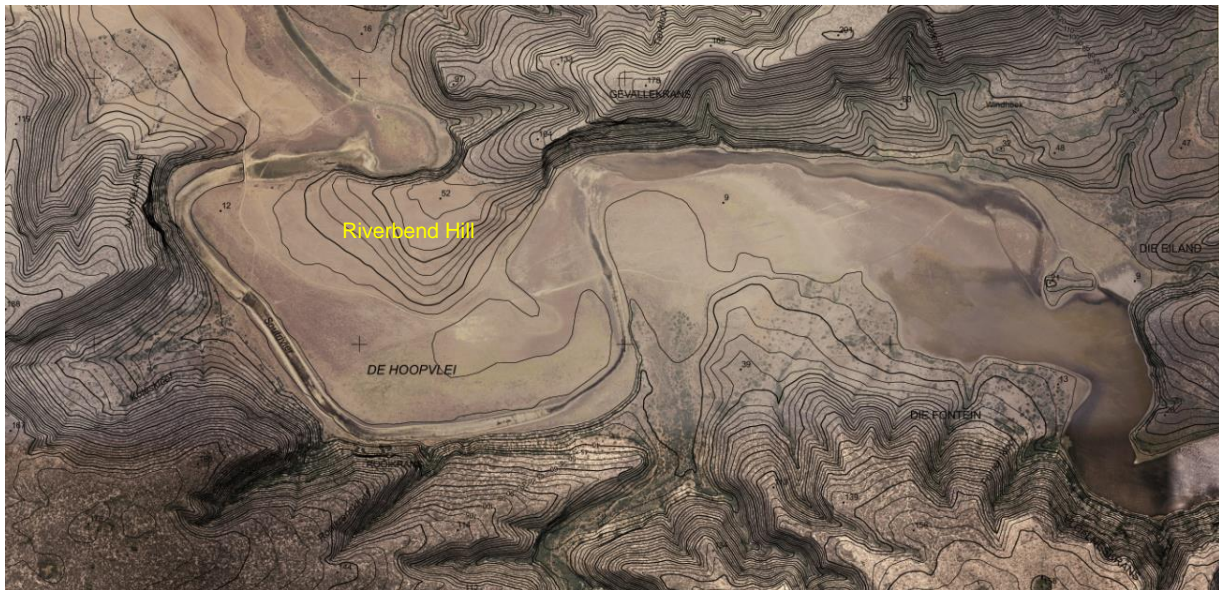
Figure 1. Topographic map of the Salt River Gorge, showing the unusual relief of this feature. The name Riverbend Hill was suggested by the author.

The Salt River Gorge is a 3.5 km long on the W-E direction and 1.2 km wide on the N-S direction (Figures 1, 2 and 3). (It is not a true gorge, as its width is larger than the height of the hills around it). It contains the Salt River Marsh.