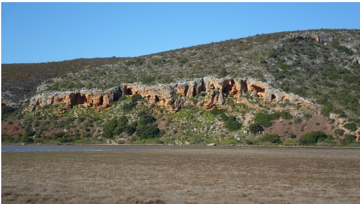
Figure 6. Rookrans, on the south side of the Salt River Gorge.