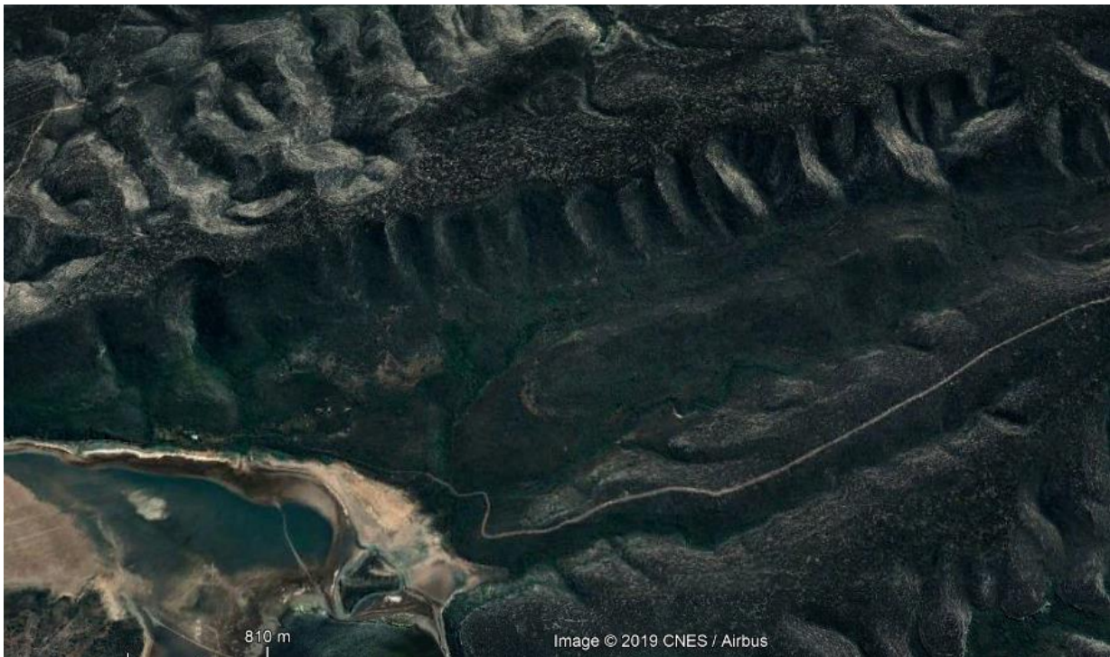
Figure 8. Oubuiterskloof, one of the wide ravines on the north side of the Salt River Gorge.