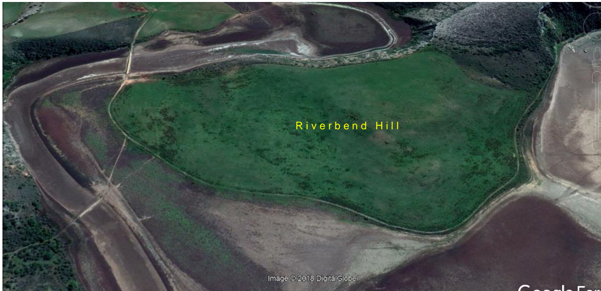
Figure 5. Satellite image of the Riverbend Hill, on the north side of the Salt River Gorge.

The two sides of the gorge do not mirror each other (this feature is not incised in a uniform formation). The main features around the gorge are the Riverbend Hill (Figure 5), steep hills and cliffs (Figure 6), narrow ravines (Figure 7), wide ravines (Figure 8), slopes of the Hard Dunes (Figures 9 and 10), ravine delta (Figure 11) and an island (Figure 12). (These features are described in other Field Notes of this chapter).