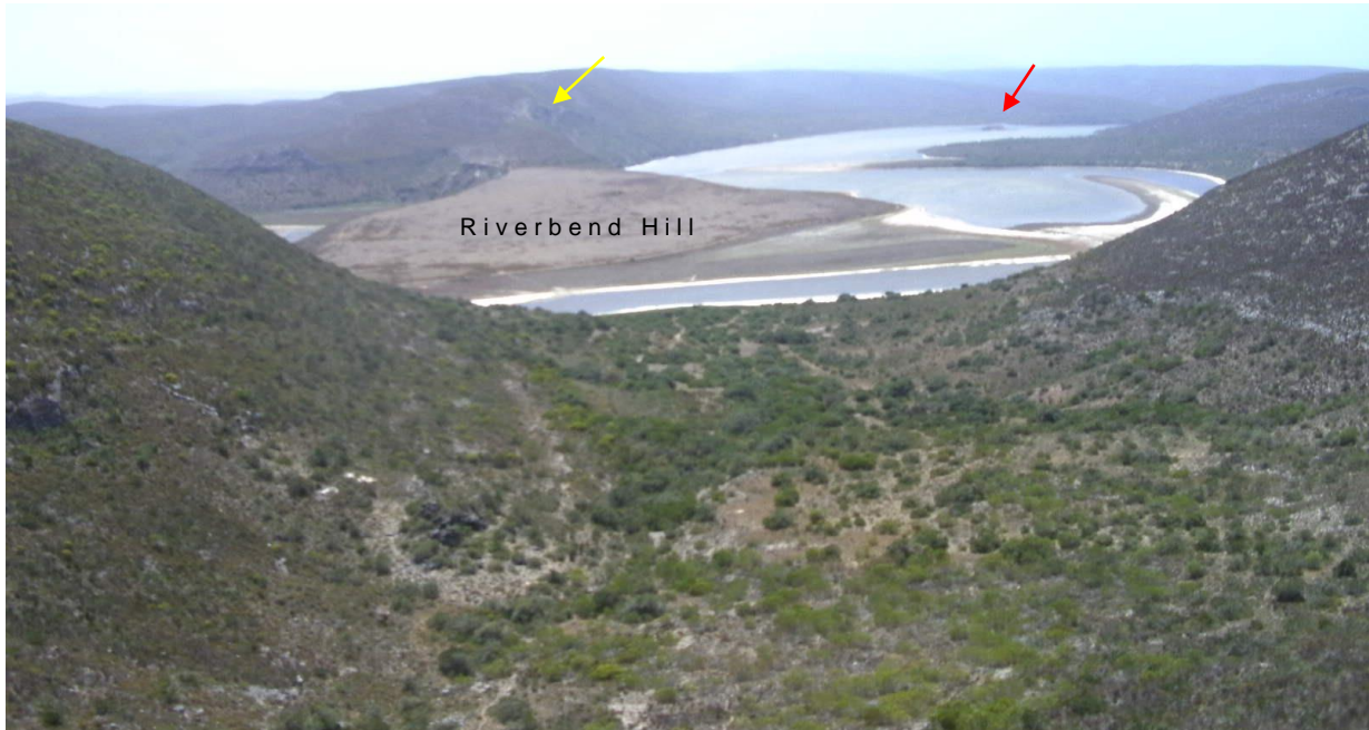
Figure 3. The Salt River Gorge. View to the east from the top of Koleskloof. The yellow arrow points to Gevallekrans; the red arrow points to The Island. The marsh is nearly full.