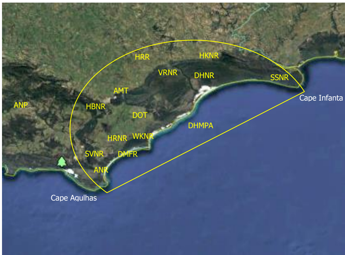
Figure 1. Satellite image showing the confines of the Study Area and the nature reserves and conservatories which are located within its confines. They are (from the southwest to the northeast): ANR – Andrewsfield Nature Reserve (private); De Mond Nature Reserve Complex (Cape Nature) which consists of three reserves: SVNR – Soetendals Vlei Nature Reserve; DMFR – De Mond Forest Reserve and WKNR – Waenhuiskrans Nature Reserve; HRNR - Heunings River Nature Reserve (private); HBNR – Heuninberg Nature Reserve (municipal); AMT – Ancient Milkwood Tree national monument (private); DOTR – Denel Overberg Test Range; VRNR – Vogel Revier ( German spelling ) Nature Reserve (private); HRR – Haarwegskloof Renosterveld Reserve (private); HKNR – Hasekraal Nature Reserve (private); DHNR – De Hoop Nature Reserve (CapeNature); DHMPA – De Hoop Marine Protected Area (CapeNature); and SSNR – San Sebastian Nature Reserve (private). The ANP – Agulhas National Park – is outside the Study Area (Figure 2).

There are several private and public nature reserves in the Study Area (Figure 1). The nature reserves are described briefly in the following Field Notes. The material, which is contained in the Field Notes about public nature reserves was taken from the nature reserves' publications and websites. Readers can find more information on the public nature reserves on the Internet. Very little information is publicly available on the private nature reserves.