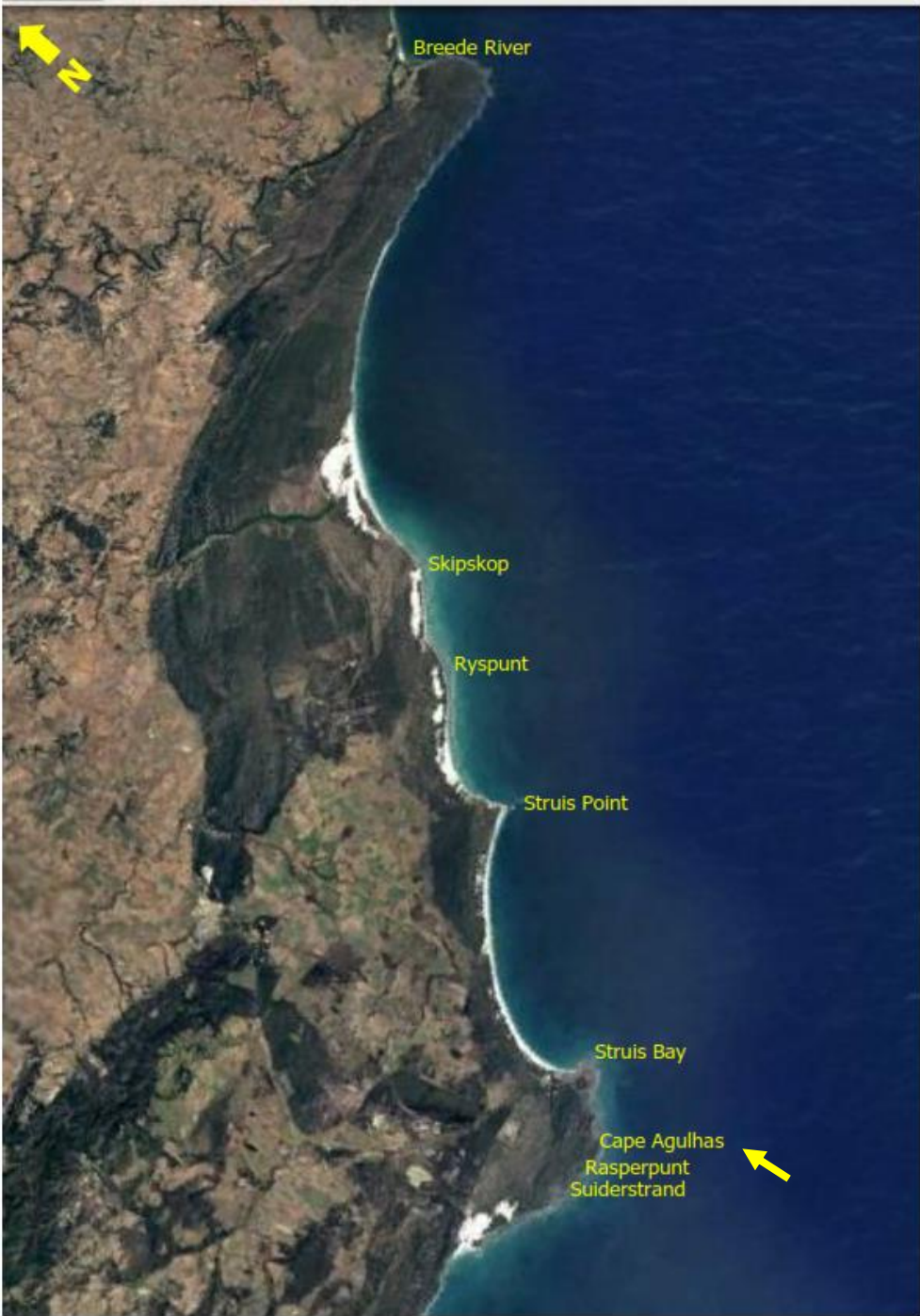
Figure 1. Satellite image (rotated) showing the locations of fish trap clusters in the Study Area. Arrow points to Cape Agulhas.

There are twenty-eight sites of intertidal fish trap clusters along the Cape South Coast, eight of which are along the shores of the Study Area. They are (from southwest to northeast): Suiderstrand, Rasperpunt, Cape Agulhas, Struis Bay, Struis Point, Ryspunt, Skipskop and Breede River, containing in total >100 traps of all shapes and sizes (Figure 1). This Field Note is about the trap cluster near Cape Agulhas (Figures 2 to 5).