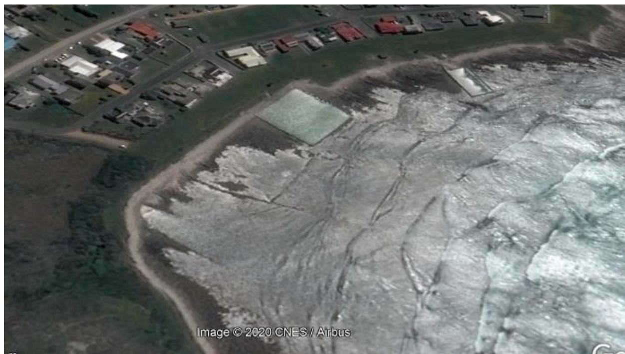
Figure 7. Satellite images of the fish traps near Cape Agulhas. Top – at low tide. Bottom – at high tide.