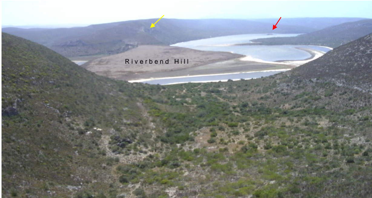
Figure 3. The Salt River Gorge. View to the east from the top of Koleskloof. The yellow arrow points to Gevallekrans; the red arrow points to The Island. The marsh is nearly full.