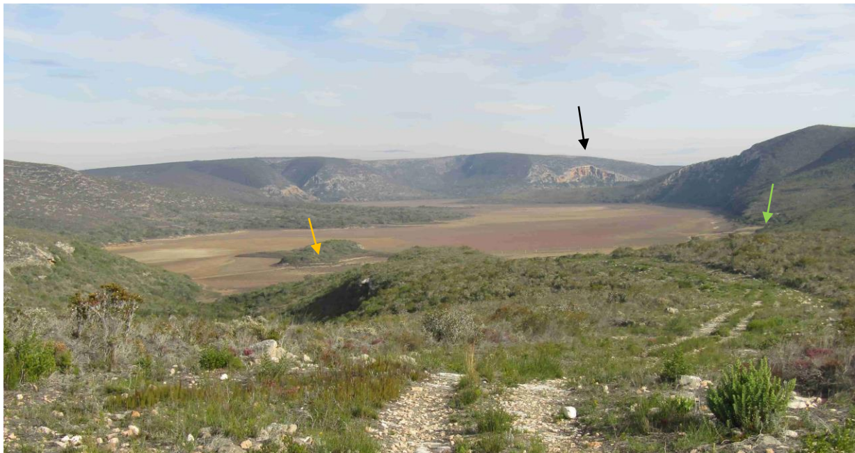
Figure 2. The Salt River Gorge. View to the west from the road to the Windhoek Farm. Black arrow points to Aasvoëlkrans; yellow arrow points to The Island. The marsh is dry; green arrow points to the location of the Windhoek Farm buildings.