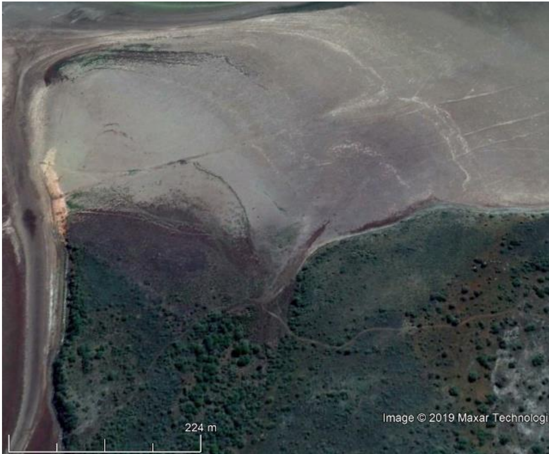
Figure 11. Satellite image of the Langkloof Delta.