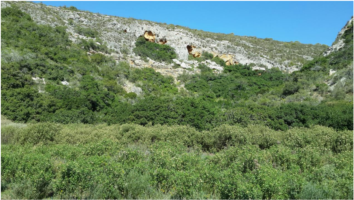
Figure 7. Ghwanogatekloof, one of the narrow ravines on the south side of the Salt River Gorge.