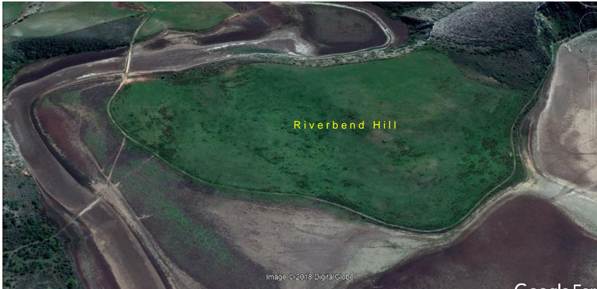
Figure 5. Satellite image of the Riverbend Hill, on the north side of the Salt River Gorge.

The main features around the gorge are the Riverbend Hill (Figure 5), steep hills and cliffs (Figure 6), narrow ravines (Figure 7), wide ravines (Figure 8), slopes of the Hard Dunes (Figures 9 and 10), ravine delta (Figure 11) and an island (Figure 12). (These features are described in other Field Notes of this chapter).