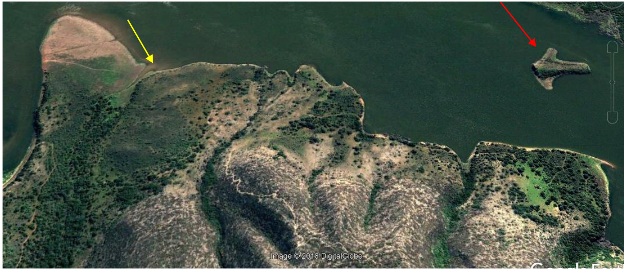
Figure 9. Satellite image showing the slopes of the Hard Dunes on the south side of the Salt River Gorge. The yellow arrow points to the Langkloof Delta (Figure 11); the red arrow points to The Island (Figure 12).