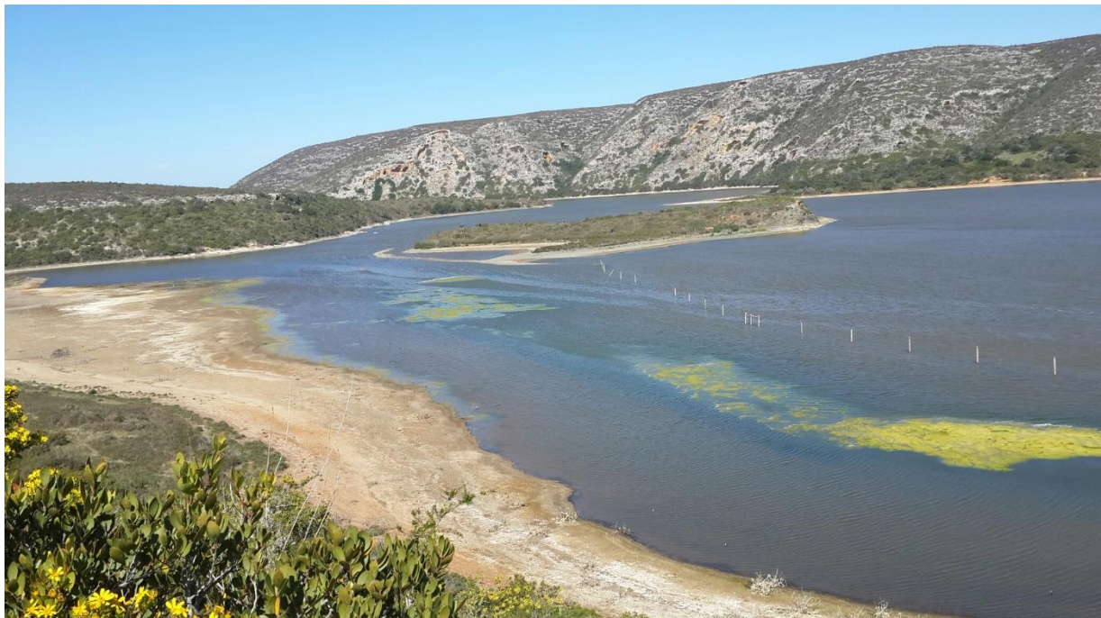
Figure 12. The Island, at the east end of the Salt River Gorge. View to the southeast from the buildings of Windhoek Farm.