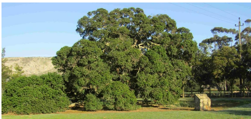
Figure 9. The old milkwood tree (arrow) on the Rhenosterfontein Farm, north of Bredasdorp. Top – satellite image of the area (Bredasdorp is at the bottom-left corner); middle: left - the sign on the R319, at the turn-off to the farmhouse and the gorge; right - the plaque in front of the tree; bottom - the tree and the plaque. (See also Chapter B and Appendix X).