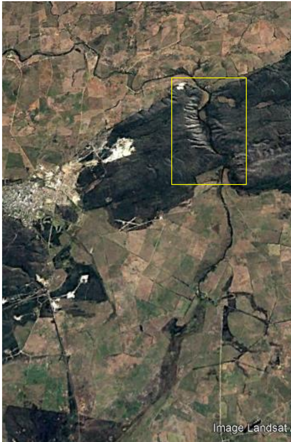
Figure 1. Satellite image of the middle part of the Kars River near Bredasdorp. The box, enlarged in Figure 2, contains the gorge.

The Kars River runs eastwards, from an area ~20 km west of Napier. Northeast of Bredasdorp it turns to the south and goes through a gorge in the Hard Dunes (Figure 1). The morphology of the gorge is the subject of this Field Note.