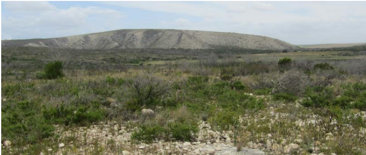
Figure 6. View to the west to the northern section of the west 'wall'.