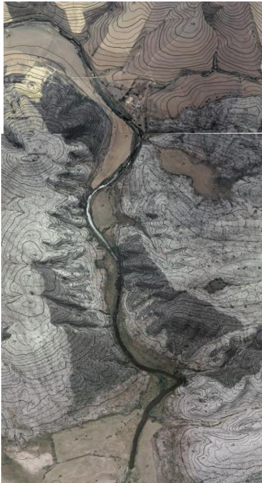
Figure 3. Topography map of the Kars River Gorge.