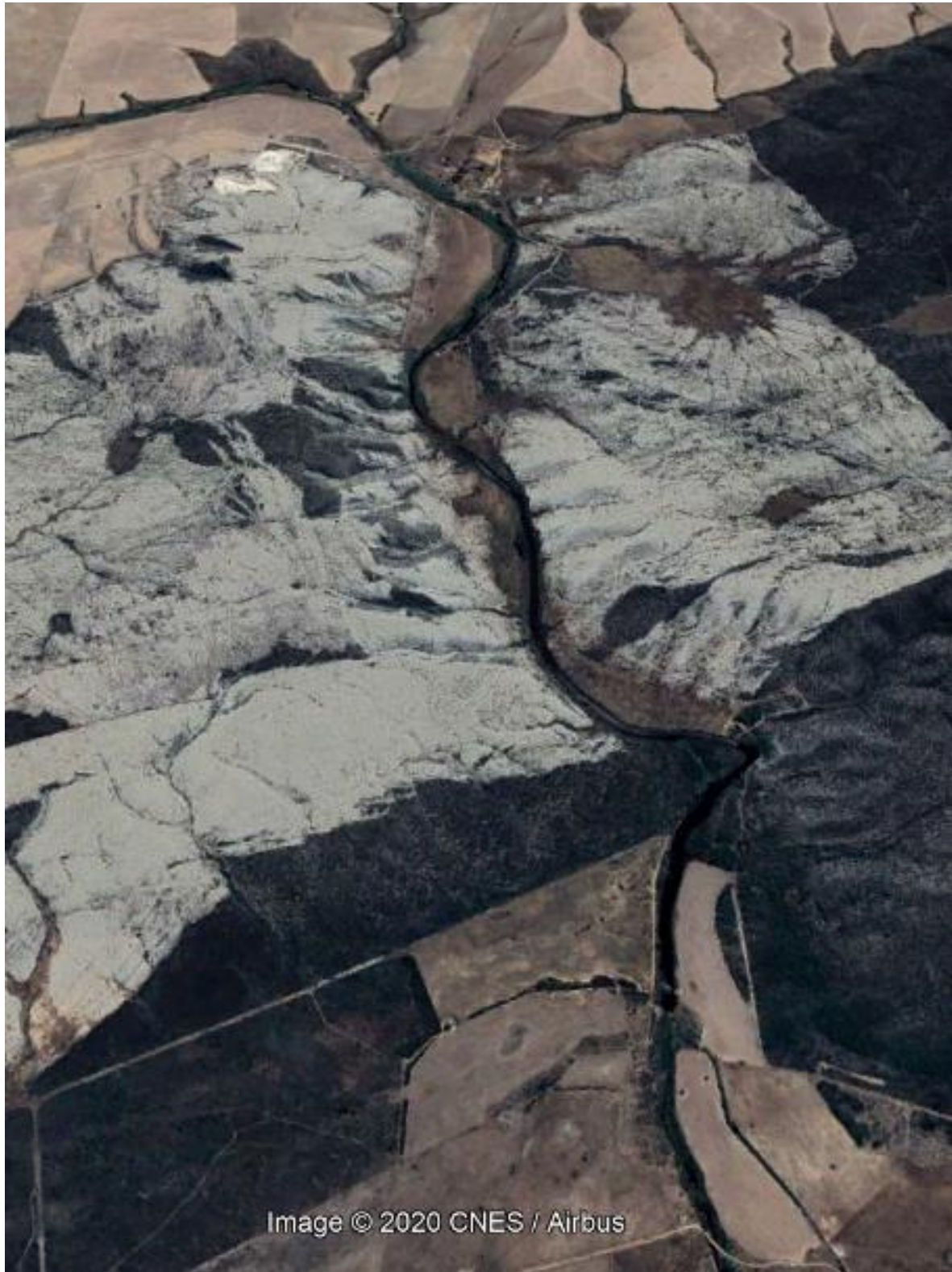
Figure 2. Satellite image of the Kars River Gorge.

The Kars River Gorge is ~4 km long and ~1.2 km wide (Figures 2 and 3). It is not a true gorge, as its width is larger than the height of its 'walls' which also do not mirror each other.