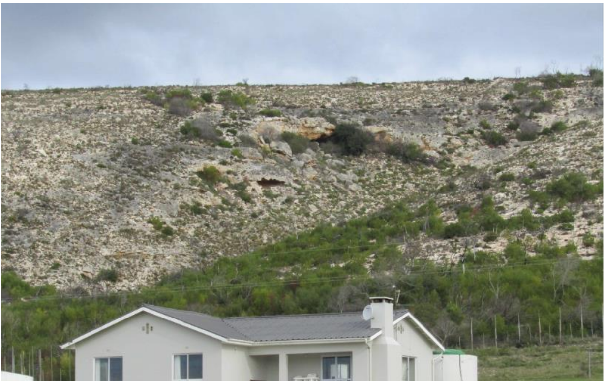
Figure 8. View into a ravine with karst landforms, at the north section of the west 'wall'. Top – to the west, from the east side of the gorge; bottom – to the southeast, from a closer point, on the west side of the gorge.