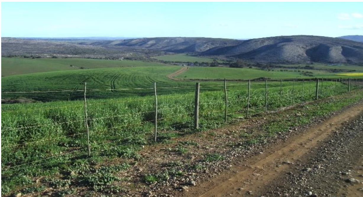
Figure 5. View to the southwest on the Kars River Gorge.