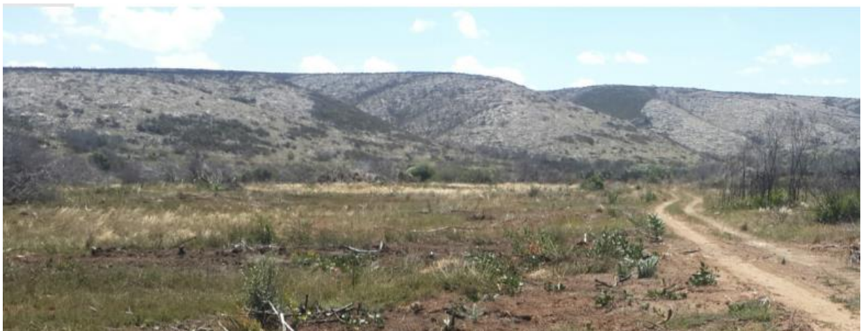
Figure 7. Views to the west 'wall' of the Kars River Gorge. Top – to the southwest, from the north end; bottom – to the northwest, from the south end.