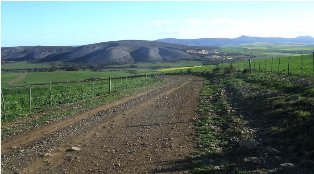
Figure 4. View to the north entrance of the Kars River Gorge.

The 'walls' of the Kars River Gorge (Figures 4 to 7) are different from each other, and the east 'wall' is lower than the west 'wall', which raise the question whether the gorge was formed as a true river incision, or whether tectonic forces were at play. [A similar question is asked about the formation of the Salt River Gorge, some 25 km to the east (Chapter M). The formation of these gorges is discussed in Chapter W].