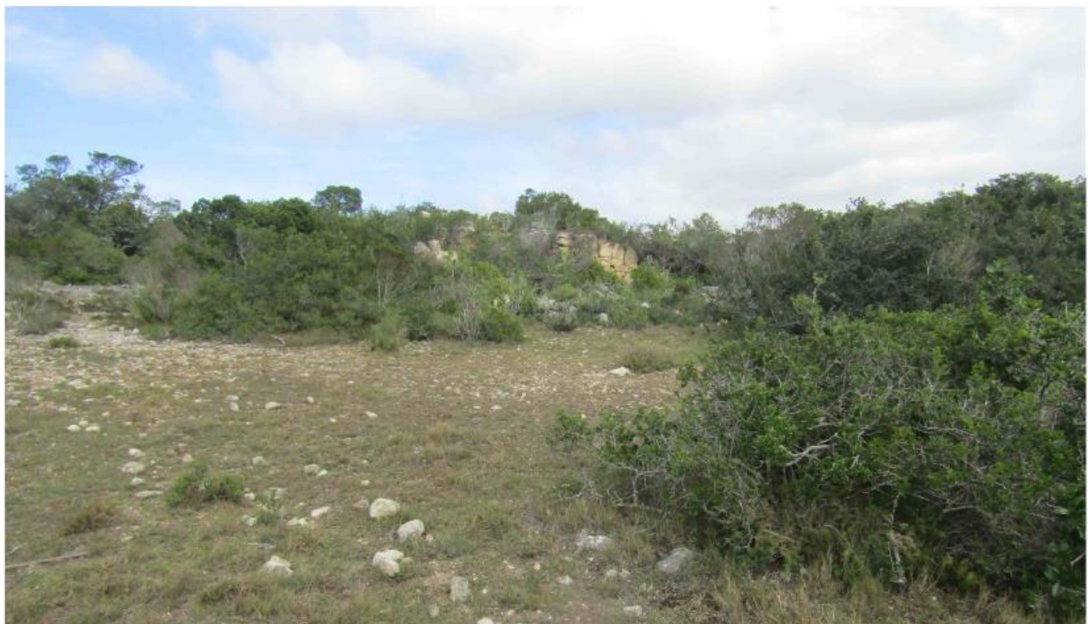
Figure 10. The ruins south of Wasdam se Kloof. View to the north.

The author could not find any information on the Eselkamp and the Wasdam ruins.