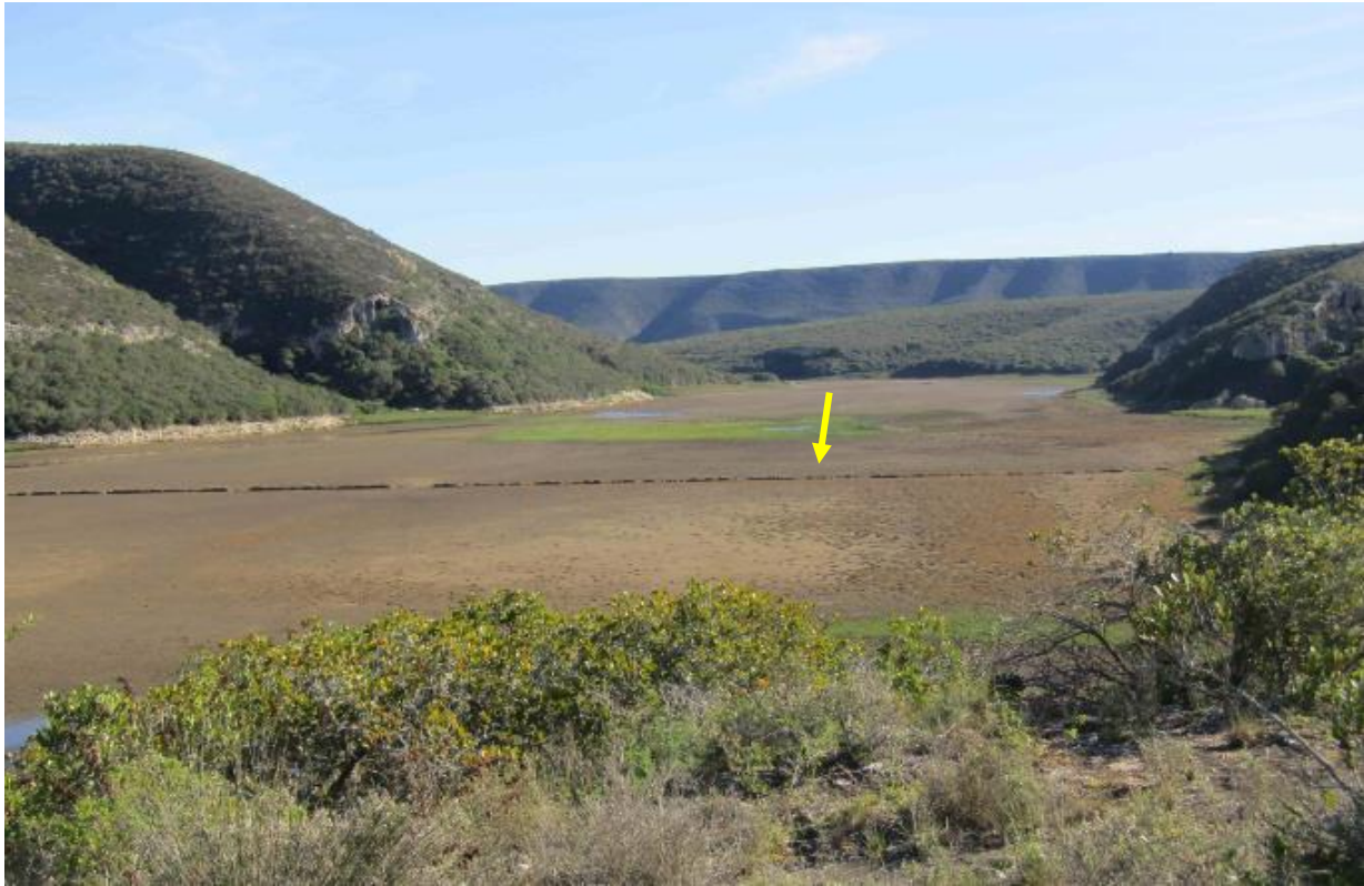
Figure 4. View to the north from the Eselkamp ruins. The wall across the gorge, north of the Eselkloof outlet, is clearly seen (arrow).