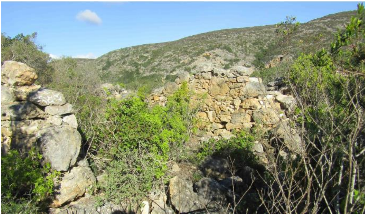
Figure 5. Eselkamp ruins.