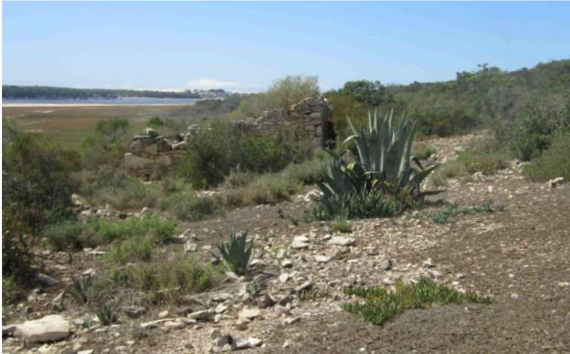
Figure 7. The ruins south of Wasdam se Kloof. View to the southeast.