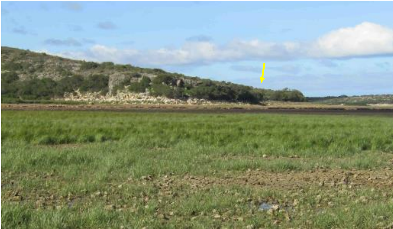
Figure 3. View to the south on the location of the Eselkamp ruins (arrow).

The Eselkamp ruins are situated about 12 m above the vlei floor (Figures 3 and 4).