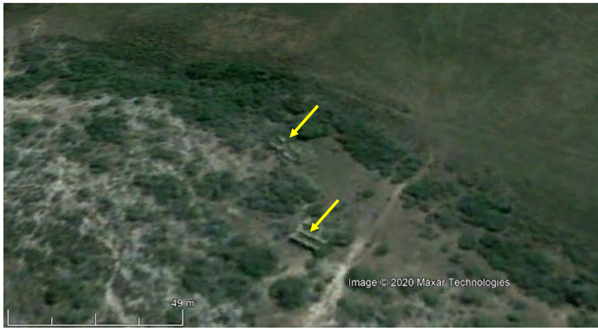
Figure 6. Satellite images of the Wasdam se Kloof ruins (yellow arrows). Top – the vlei is full; bottom – the vlei is dry.