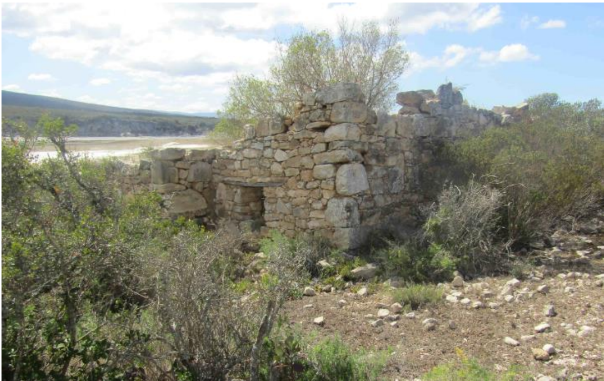
Figure 8. The ruins south of Wasdam se Kloof. View to the southeast.