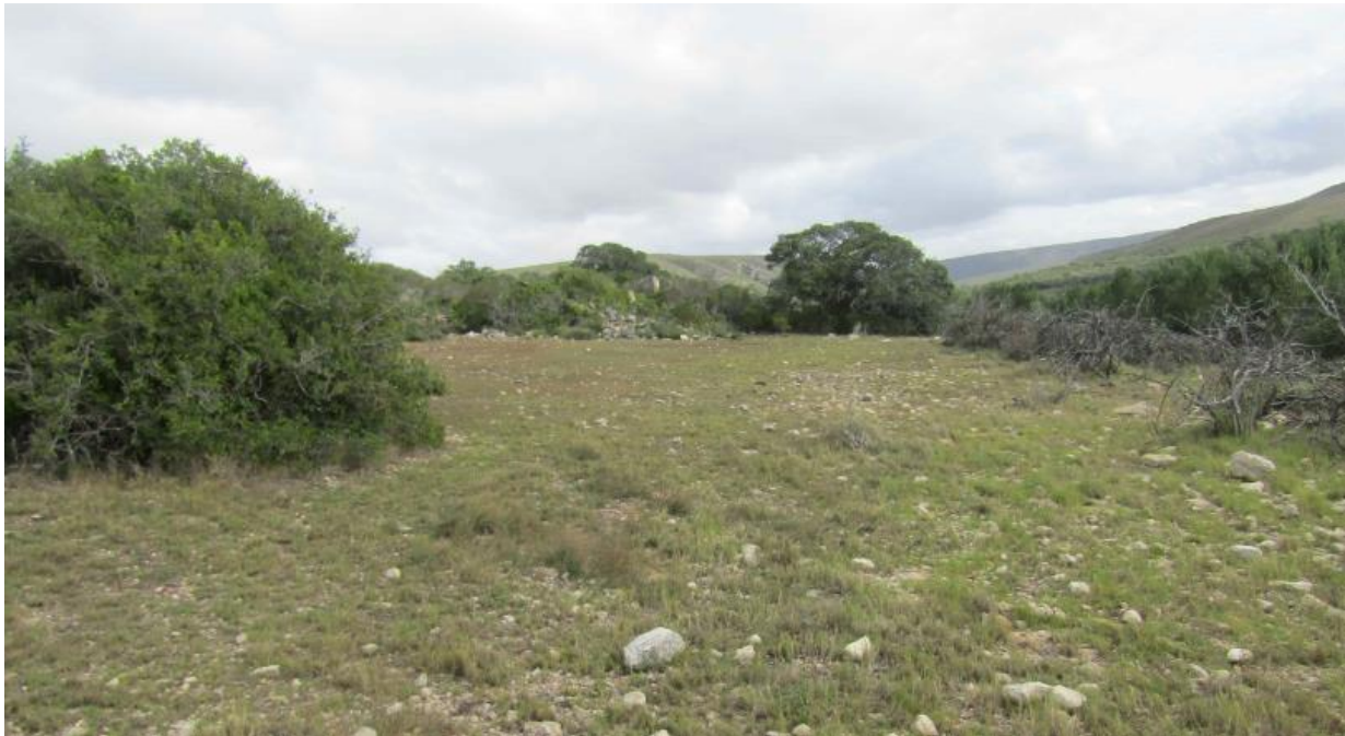
Figure 9. The ruins south of Wasdam se Kloof. View to the north.