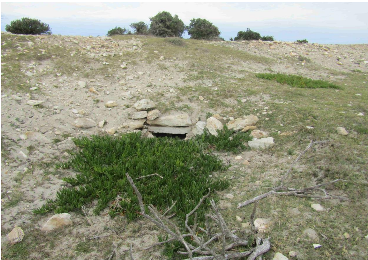
Figure 13. The depression side of the sluice gate in the dyke.