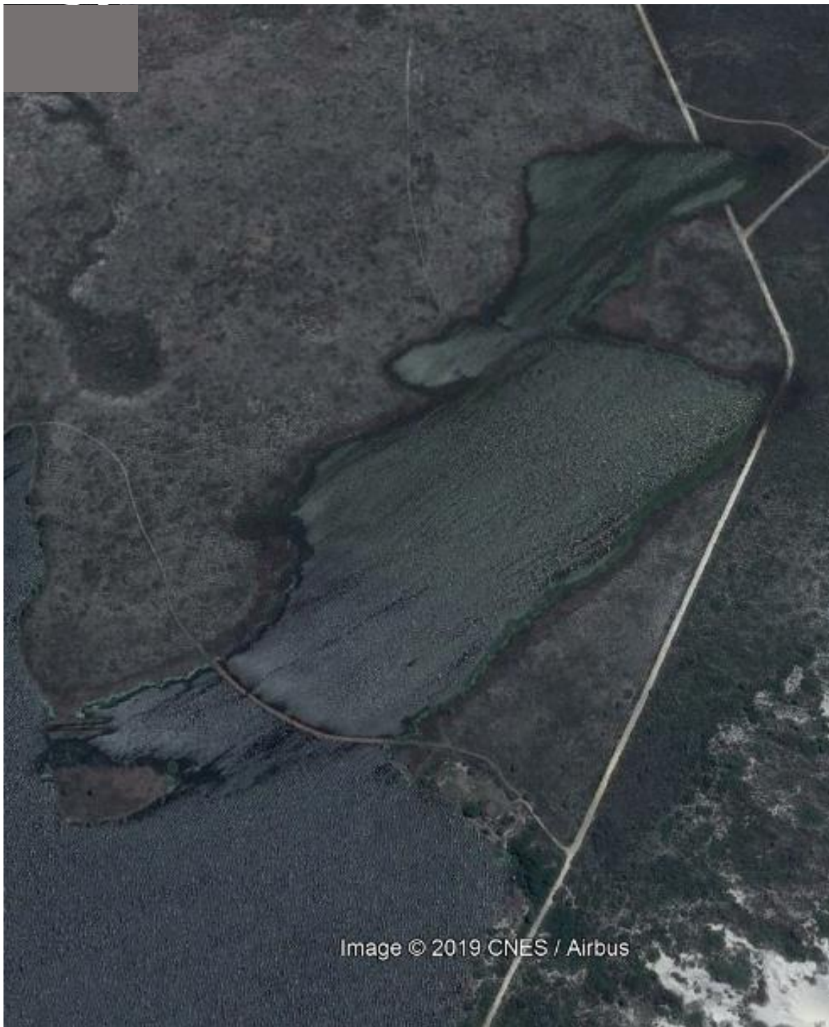
Figure 2. Satellite image of the Die Mond Depression when it was flooded (2014).

Upon the water level in the vlei, the depression is at times full and at times dry (Figures 2 to 8).