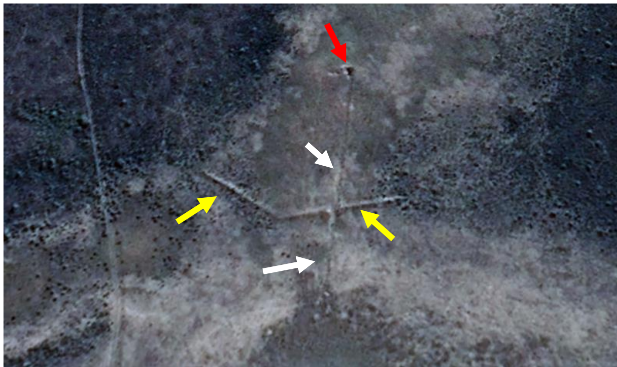
Figure 16. Enlargement of the boxed area in Figure 15. The low dyke (yellow arrows) and the canal (white arrows) can be easily recognised. Red arrow points to a sinkhole (Figure 18).