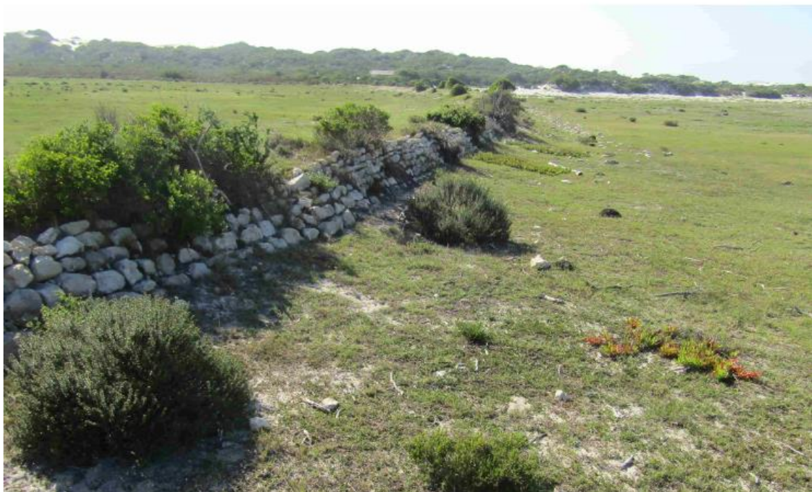
Figure 11. The dyke was cladded on the west (vlei) side. View to the east. The depression is on the left, the vlei on the right.