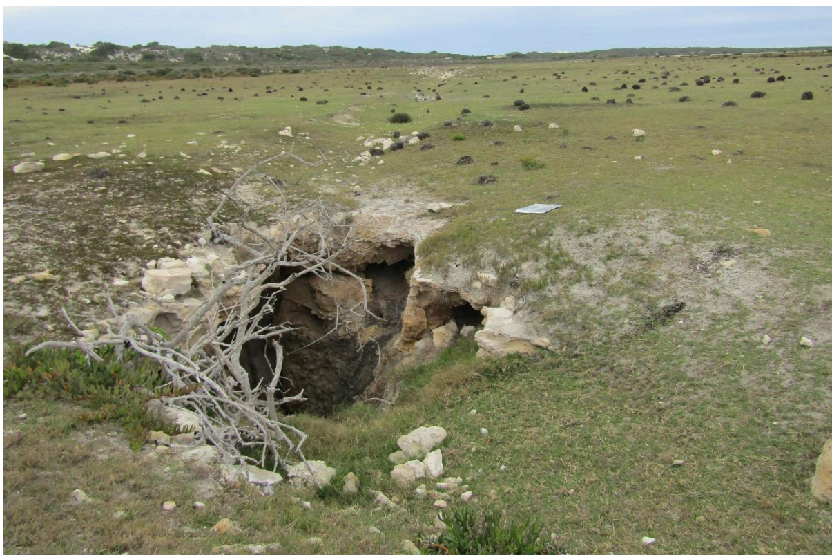
Figure 18. Sinkhole at the back dolines. When a stone was dropped into the hole (Feb 2020) it hit water. Such sinkholes are at the core of the debate on the drainage of the De Hoop Vlei (read below). See also Field Note on karst landforms in this Chapter and Chapter W.