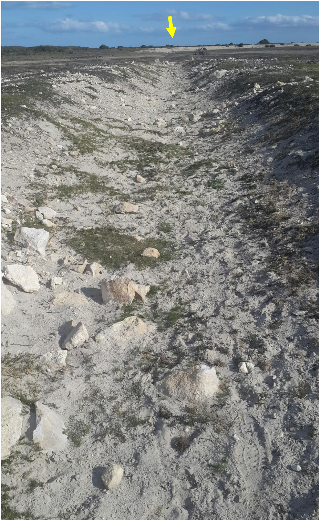
Figure 14. The canal extends from the dyke (arrow) into the middle dolines. View to the south-southwest. (This is probably “Cloete’s Slood”; read the last page of this Field Note).