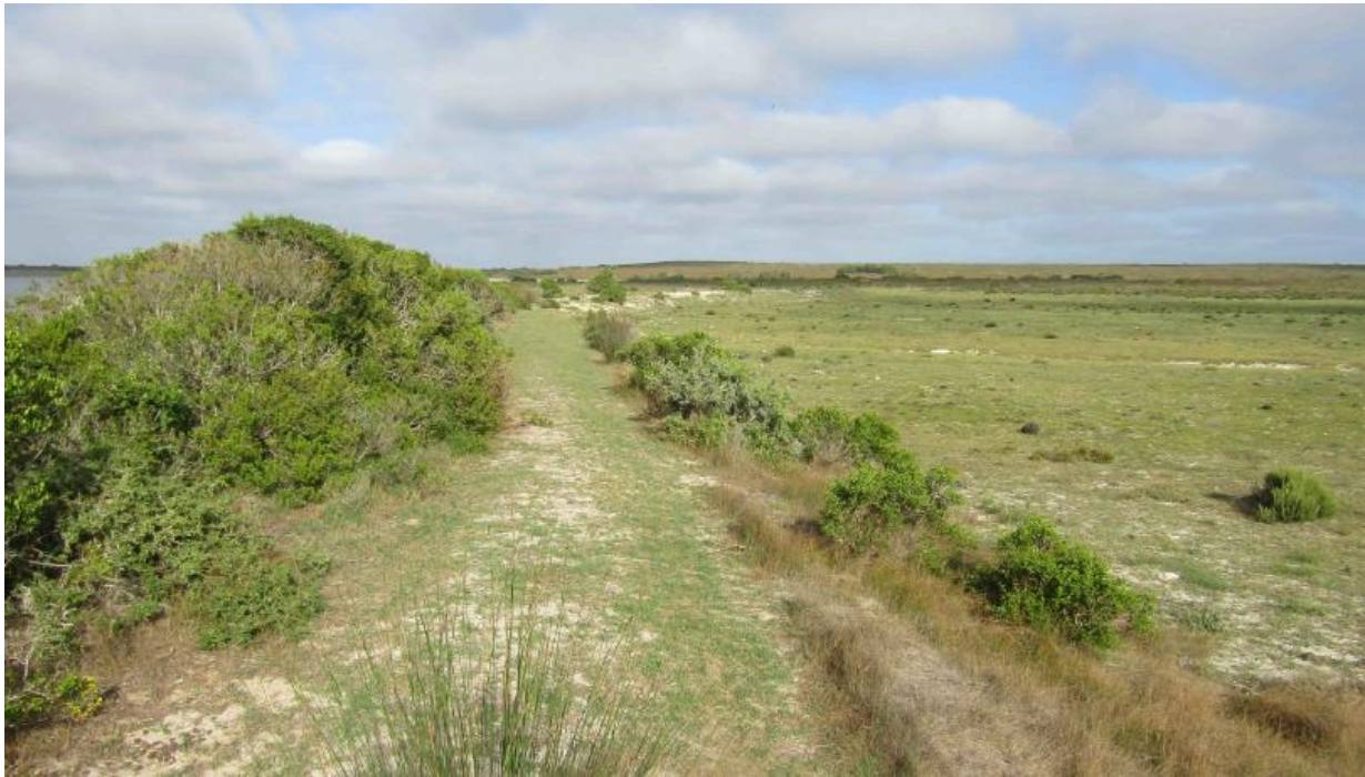
Figure 10. The dyke. View to the northwest. The depression is on the right, the vlei on the left.