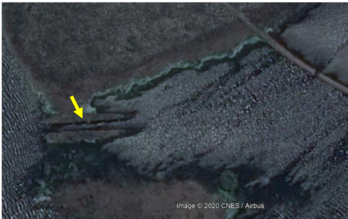
Figure 6. The canal (arrow) to the front doline, full with water, is easily discerned when the depression is flooded.