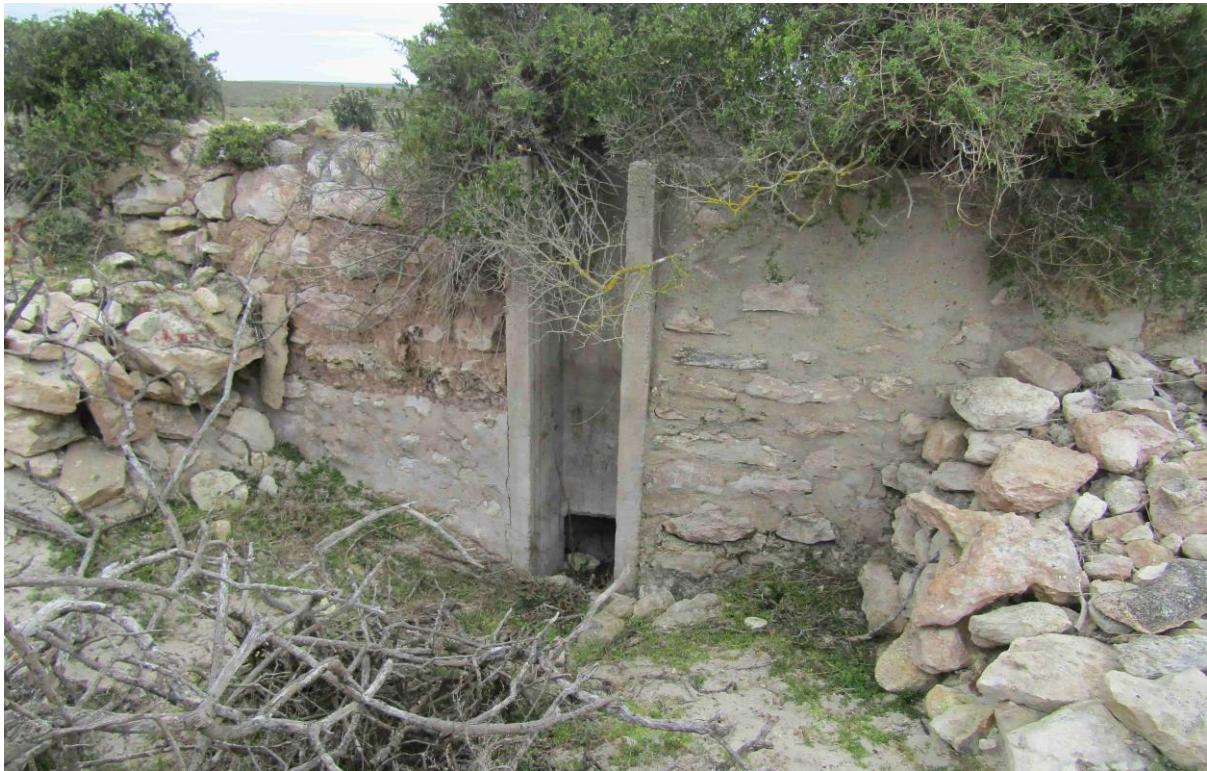
Figure 12. The vlei side of the sluice gate in the dyke.