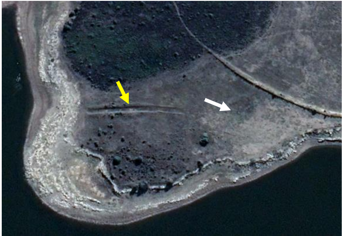
Figure 5. Enlargement of the red box in Figure 4. Yellow arrow points to a canal, which delivered water to the front doline (white arrow).