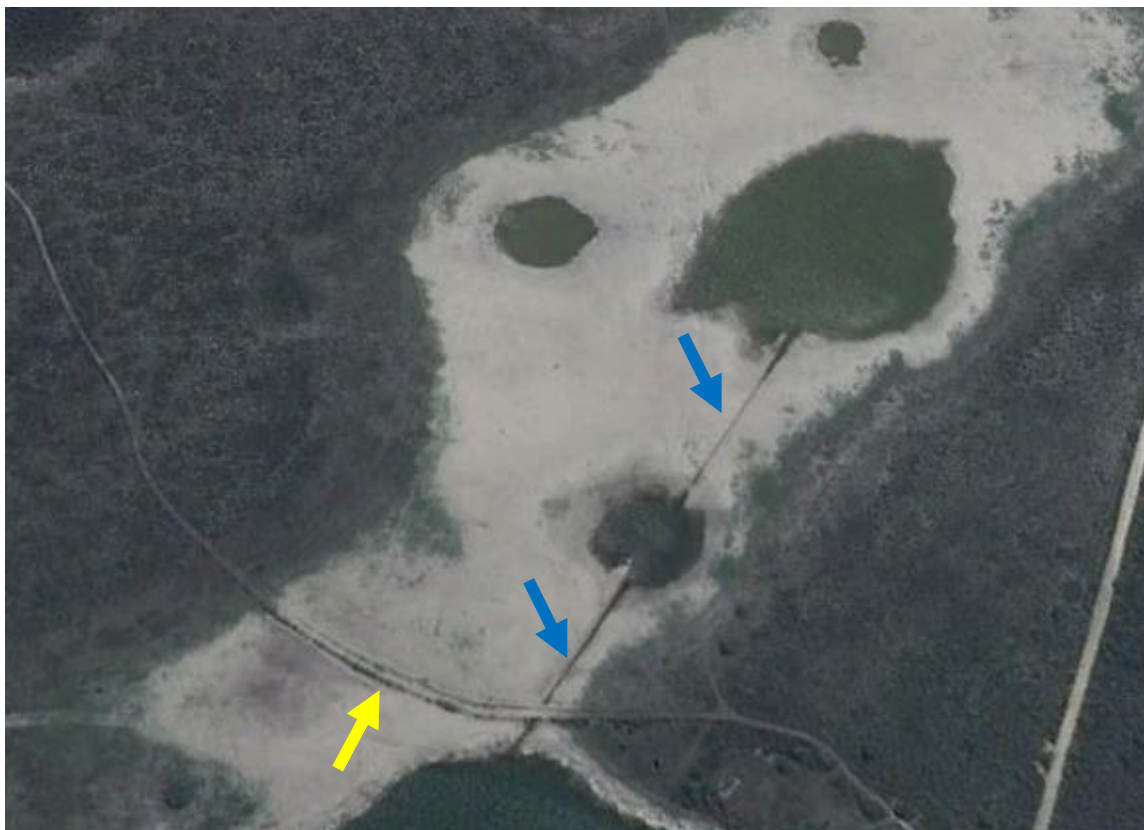
Figure 10. The middle dolines, the dyke (yellow arrow) and the canal (blue arrows).