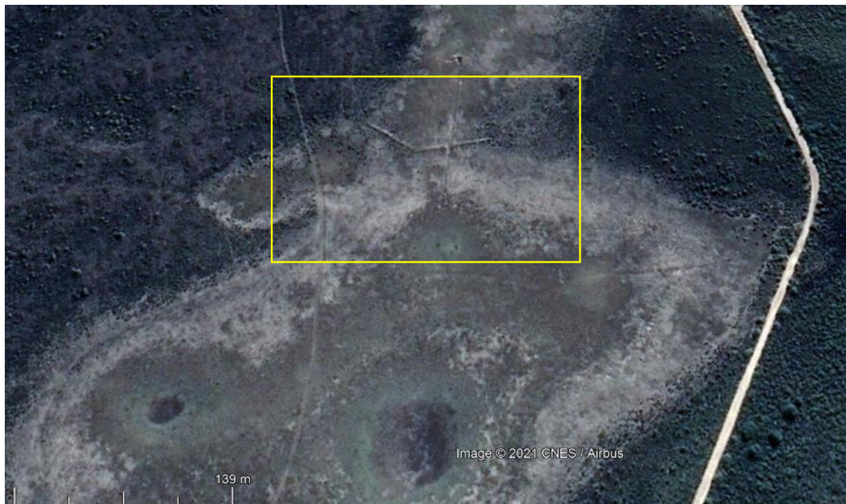
Figure 15. The area between the middle and the back dolines.

The back dolines were also walled, and a canal was cut into them from the middle dolines (Figures 15 to 18).