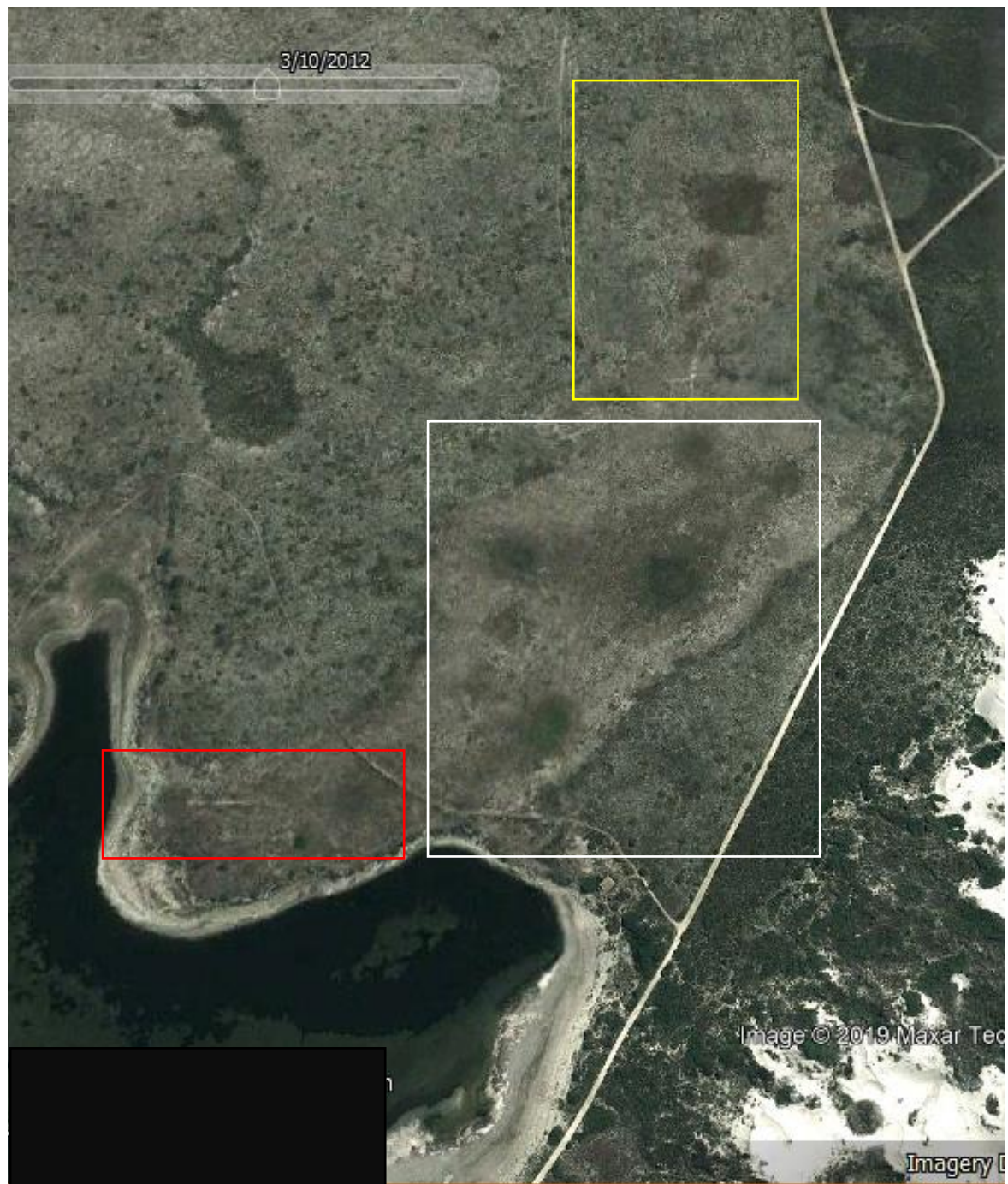
Figure 4. Satellite image of the Die Mond Depression when it is dry. Box colours indicate: red – front doline; white – middle dolines; yellow – back dolines.