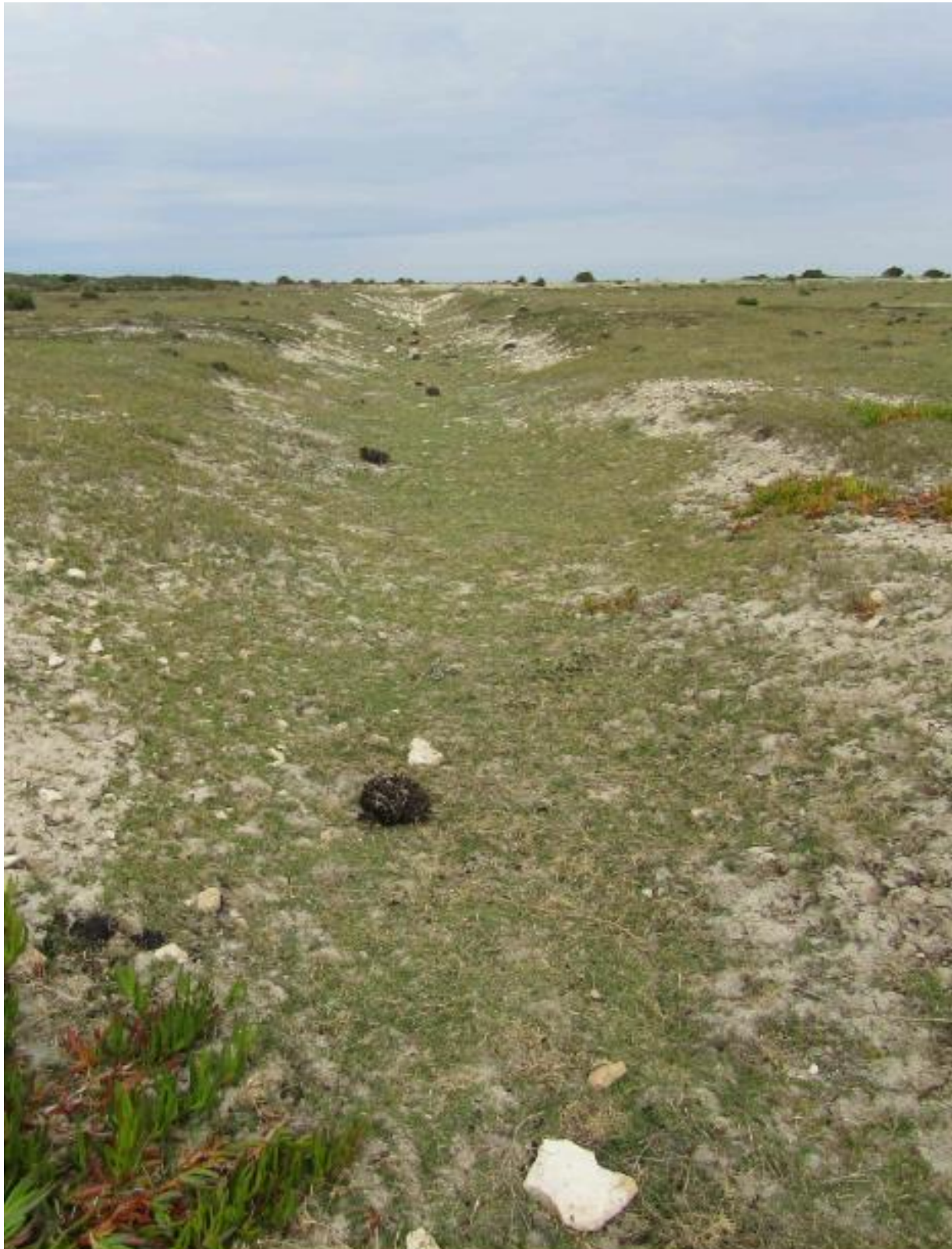
The canal which connects the vlei to the dams.