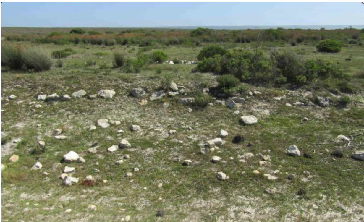
Figure 7. Top and bottom: the walls of the canal were cladded with stones, to prevent erosion. The cladding has disintegrated with time.