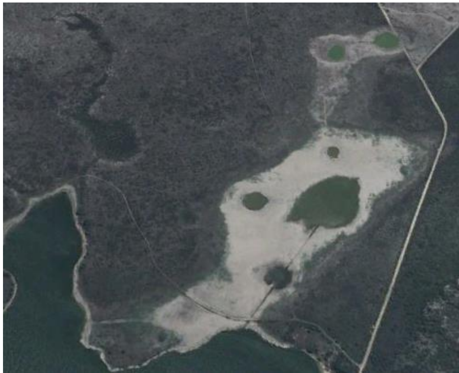
Figure 9. Satellite image of the dolines, containing water.

To store water in the depression, a dyke was built across it and a canal was dug, to deliver water from the vlei to the dolines (Figures 9 to 14).