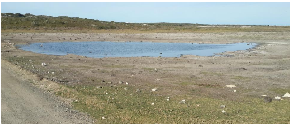
Figure 8. Views on the dolines. Top – from the south on the front (arrow) and middle dolines; Middle - from the south on the back dolines; bottom – from the road, looking southwards on the northernmost back doline.