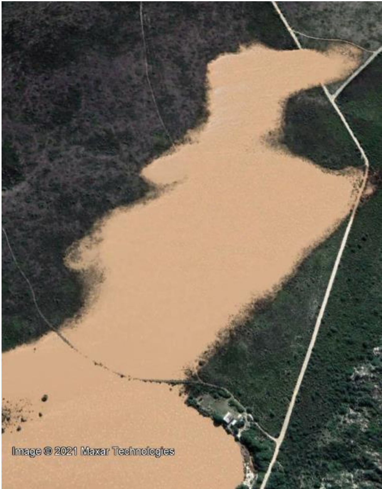
Figure 3. Satellite image of the Die Mond Depression when it was flooded (2021).