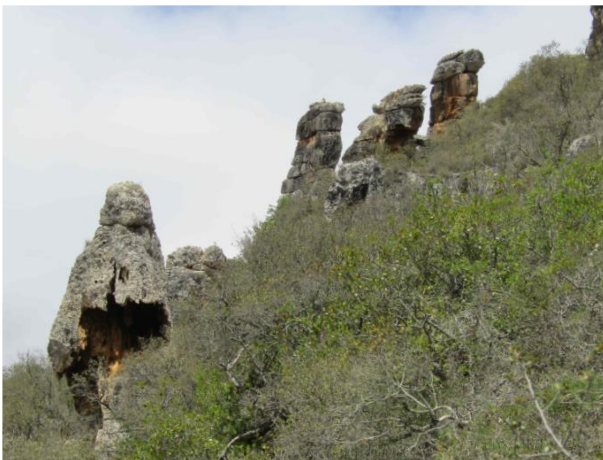
Figure 8. Some of the pinnacles on the slope between Koleskloof and Rooikrans.