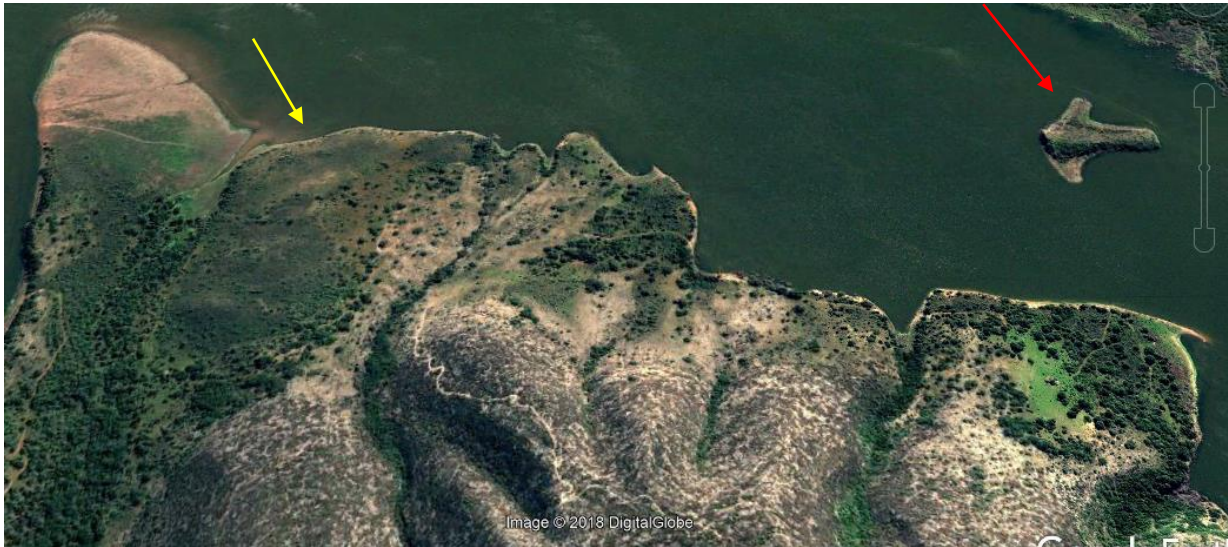
Figure 11. Satellite image showing the slopes of the Hard Dunes on the south side of the Salt River Gorge. The yellow arrow points to the Langkloof Delta (Figure 11); the red arrow points to The Island (Figure 12).