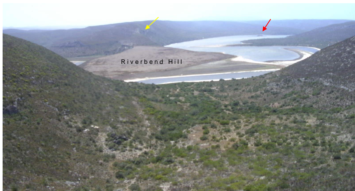
Figure 3. The Salt River Gorge. View to the east from the top of Koleskloof. The yellow arrow points to Gevallekrans; the red arrow points to The Island. The marsh is nearly full.