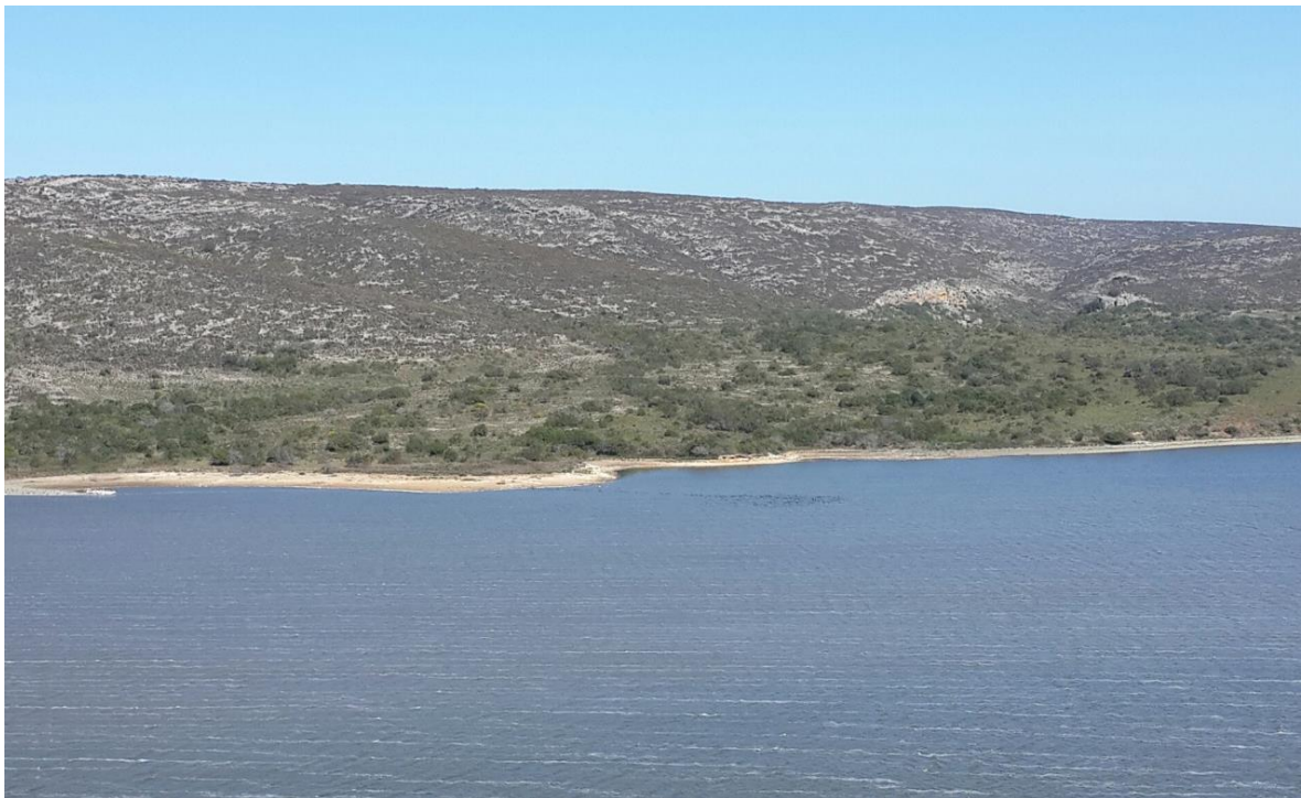
Figure 12. View from the northeast on the slopes of the Hard Dunes, on the south side of the gorge.