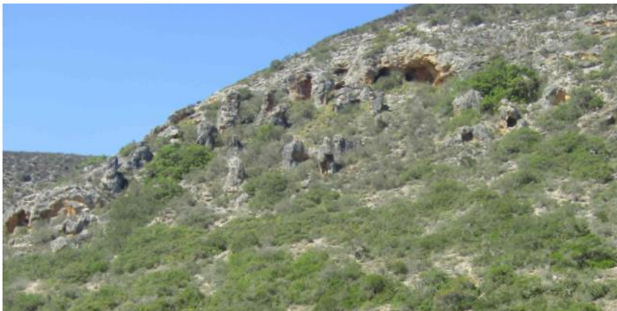
Figure 7. Pinnacles on the slope between Koleskloof and Rooikrans, on the south side of the Salt River Gorge.

A spectacular group of pinnacles is located between Koleskloof and Rooikrans (Figures 7 to 8).