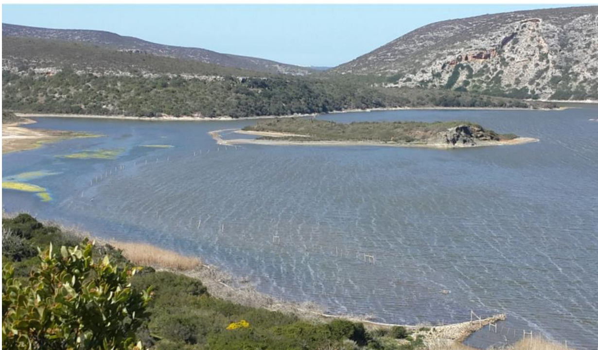
Figure 14. The Island, at the east end of the Salt River Gorge. View to the southeast from the buildings of Windhoek Farm.