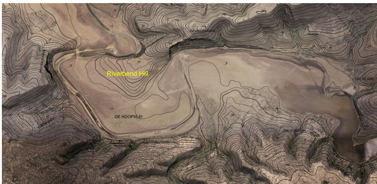
Figure 1. Topographic map of the Salt River Gorge, showing the unusual relief of this feature. The name Riverbend Hill was suggested by the author.

The Salt River Gorge is ~3.5 km long on the W-E direction and ~1.2 km wide on the N-S direction (Figures 1, 2 and 3). (It is not a true gorge, as its width is larger than the height of the hills around it). It contains the Salt River Marsh.