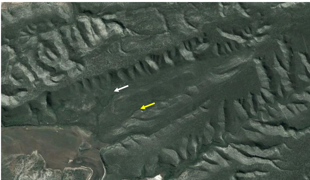
Figure 10. Oubuiterskloof (yellow arrow) and Sandkraal se Kloof (white arrow), two sub-parallel ravines on the east side of the Salt River Gorge.