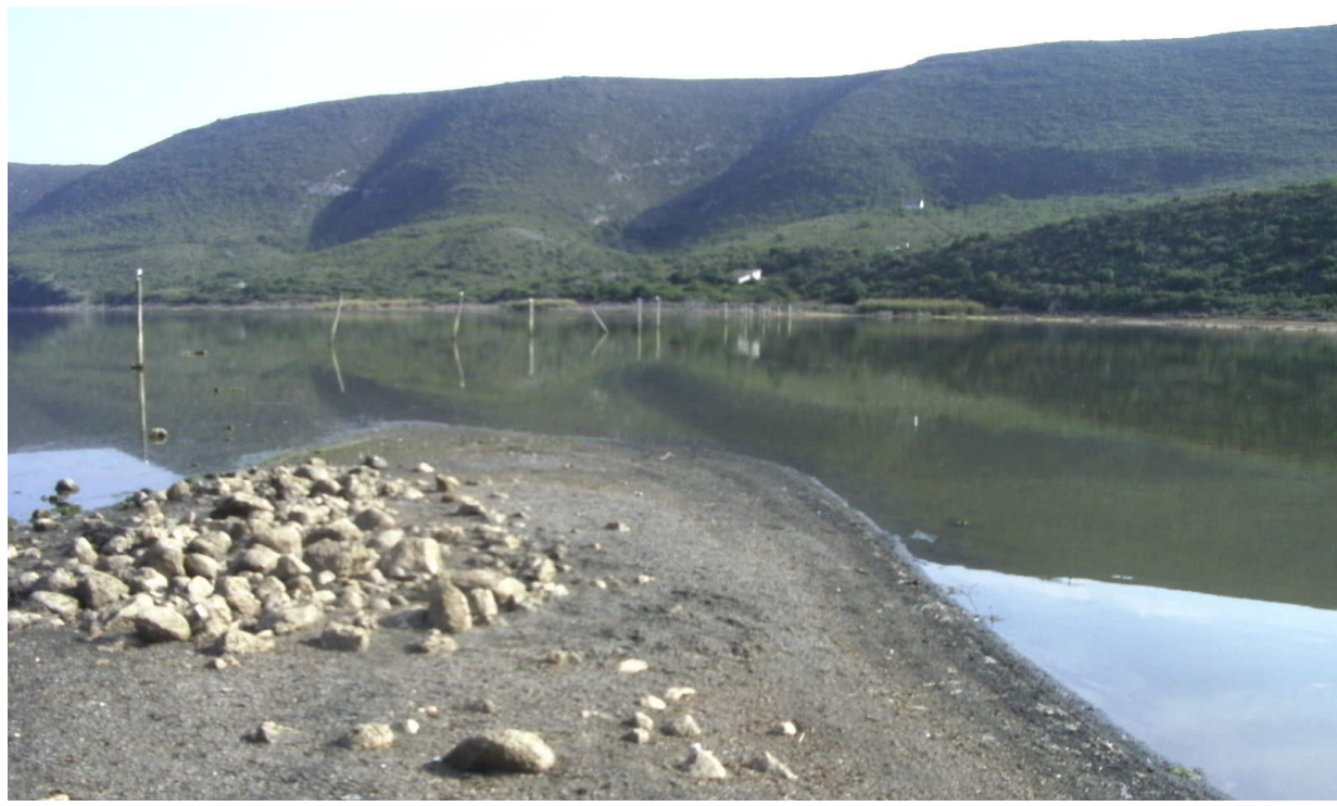
Figure 9. The fence on the north flank of The Island. View to the north on the buildings of the Windhoek Farm.