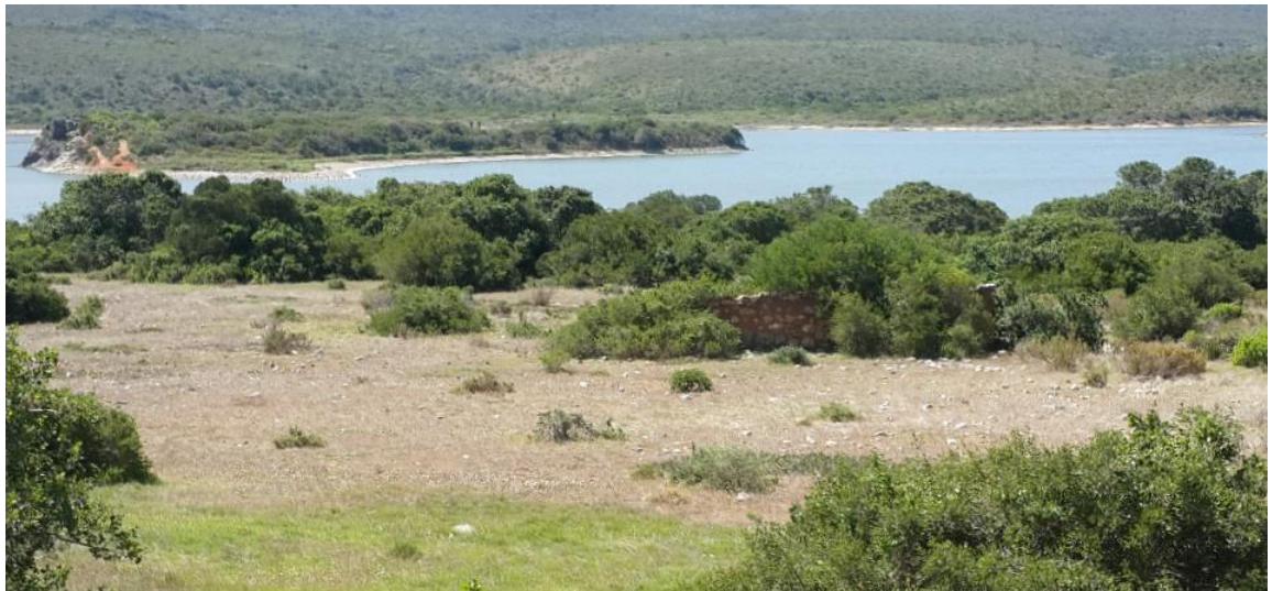
Figure 6. View to the north on The Island from the south shore. The marsh is full.