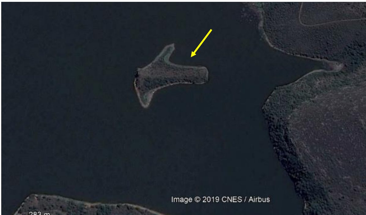
Figure 2. Satellite image showing The Island (arrow) when the water level of the marsh is high.