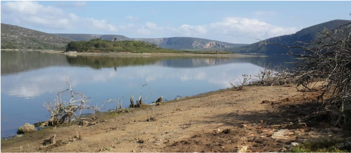
Figure 5. View from the south shore on The Island (blends with the hills behind it).