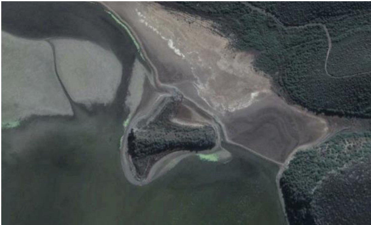
Figure 3. Satellite image of The Island when the water level of the marsh water level is low.