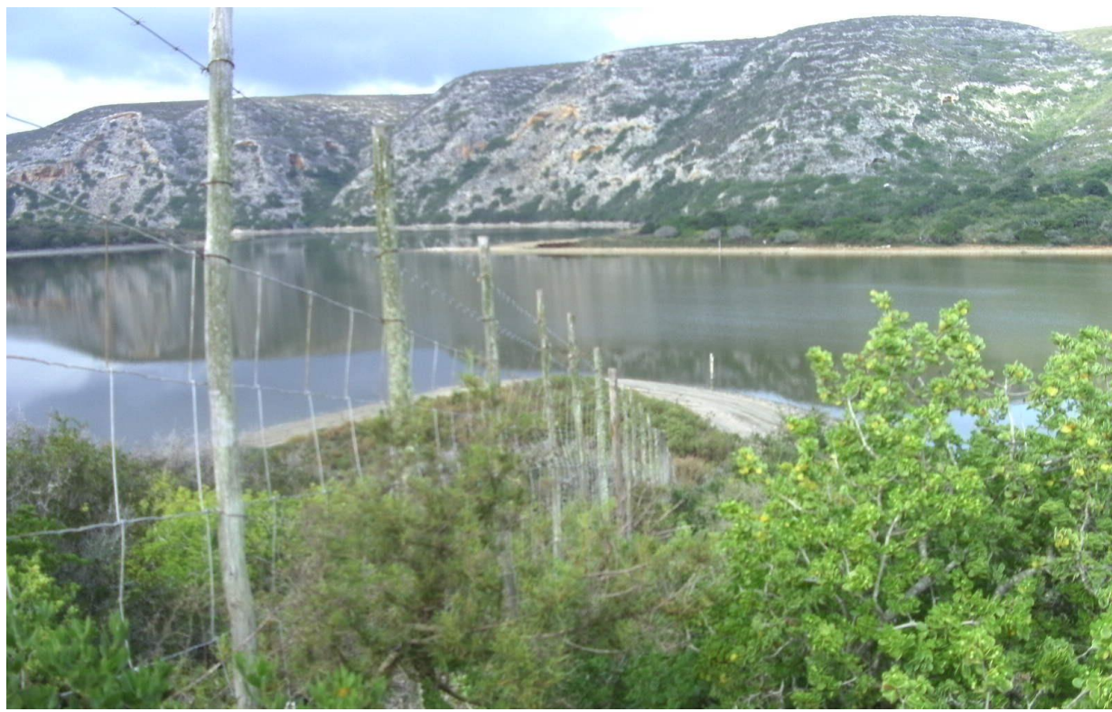
Figure 9. The fence on the south flank of The Island. View to the south.

A fence, erected to prevent animals from moving out of De Hoop Nature Reserve crosses The Island from south to north (Figures 9 and 10). Most of it is in ruin.