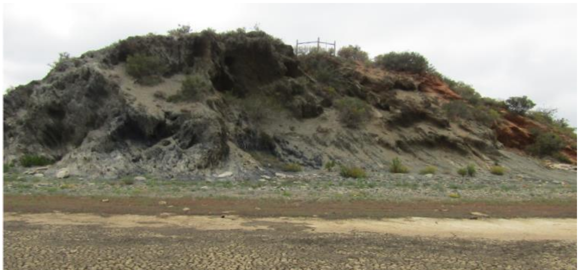
Figure 8. View to the east of the northern tip of The Island. The marsh is dry.