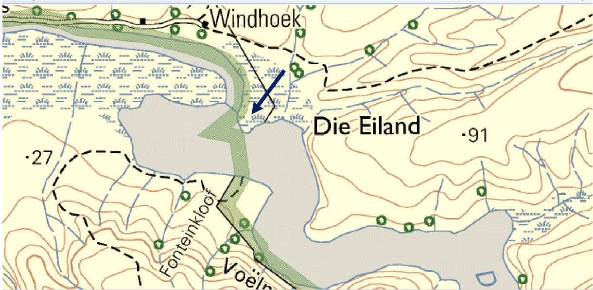
Figure 1. The topography map of the area (3420AD) does not show The Island. The arrow points to the site where The Island should have been marked on the map.

A little island is situated close to the north bank of the gorge (Figures 1 to 7). The Island (called Die Eiland on all the maps) is 180 m long on the E-W direction and 170 m long on the N-S direction. The highest elevation, of 22 m (about 12 m above the marsh level), is at the western point of the island.