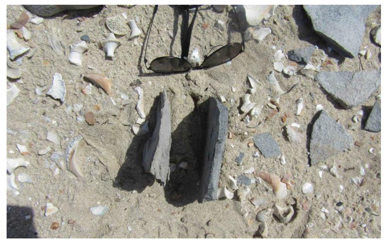
Figure 3. Sandstone slices, some with sharp edges, which may have been used in processing the shells and other catch from the sea. The slices are not natural, as all the stones in the surrounding area are very well-rounded boulders and pebbles.