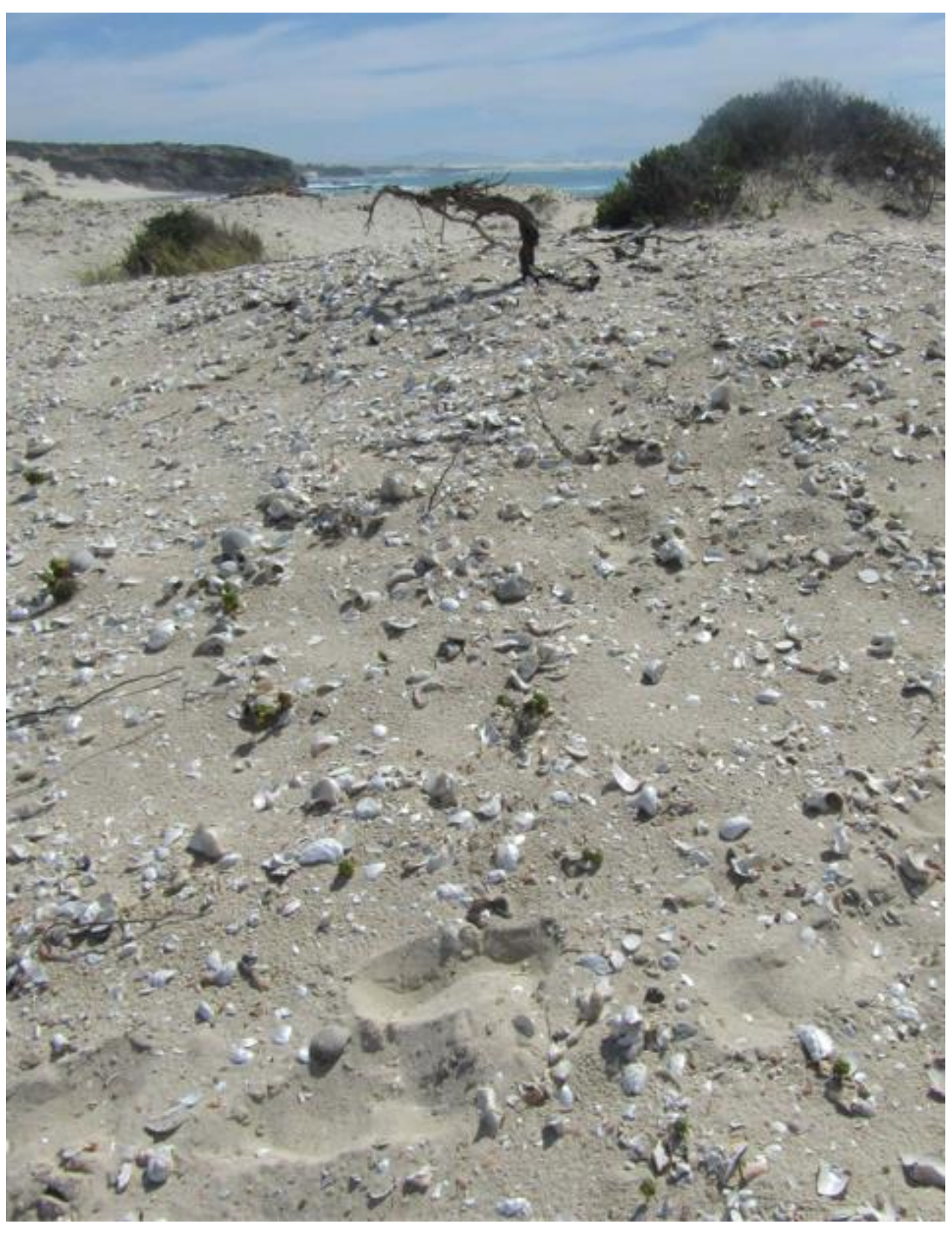
Shell middens in Struis Point.