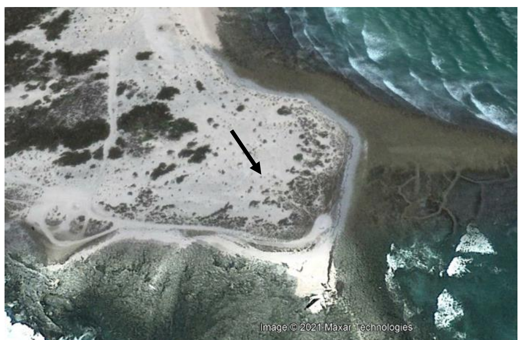
Figure 1. Topography map (top) and satellite image (bottom) of the shell middens site (arrow).