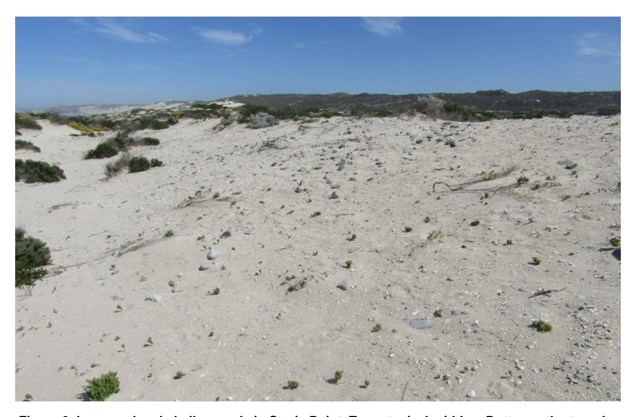
Figure 2. Low sand and shell mounds in Struis Point. Top - typical midden. Bottom - the troughs between the mounds do not contain shells or sliced rocks (below).