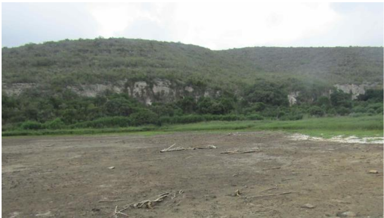
Figure 8. Vertical cliffs along the east bank of the middle part of the De Hoop Vlei Gorge.