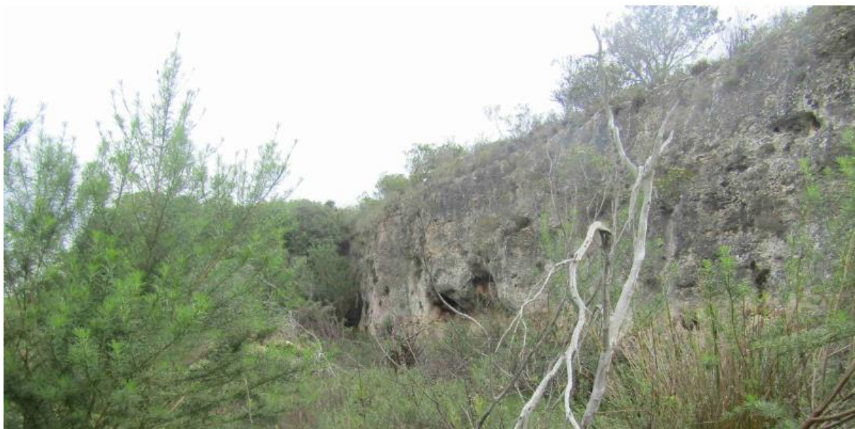
Figure 3. Vertical cliffs along the northern section of the De Hoop Vlei Gorge.