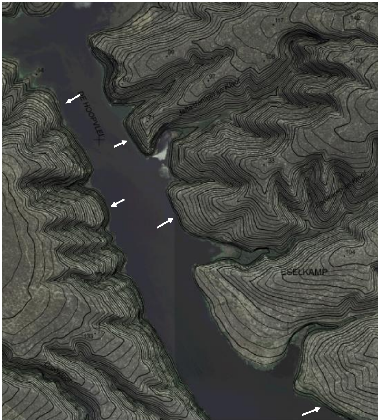
Figure 4. Topography map of a section of the northern part of the De Hoop Vlei Gorge, showing steep cliffs on either side of the gorge, along nearly straight lines.