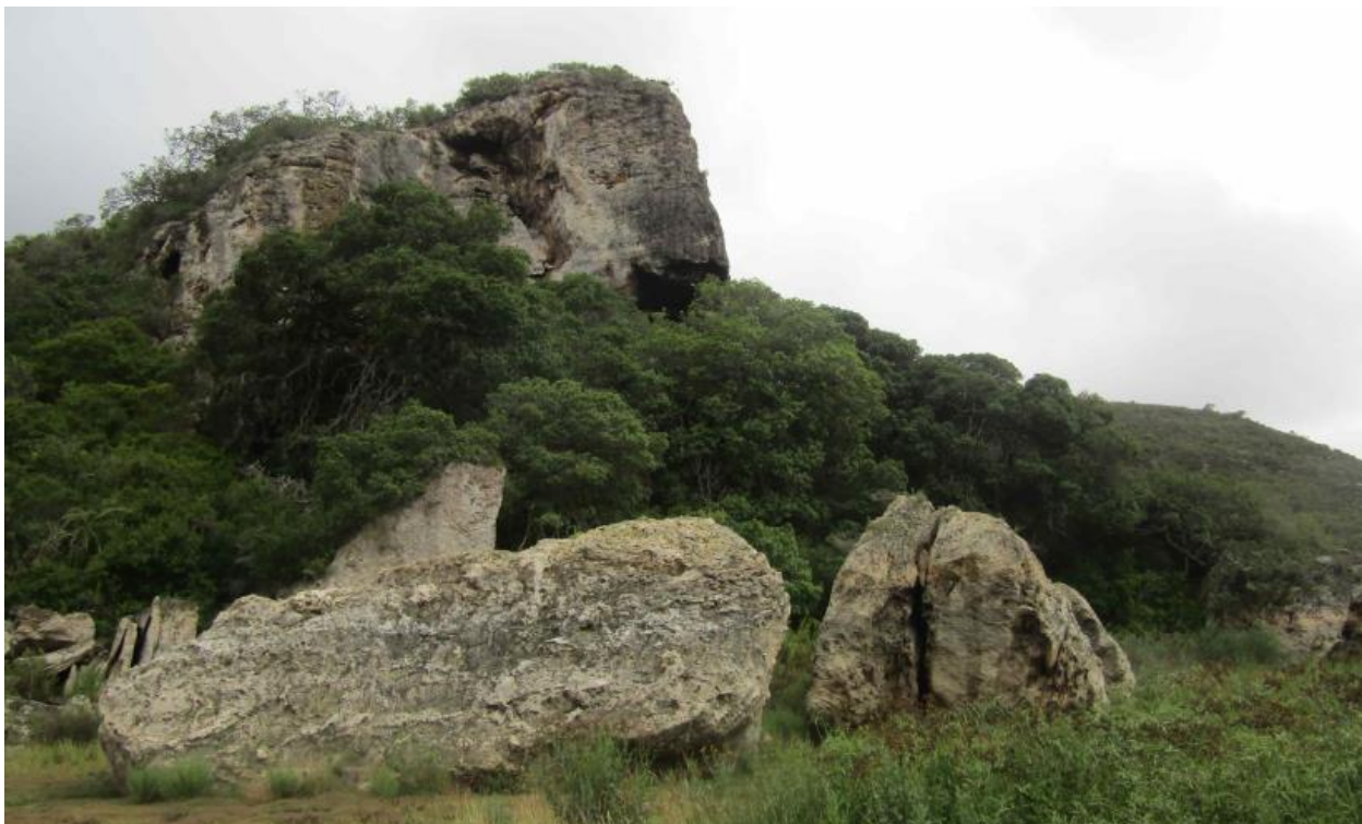
Figure 6. Closer look at the fallen blocks shown in Figure 5.