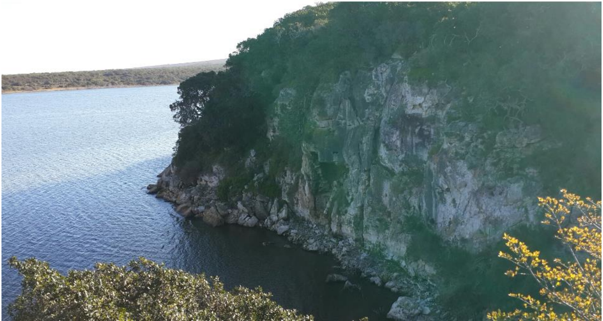
Figure 9. Vertical cliffs at the North Tierhoek Cove, in the middle part of the gorge.