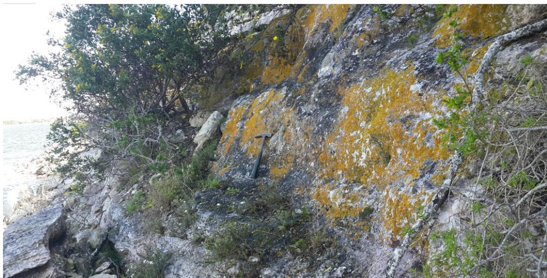
Figure 12. Nearly vertical cliff on the east bank of section of the southern part of the De Hoop Vlei Gorge.