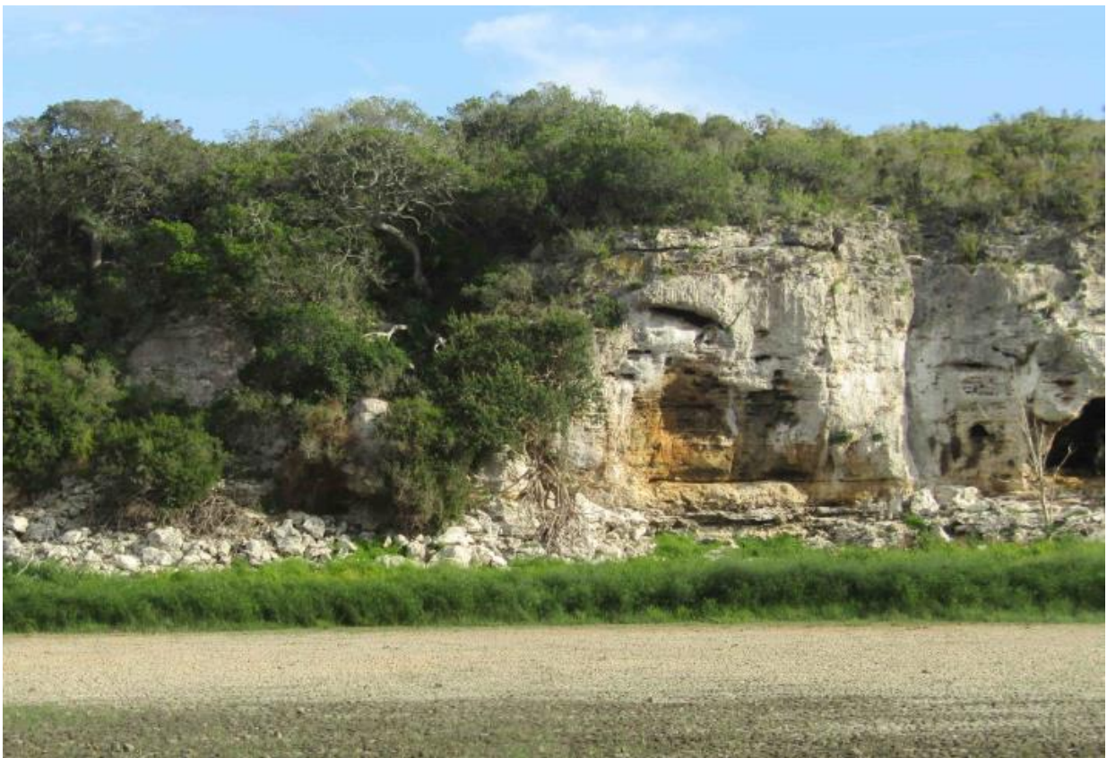
Figure 10. Vertical cliffs north of the North Tierhoek Cove.