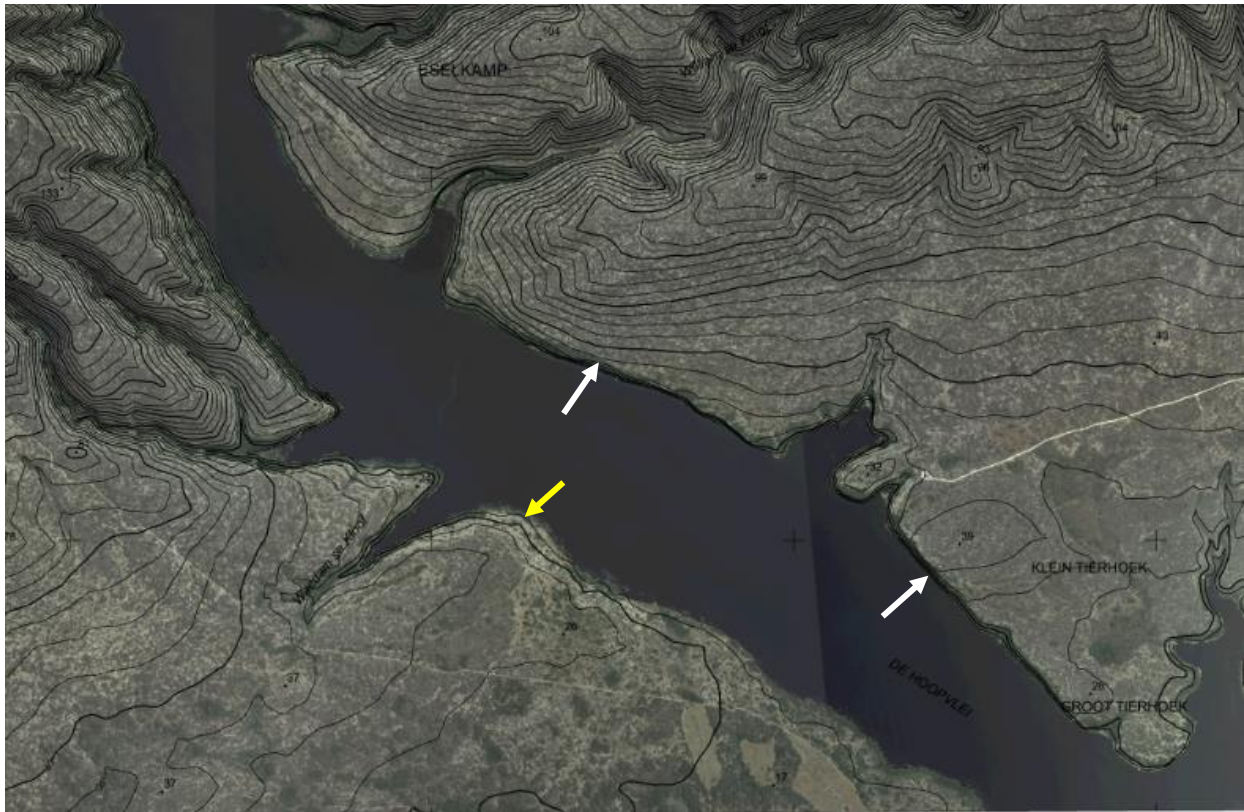
Figure 7. Topography map of a section of the middle part of the De Hoop Vlei Gorge, showing steep cliffs on either side of the gorge, along nearly straight lines (white arrows). From the outlet of the Wasdam se Kloof (yellow arrow) southward the west side of the gorge is of low relief.