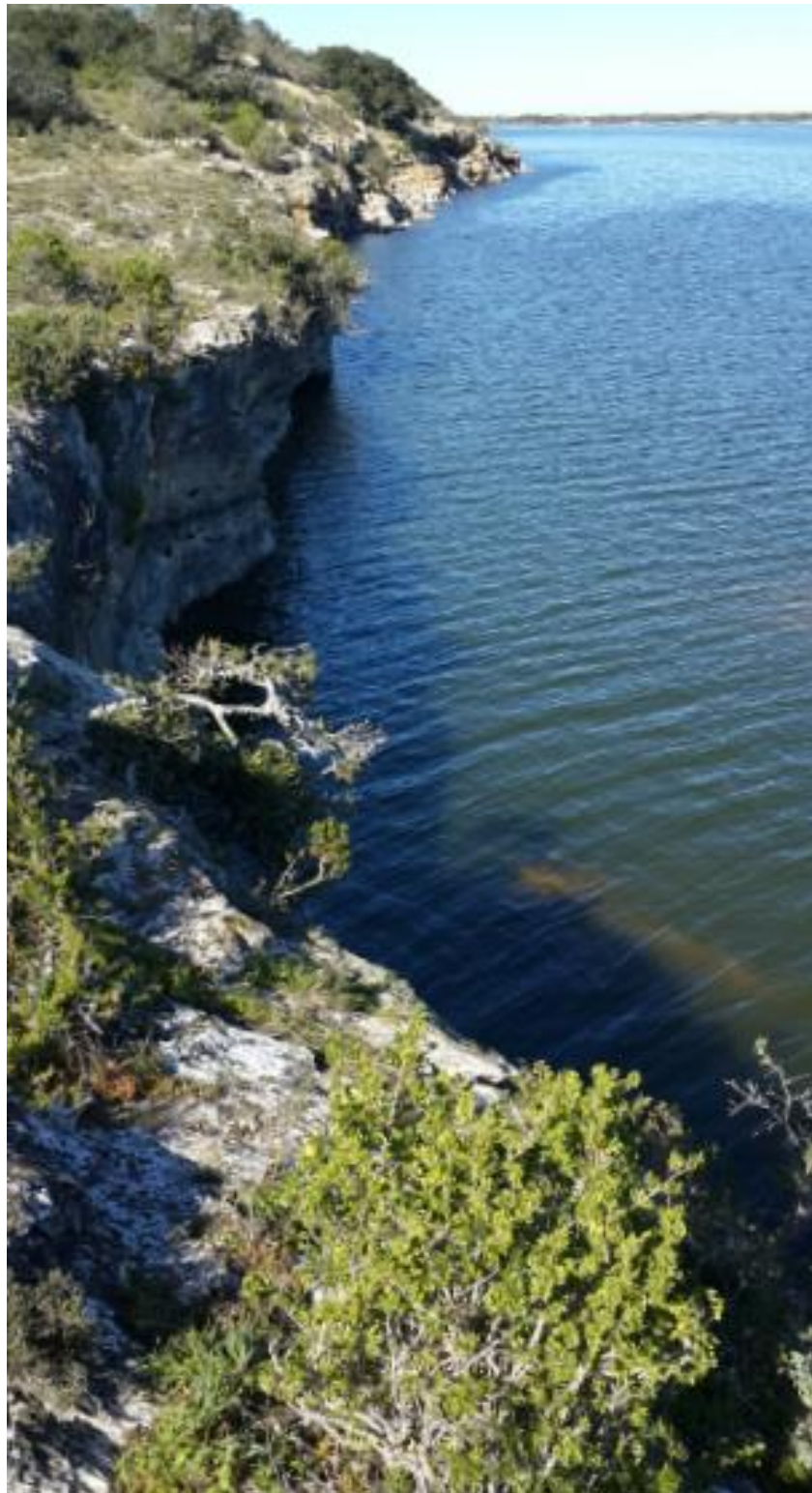
Figure 13. Cliffs on the east bank of the southern part of the De Hoop Vlei Gorge.

The above evidence of tectonic activity, together with evidence of tectonics from other parts of the Study Area, are discussed in Chapter W, as the forces which formed the De Hoop Vlei Gorge and other features in the Study Area.