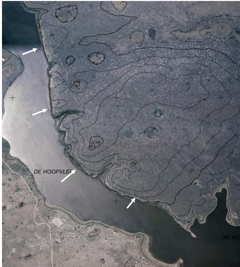
Figure 11. Topography map of a section of the southern part of the De Hoop Vlei Gorge, showing steep cliffs on the east side of the gorge, along nearly straight lines (arrows).