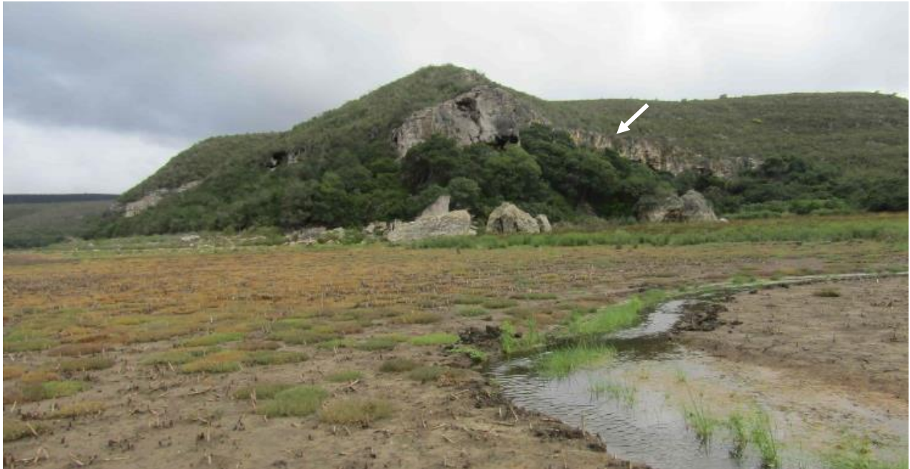
Figure 5. View onto a vertical cliff (arrow) at the outlet of the Jaftasfontein se Kloof, and huge blocks which rolled into the vlei.