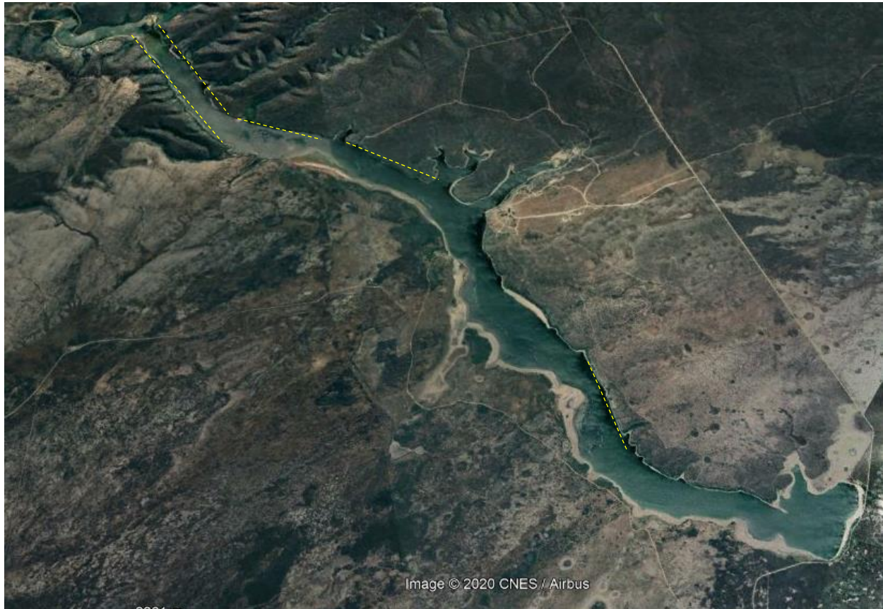
Figure 2. Satellite image of the De Hoop Vlei Gorge. The dashed lines indicate vertical or nearly vertical cliffs along nearly straight lines.

Vertical and nearly vertical cliffs are situated on either side of the gorge and inside the ravines, which 'flow' into the gorge (see Chapter E, dry valleys). Blocks of rocks, cut along straight lines, are also indicators of tectonic activity. Examples are presented in Figures 2 to 13.