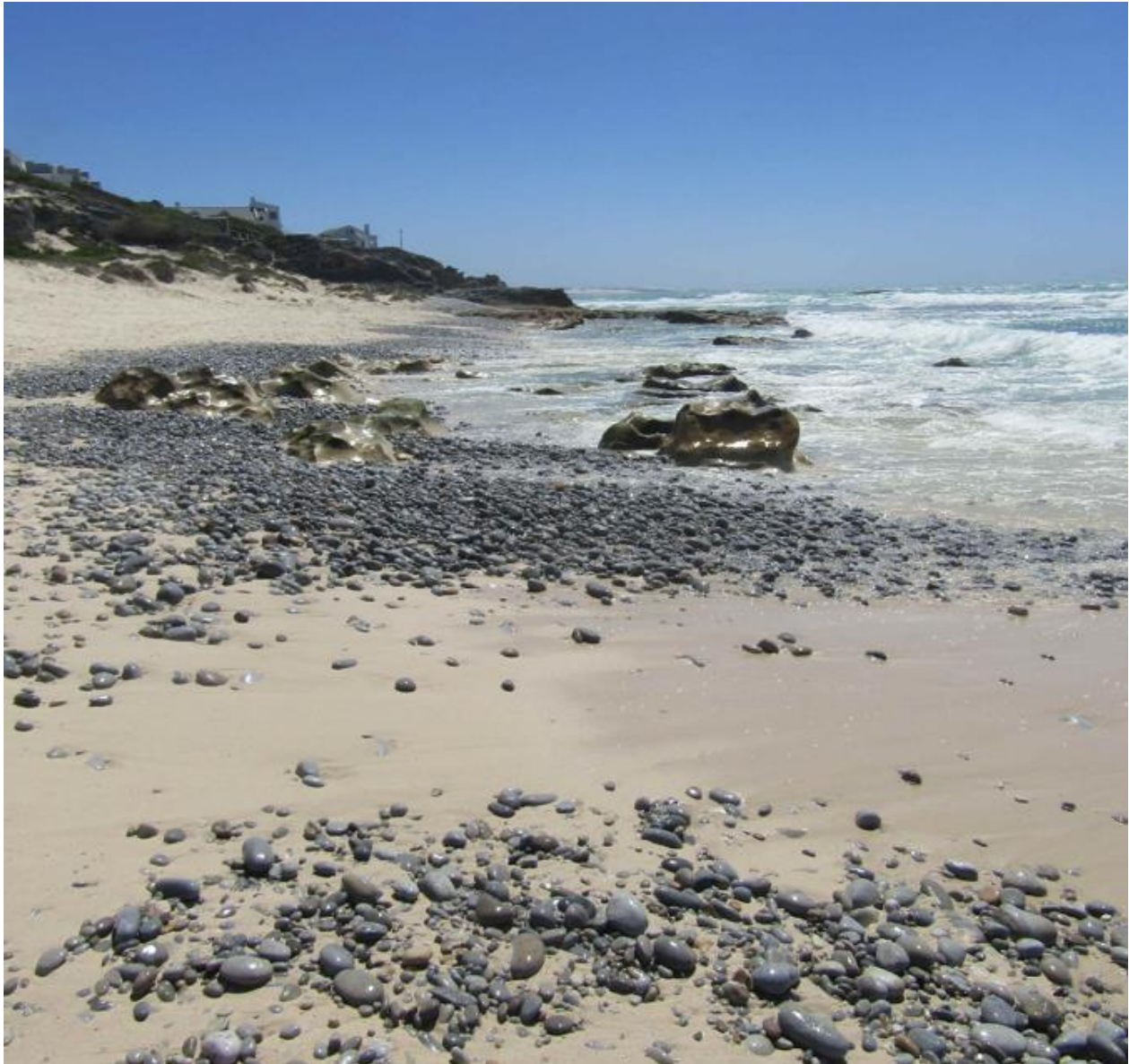
Figure 4. Top and bottom – beach cusps along the Arniston East Shore. Varying pebble sizes, and rocks along the beach interfere with the formation of geometrically perfect cusps.

The cusps along the Arniston shore do not exhibit perfect shape. The reasons are that the pebbles are of various sizes (tiny and large) and that the current regime and the wave pattern are disrupted by the nearby headlands abrasion tables as well as rocks, which protrude the beach face (Figure 4).