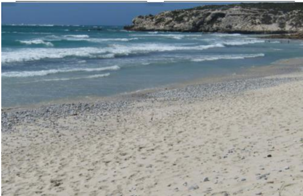
Figure 3. Top and bottom – pebble beach cusps along the Arniston East Shore.