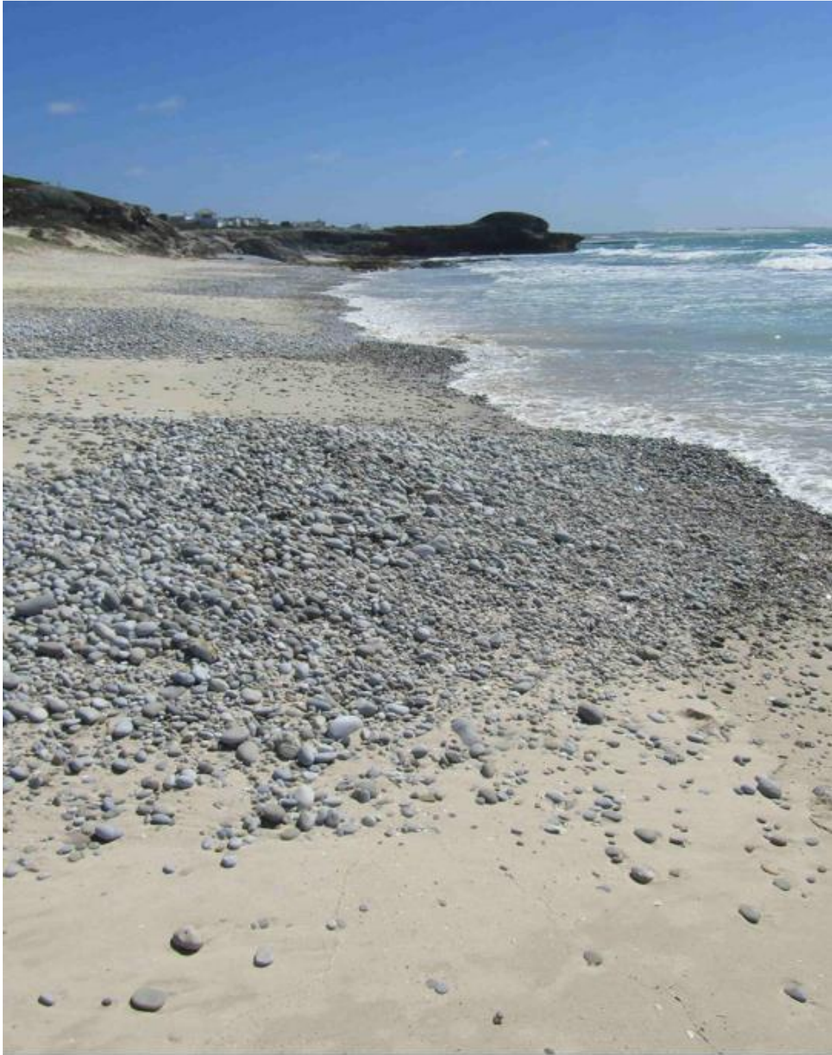
Beach cusps at Arniston.