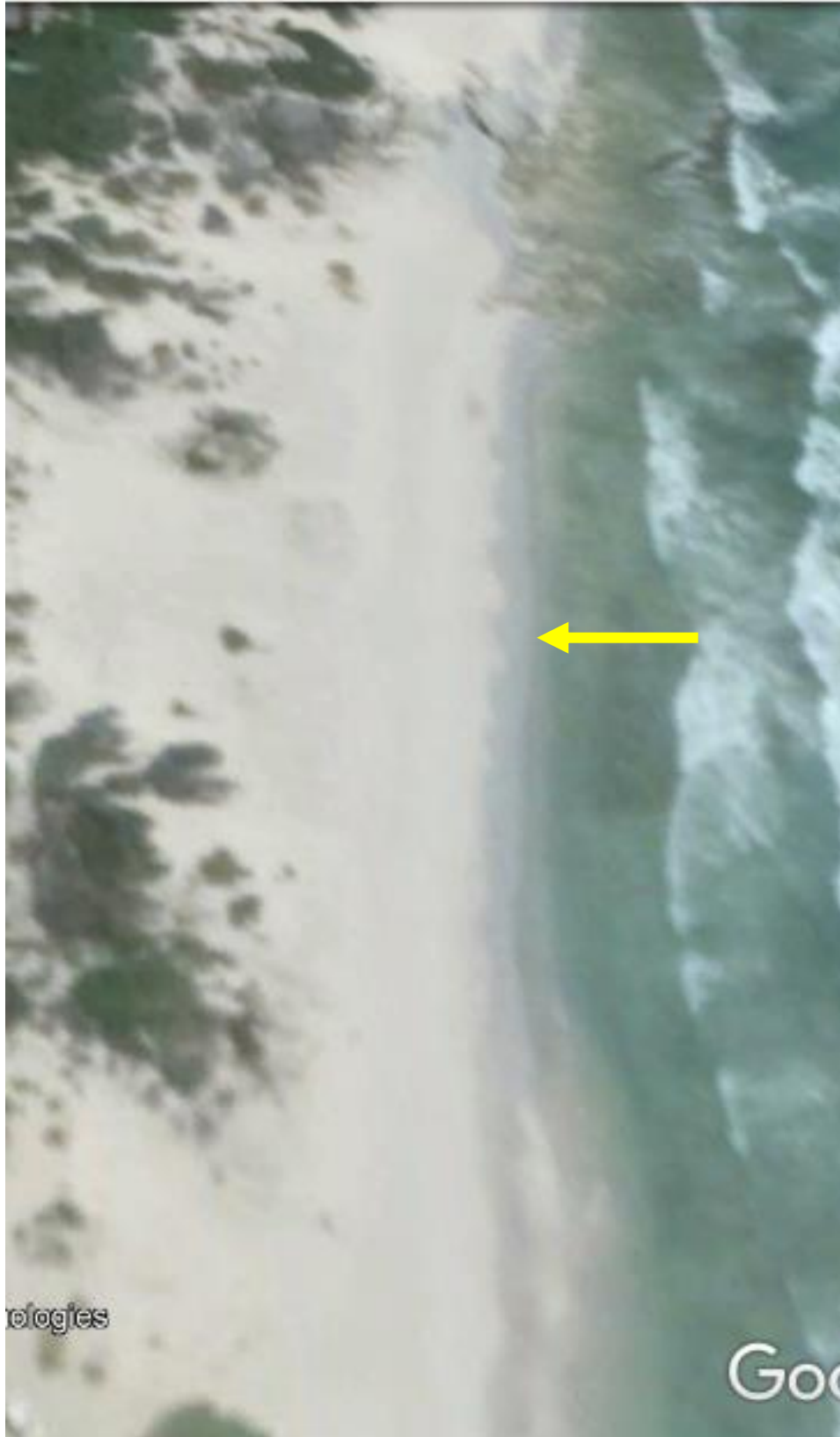
Figure 2. Beach cusps (arrow) can be discerned from the satellite image.

Cusps are formed along Aniston East Shore (Figure 2).