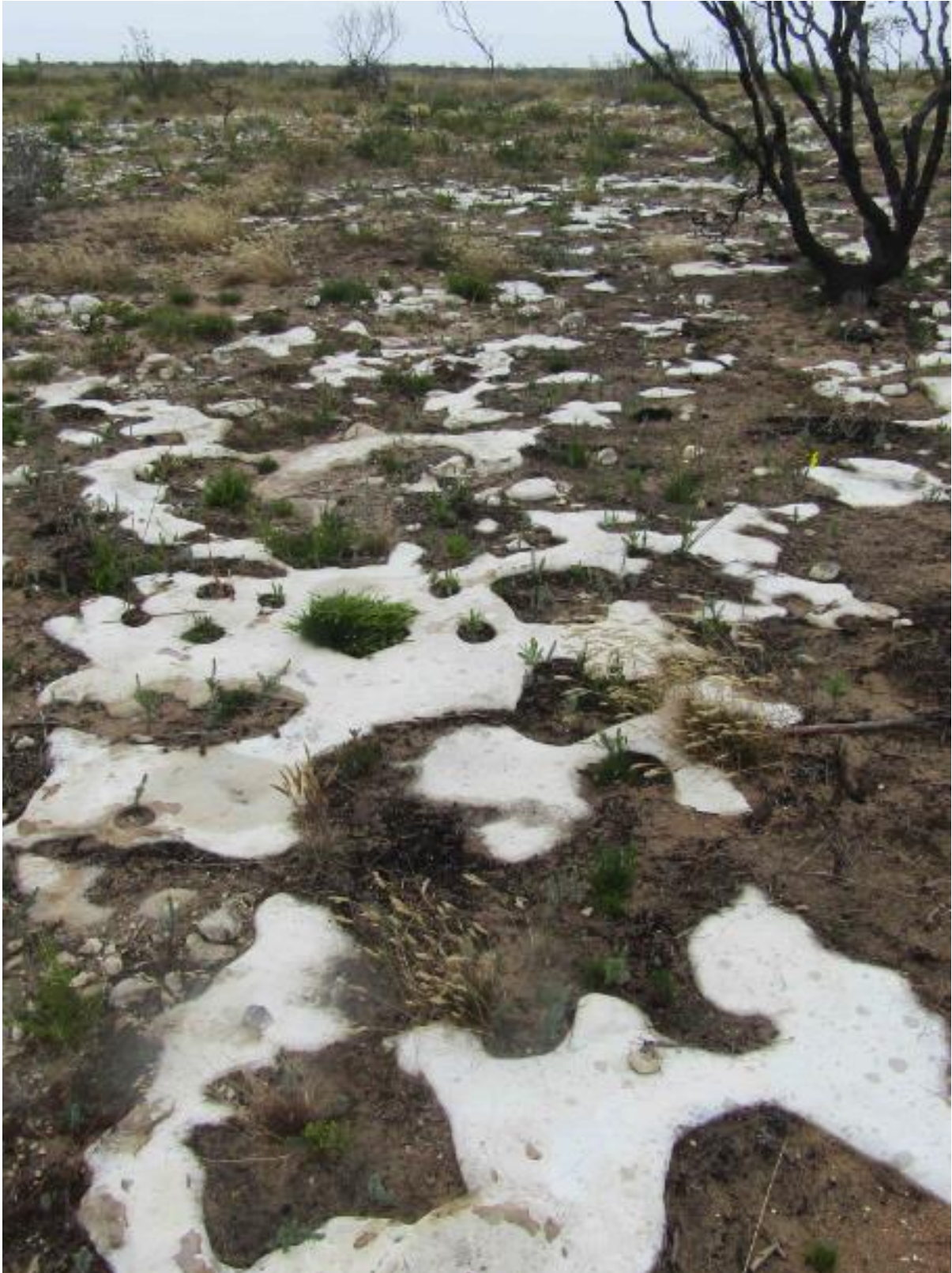
Calcrete on sand.