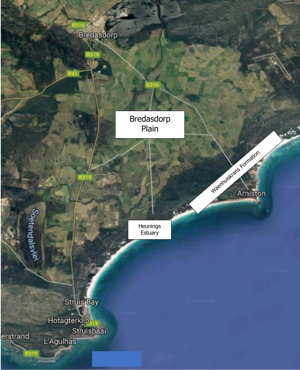
Figure 1. Satellite image of the western part of the Study Area, showing the areas mentioned in the Field Notes about calcretes in this chapter,

Satellite images of the Study Area, showing the geographical areas mentioned above, are given in Figures 1 and 2.