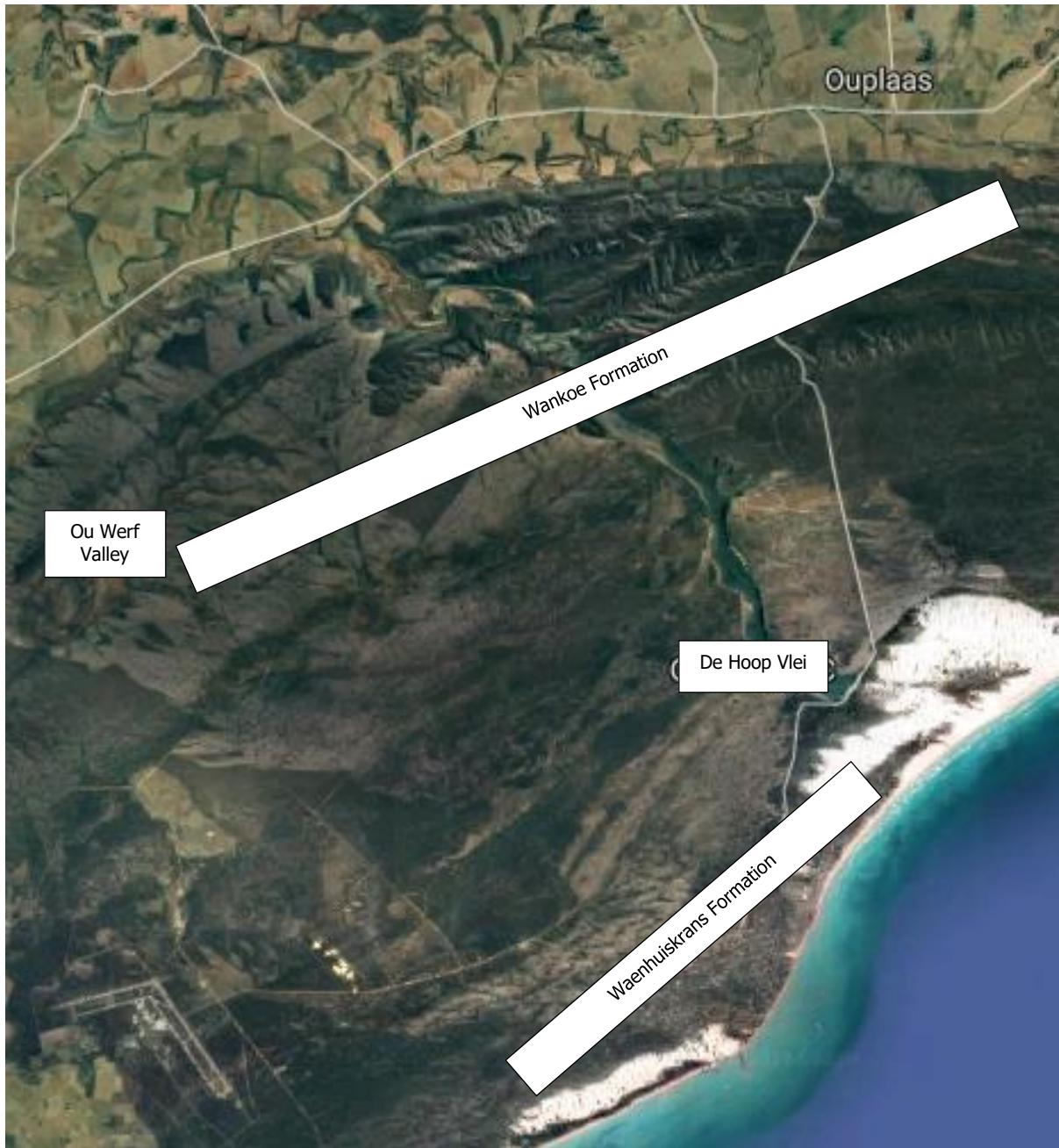
Figure 2. Satellite image of the middle part of the Study Area, showing the areas mentioned in the Field Notes about calcretes in this chapter,