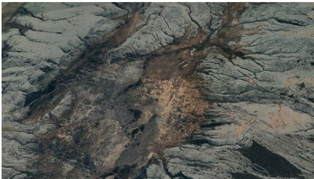
Figure 2. Satellite image of the Ou Werf Valley.