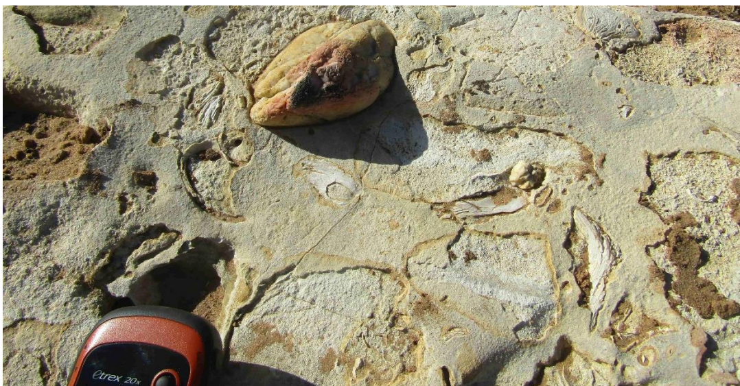
Figure 10. Top, middle and bottom: 'mushroomy' calcrete on the red sand floor on the east side of the Ou Werf Valley. Note the fossils and the pebbles at the bottom photo.