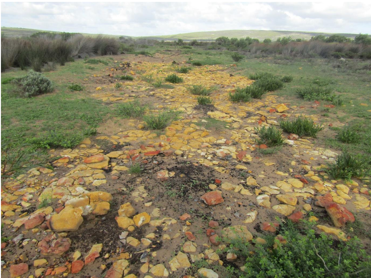
Figure 6. Top and bottom: reddish calcrete-silcrete intergrade mosaics on the flat floor of the Ou Werf Valley.