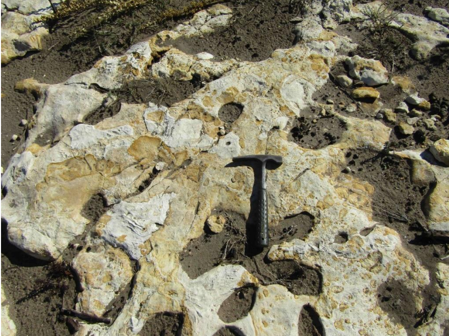
Figure 7. Patchy, mottled calcrete-silcrete intergrade sheets on the floor of the Ou Werf Valley.

Sheets of calcrete on the valley floor appear in three different textures / colours - white, mottled and reddish. They are unique to this valley.