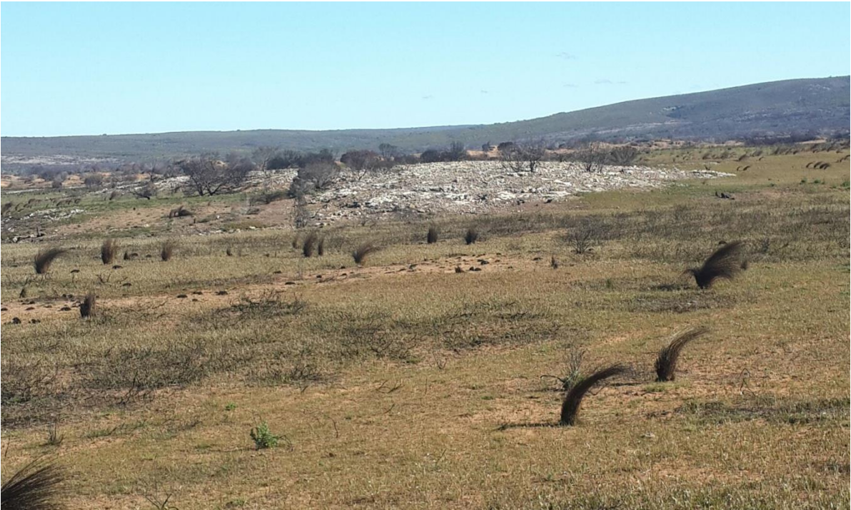
Figure 4. Calcrete-capped low hill in the northern part of the Ou Werf Valley.