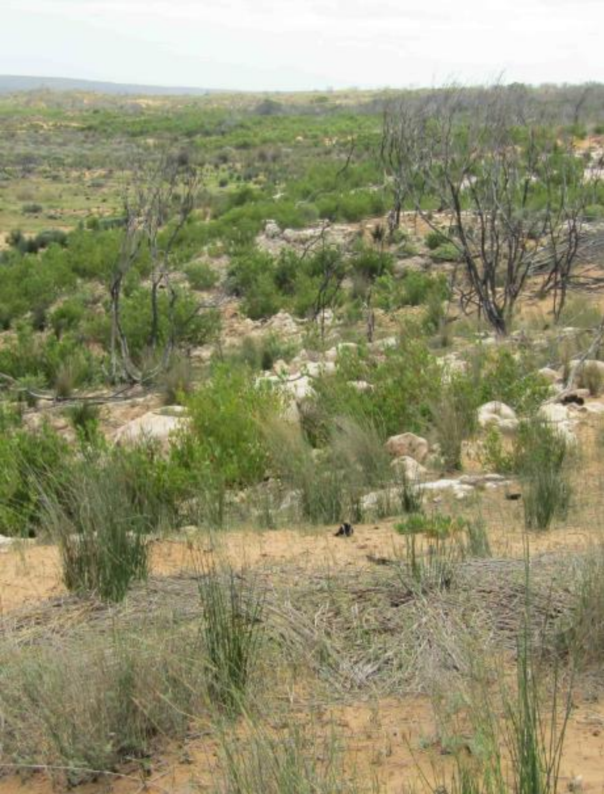
Calcrete on the east side of the Ou Werf Valley.