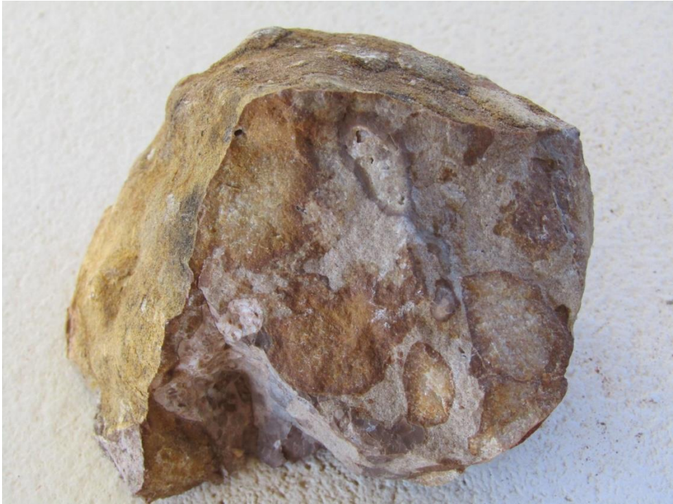
Figure 8. Chunk of disintegrated tabular reddish calcrete-silcrete intergrade on the floor of the Ou Werf Valley.