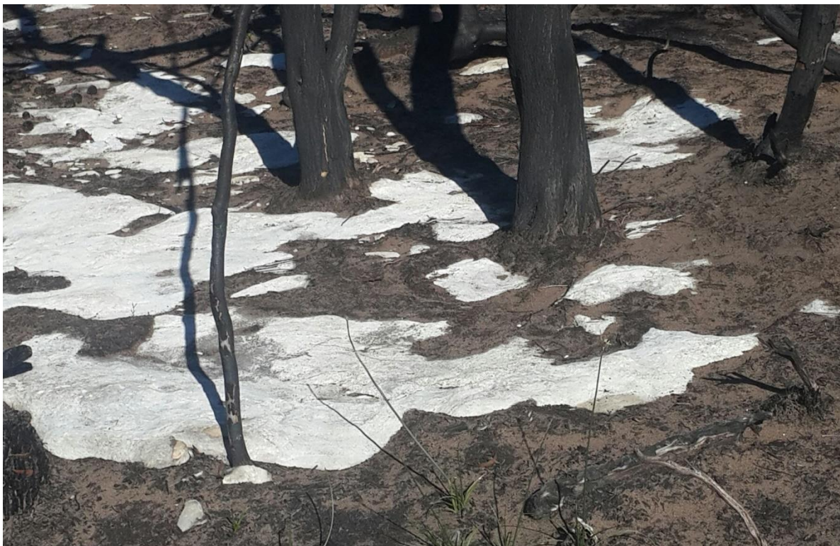
Figure 5. Top and bottom: white calcrete sheets on the flat floor of the Ou Werf Valley.