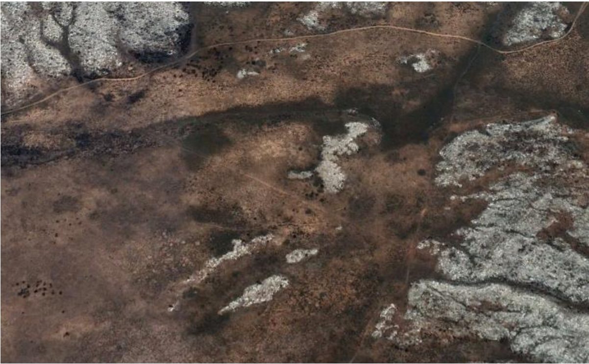
Figure 3. Satellite image of calcrete-capped low hills in the northern part of the Ou Werf Valley.

The floor of the valley consists of red sand, over which a few types of calcrete and calcrete-silcrete intergrades were formed, some of them are unique to this valley (Figures 3 to 10).