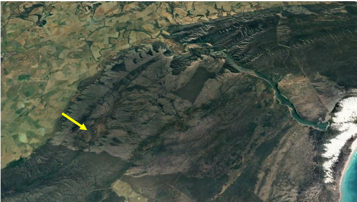
Figure 1. Satellite image of the area west of De Hoop Vlei. Arrow points to the Ou Werf Valley.

The Ou Werf Valley (name given by the author after a farm - now abandoned in the south of the valley) is located between the Kars River in the west and the De Hoop Vlei in the east (Figures 1 and 2).