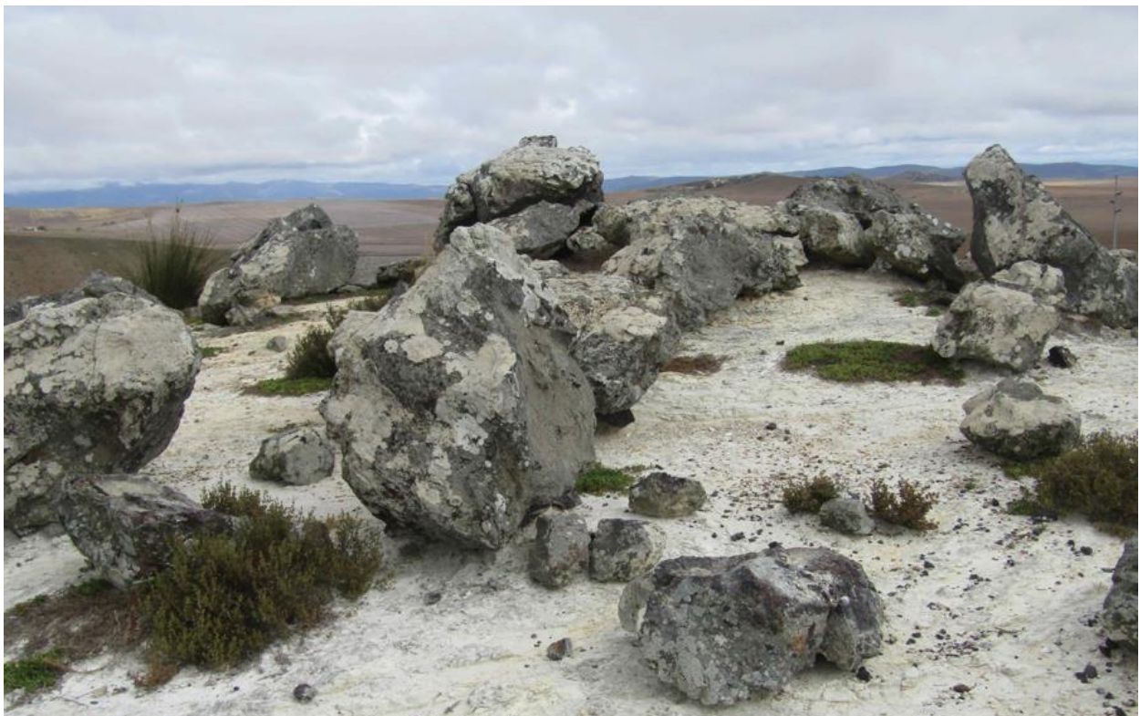
Figure 10. Top and bottom: shapeless and pillowy boulders on the western rise on Uitvlug Farm.