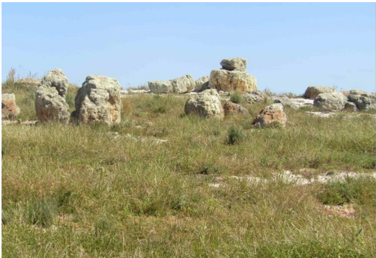
Figure 6. Top and bottom – spaced cubical boulders on a rise on Weltevrede Farm. Some stacks are present.