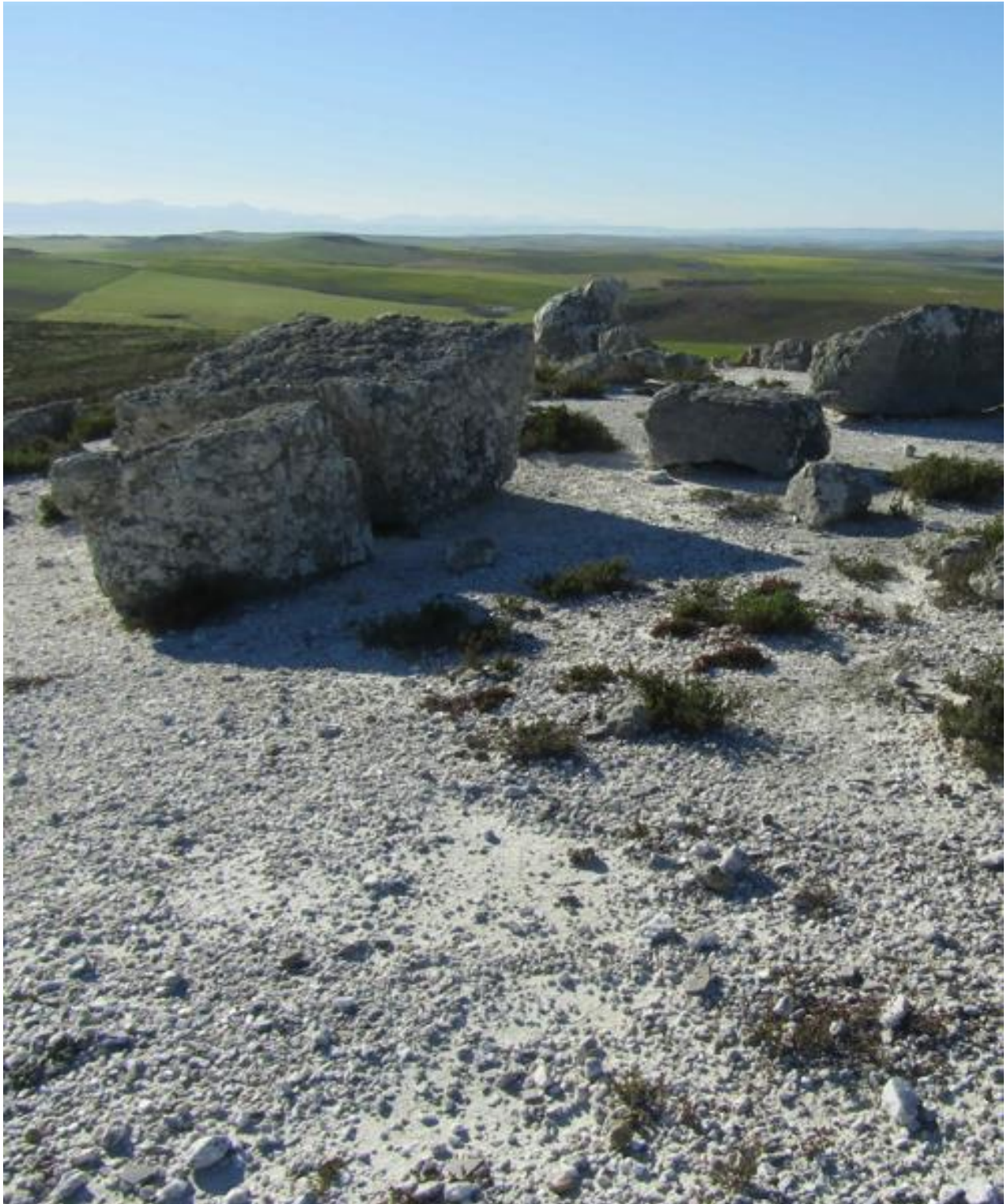
Hilltop silcrete boulders.