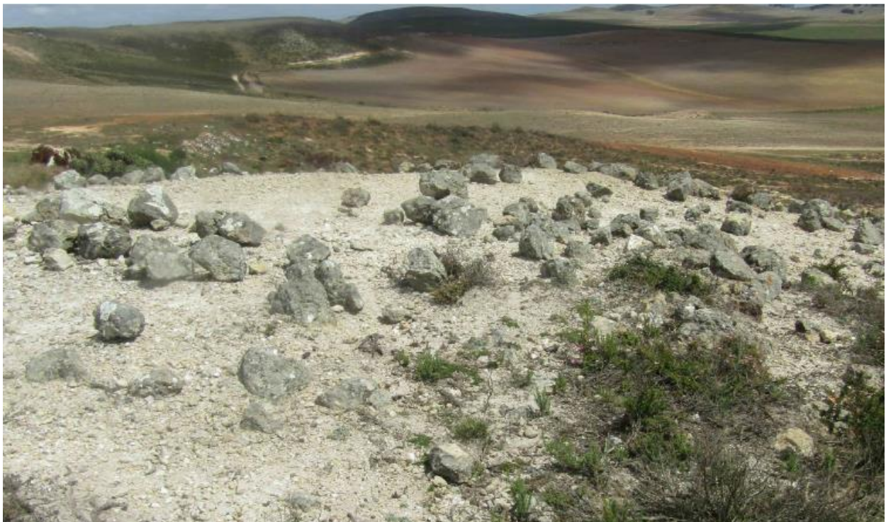
Figure 8. Top and bottom: small, shapeless boulders on a hill on Die Kop Farm.