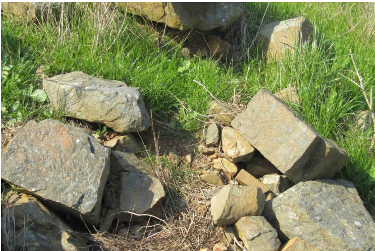
Figure 12. Top and bottom: polyhedral boulders on a hilltop north of Bredasdorp.