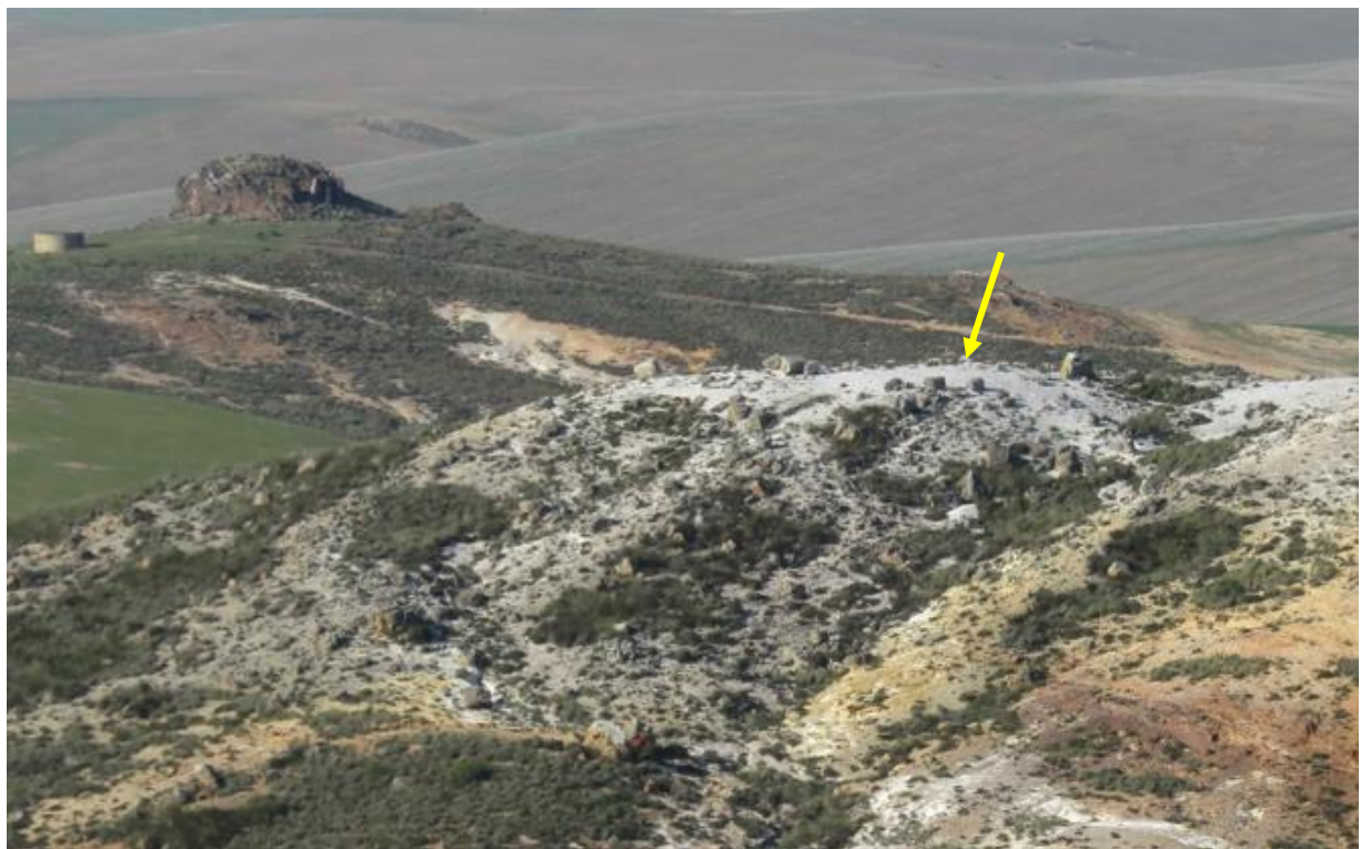
Figure 2. Hilltop spaced boulders (arrow) (on Muurkraal Farm). Top – satellite image. Bottom – view from a hill ton the north-west (Slaapkop).