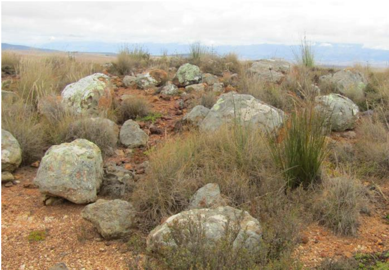
Figure 11. Top and bottom: spherical boulders on the eastern rise on Uitvlug Farm.