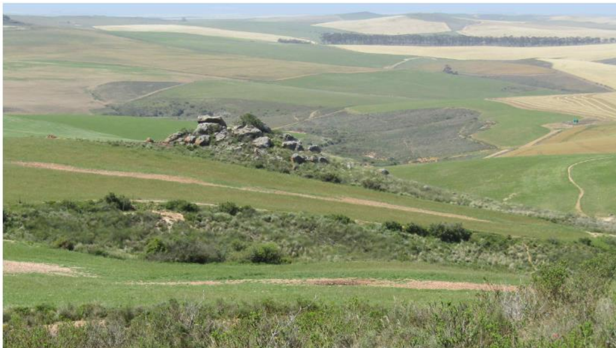
Figure 13. Hilltop heaped boulders. Top - satellite image (arrow). Bottom – ground view from the south. On Goereesoe farm.