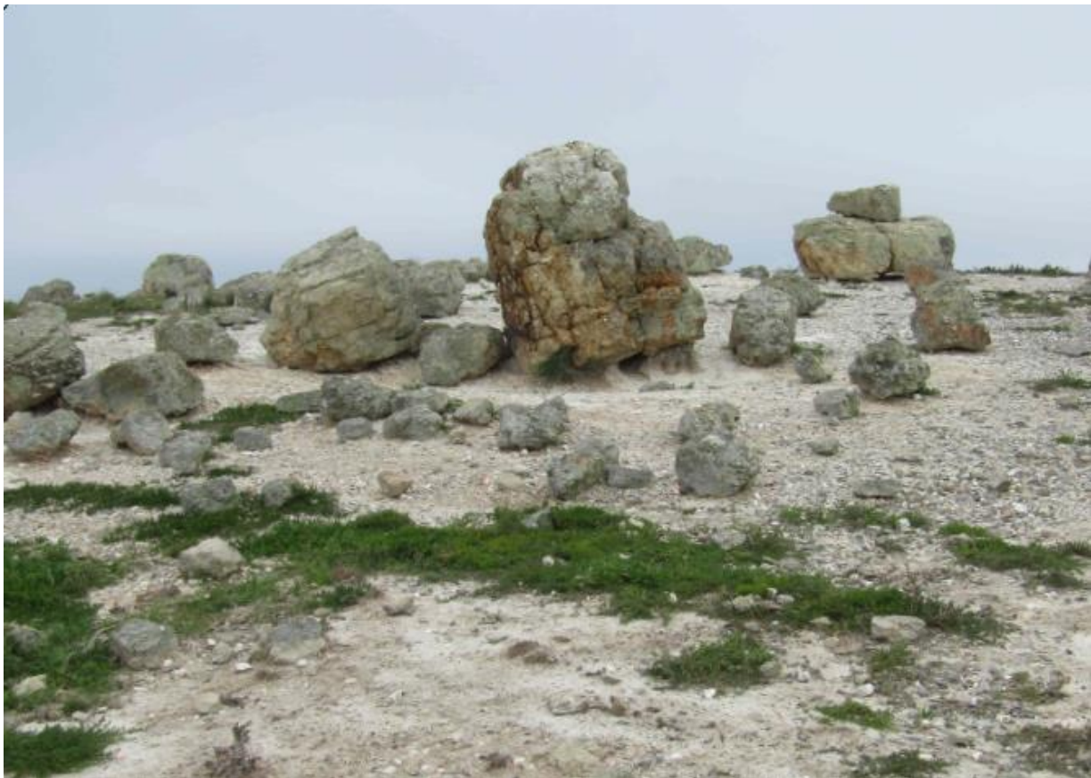
Figure 5. Top and bottom - spaced boulders on a rise on Weltevrede Farm. Some stacks are present.