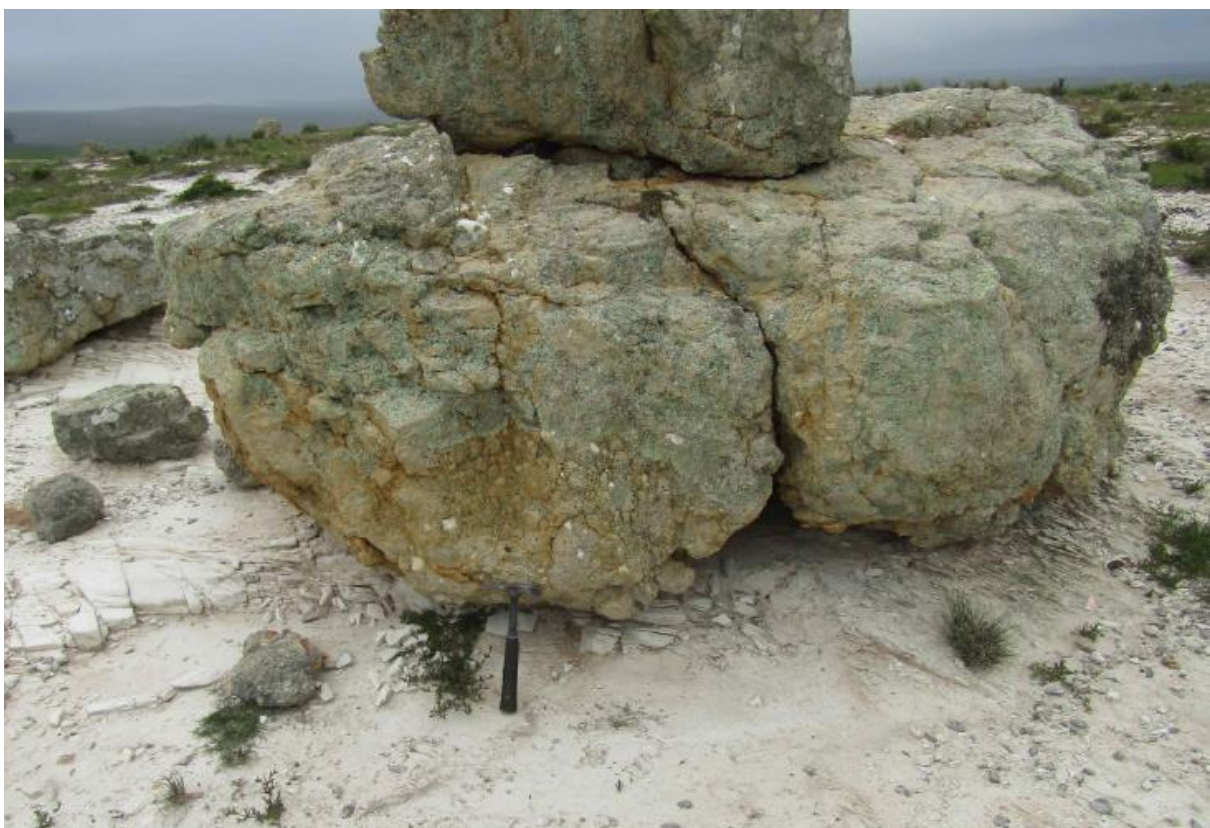
Figure 7. Top and bottom - spaced cubical boulders on a hilltop on Weltevrede Farm. Some stacks are present.