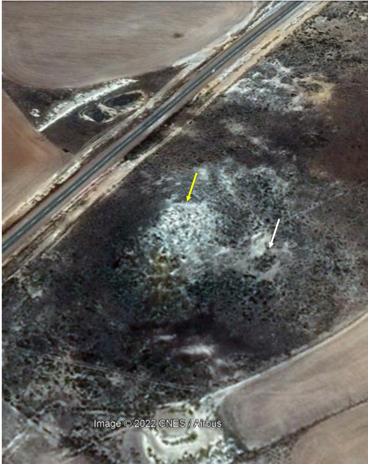
Figure 9. Satellite image of clustered boulders on two rises (arrows) (on the farm Uitvlug).

Hilltop clustered boulders are of various habits and in some cases can be discerned from satellite images (Figure 9).