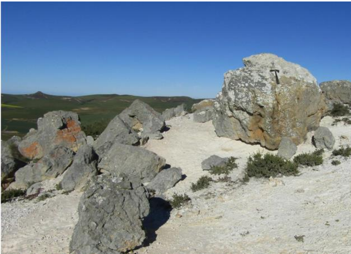
Figure 4. Top and bottom – spaced cubical boulders on a hilltop on Muurkraal Farm.