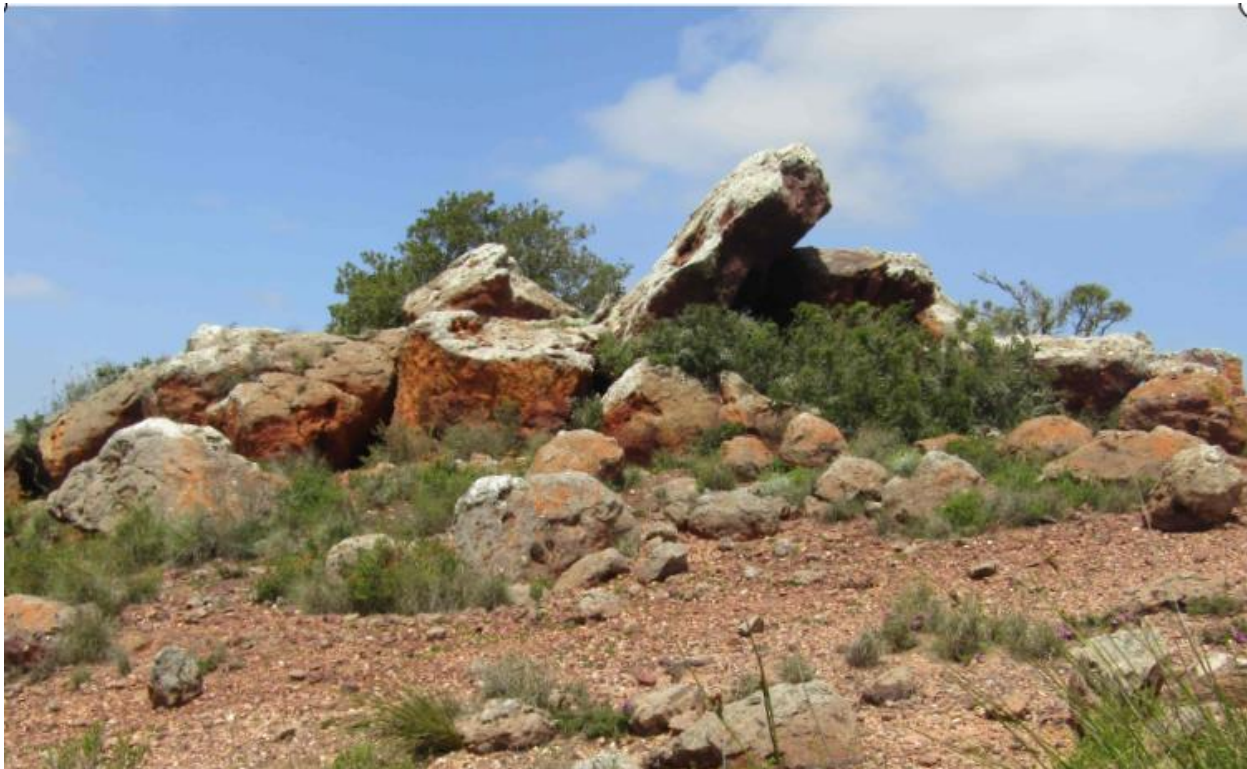
Figure 14. Top and bottom: large boulders (slabs, cubes, spheres and shapeless) on Goereesoe Farm.