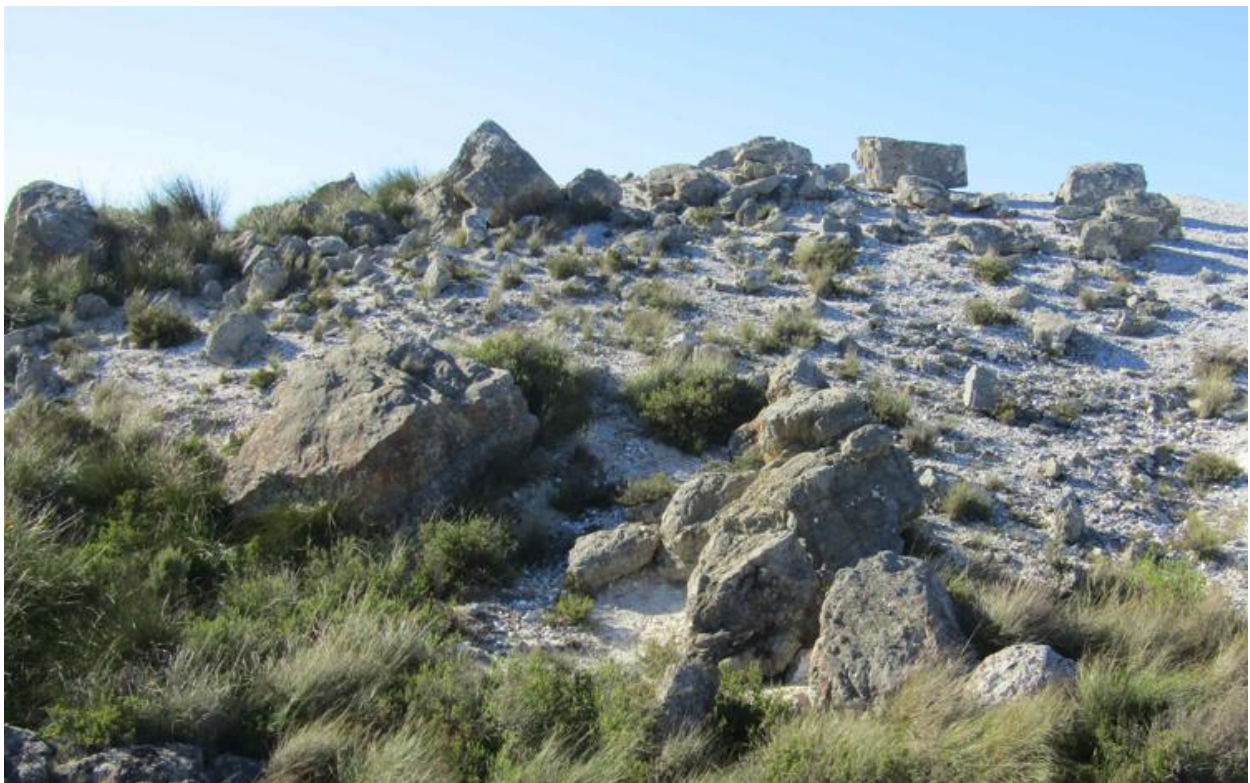
Figure 3. Top and bottom - spaced boulders on a hilltop on Muurkraal Farm. Note the cubical boulders at the very top (black arrow) and the rounded boulders on the slope.