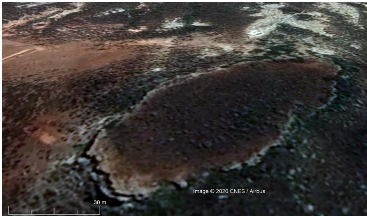
Figure 1. Satellite image: top of a mesa. The red colour is due to the ferrugination of the silcretes.

With a few exceptions, all the silcrete outcrops in the Study Area, both on hilltops and on hillslopes, are ferruginised to a certain extent, with the ferrugination decreasing upwards; in many cases, the silcretes transformed into ferricretes (Figures 1 to 8).