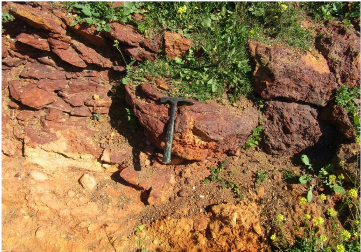
Figure 6. Top and bottom - Ferruginised hilltop silcrete.