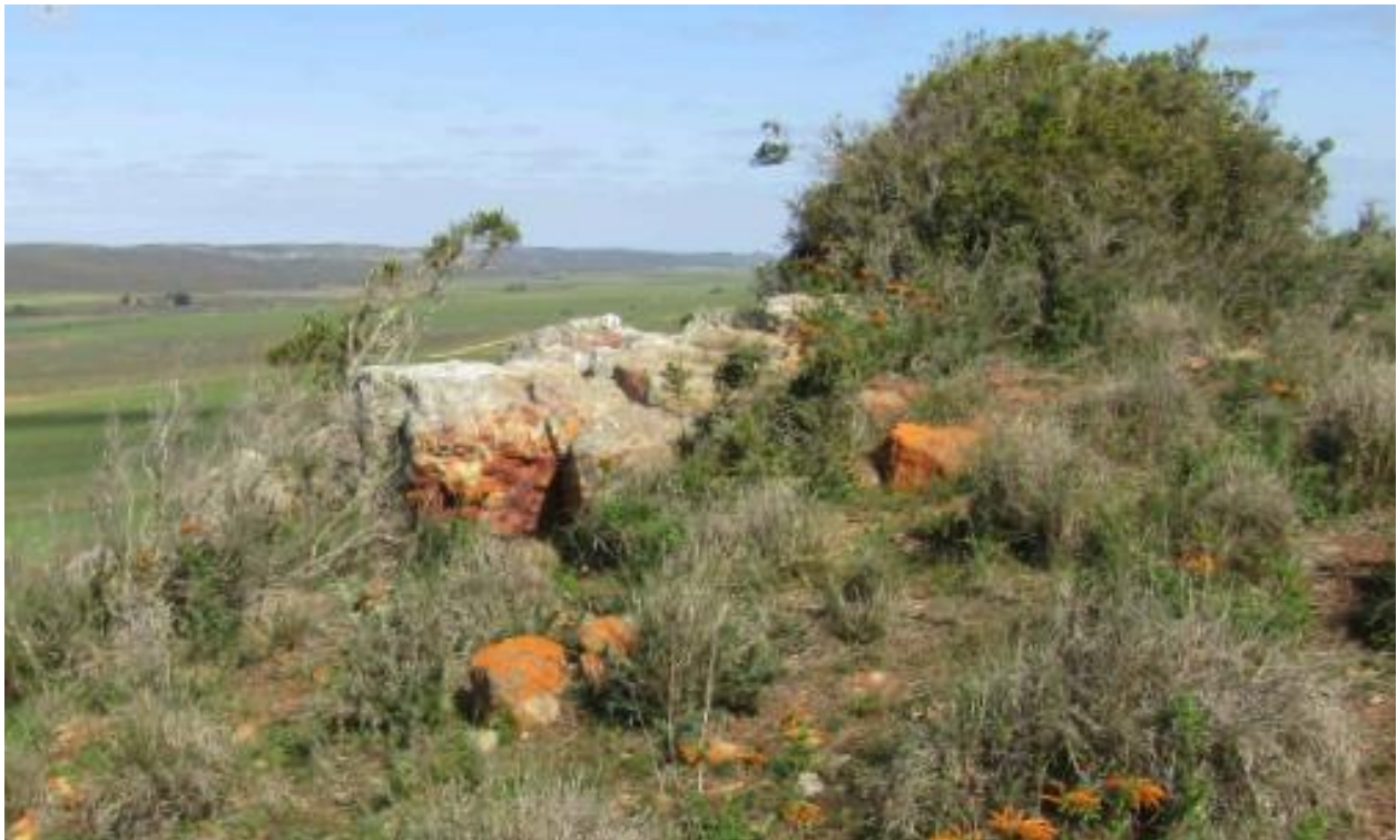
Figure 3. Top and bottom: ferruginised hilltop silcrete.