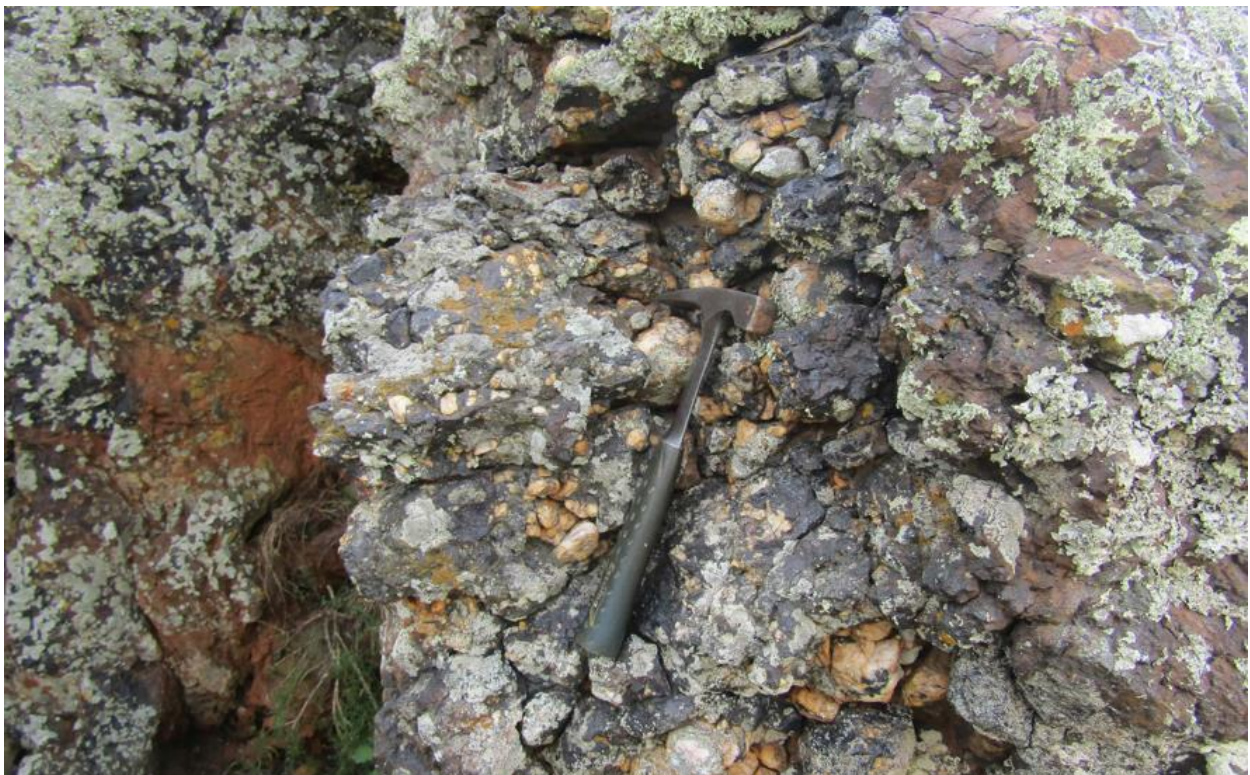
Figure 8. Heavily ferruginised silcretised gravel.