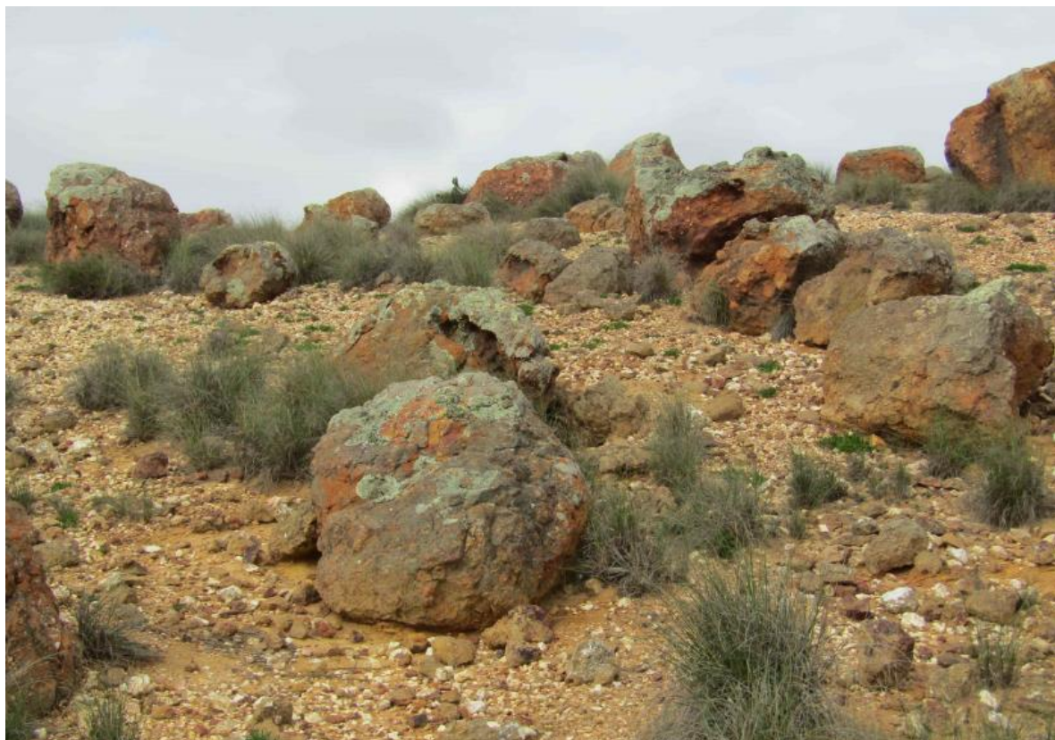
Figure 7. Ferruginised silcrete boulders.