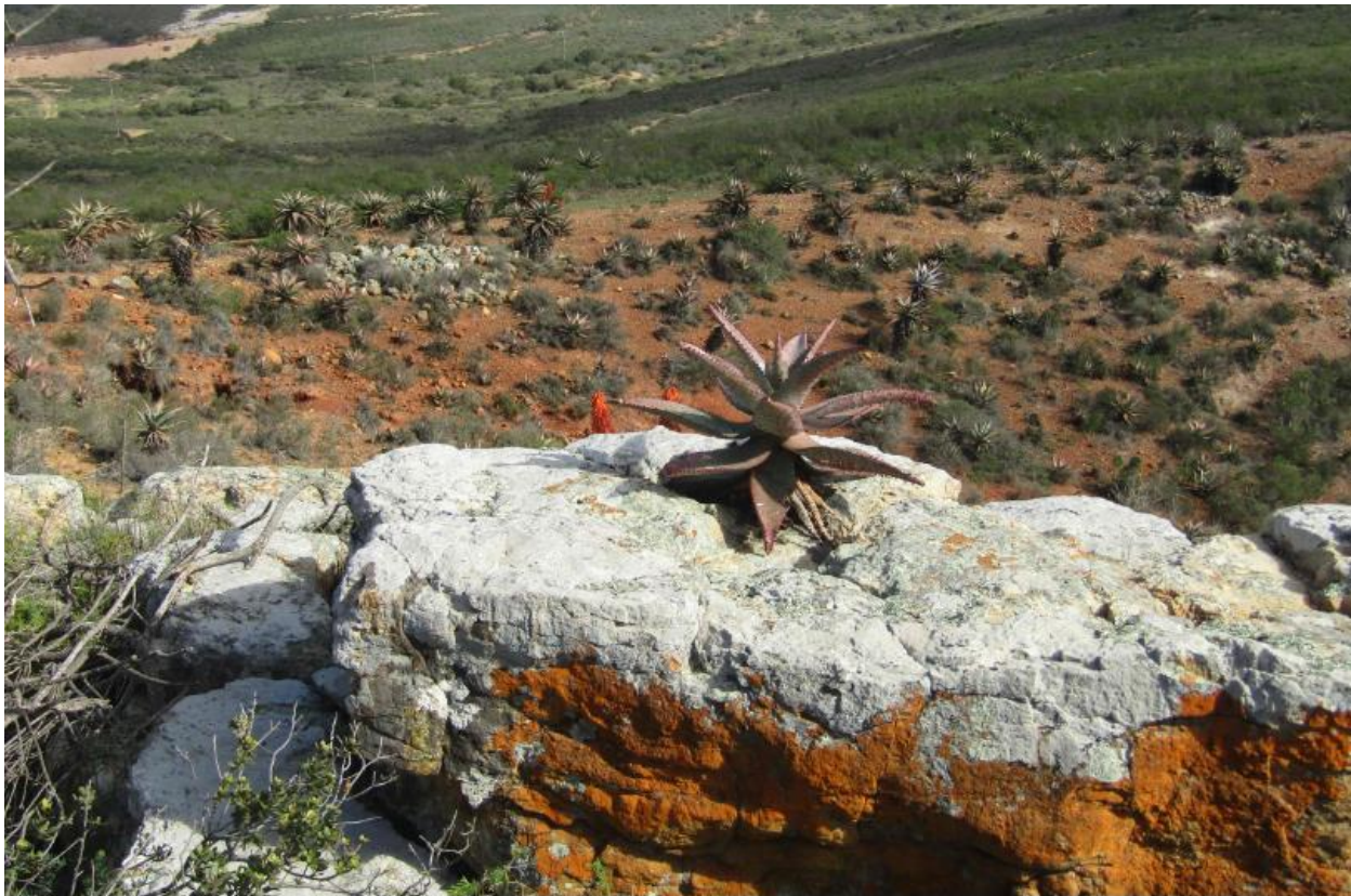
Figure 4. Top and bottom: ferruginised hillslope silcrete.