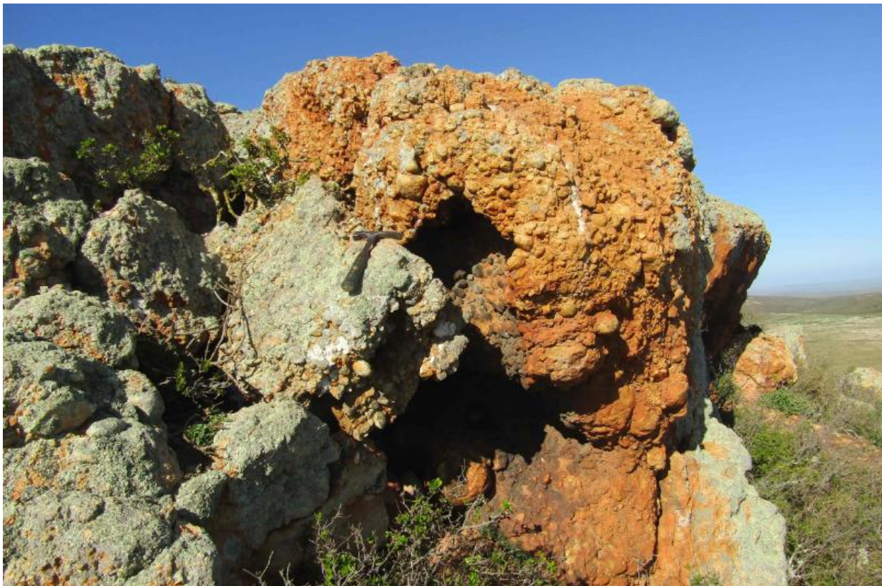
Figure 5. Top and bottom: ferruginised hilltop silcrete.