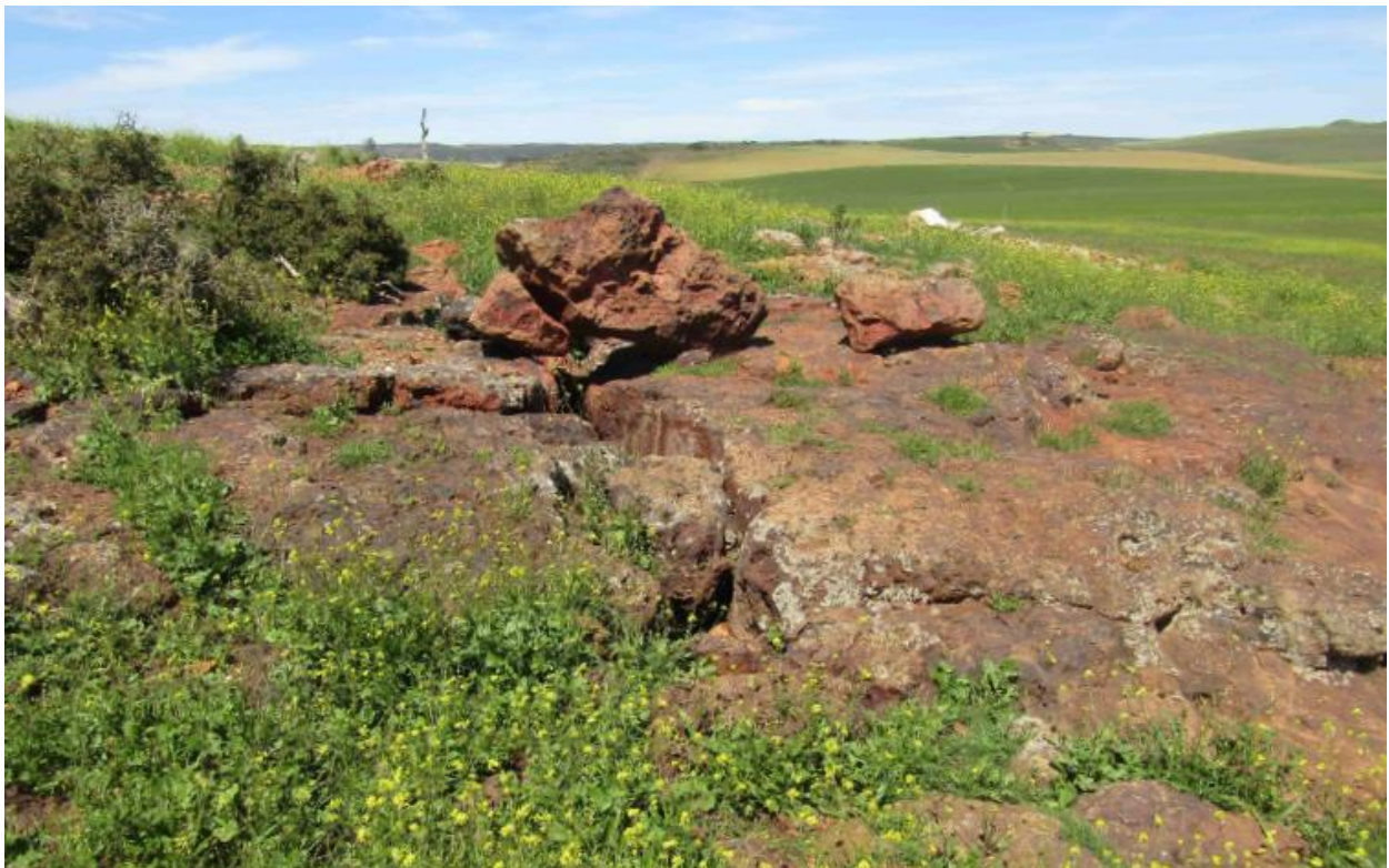
Figure 2. Top and bottom: ferruginised hilltop silcrete.