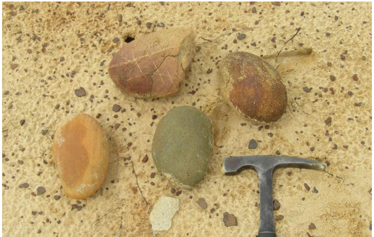
Figure 5. Top and bottom - pebbles and lithics on the depression floor.