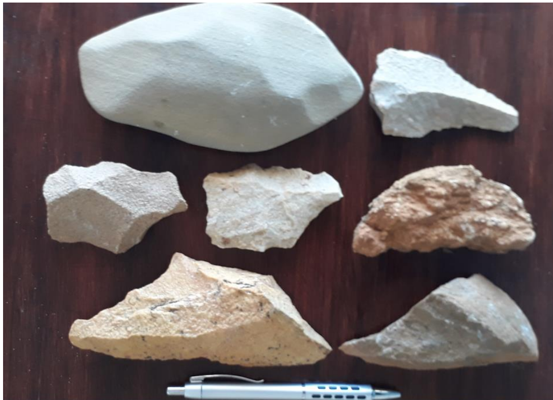
Figure 6. A random collection of Stone Age artefacts from the floor of the depression.