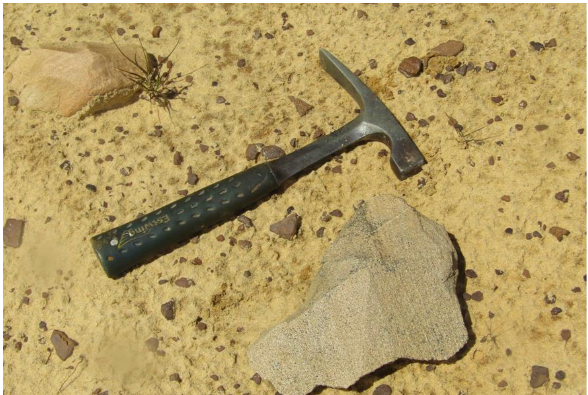
Figure 4. Top and bottom - pebbles and lithics on the depression floor.