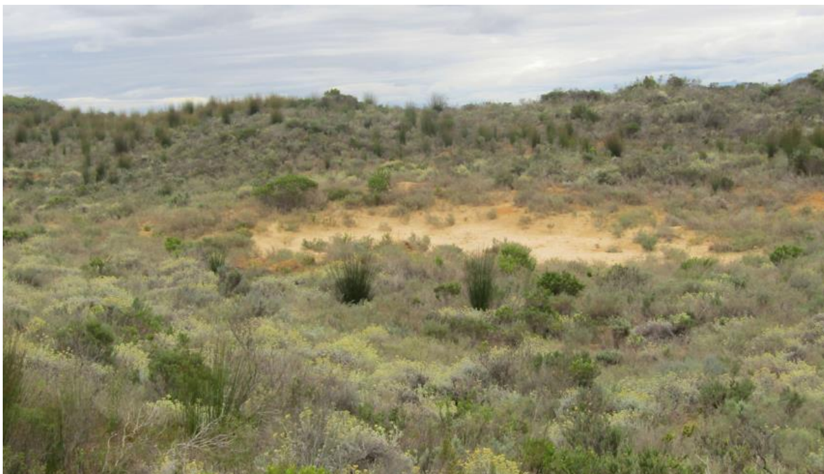
3. View of the depression from the south.