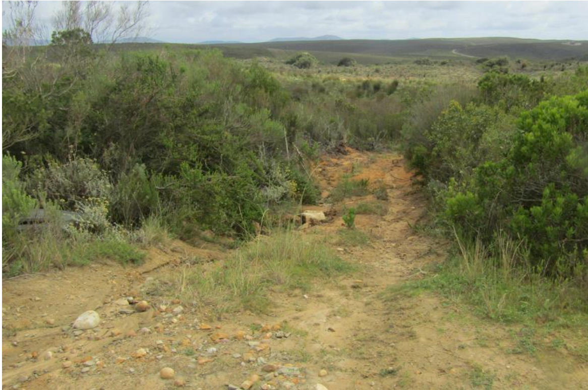
2. The access road into the depression.

The depression is located ~300 m from the road and can be easily accessed (Figure 3). It was first visited by ME Marker and PJ Holmes, who published their findings in a paper in 1999: “Laterisation on limestones of the Tertiary Wankoe Formation and its relationship to the African Surface, Southern Cape, South Africa”. See also Field Note on pinnacles outside the Study Area.