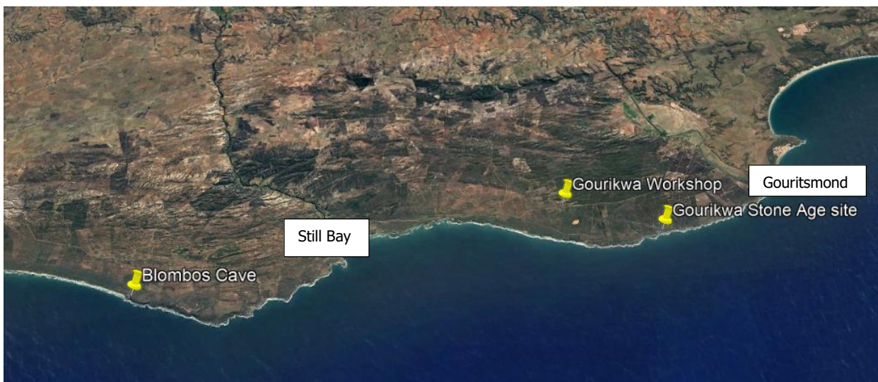
Figure 8. Satellite image of part of the South Coast showing the sites in question.

The author is not aware of any publication, which dealt with the archaeological findings, in the Gourikwa Reserve or around it. The nearest researched Stone-Age archaeological site is the Blombos Cave, some 45 km to the west (Figure 8).