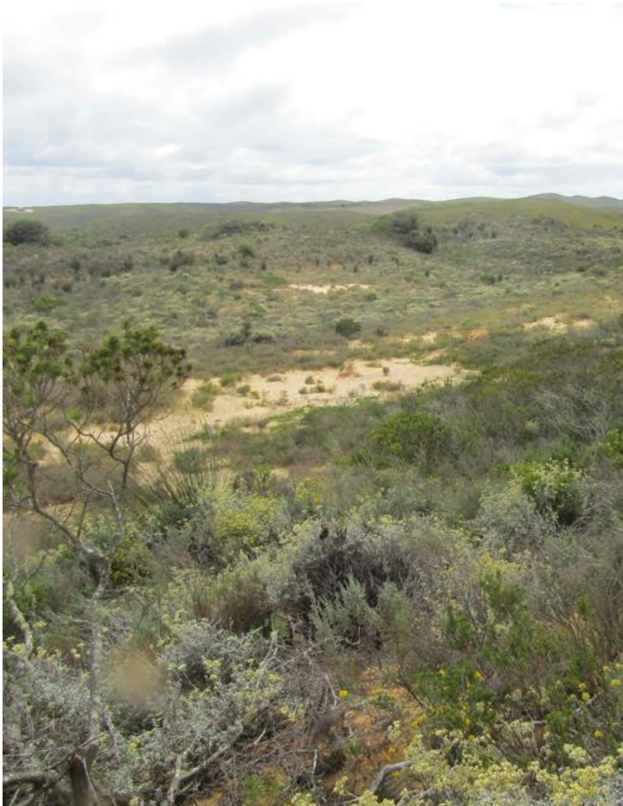
Possible site of raw material for Stone Age tool making near Gourikwa Reserve.