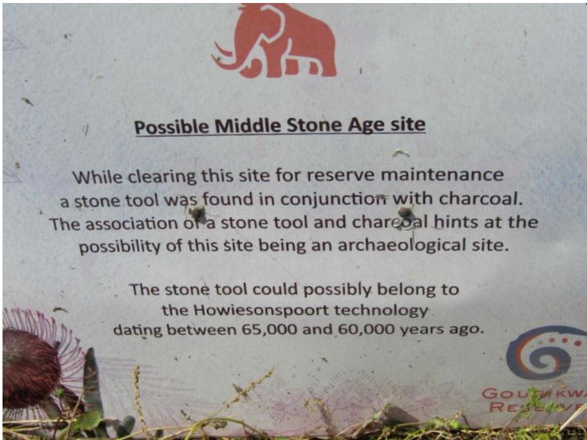
Figure 7. A poster located 200 m east of the chapel on the Gourikwa Reserve.

One Stone-Age tool was found by others near the chapel on the Gourikwa Reserve (Figure 7). The author is unaware of any photograph of that tool, or other information about it.