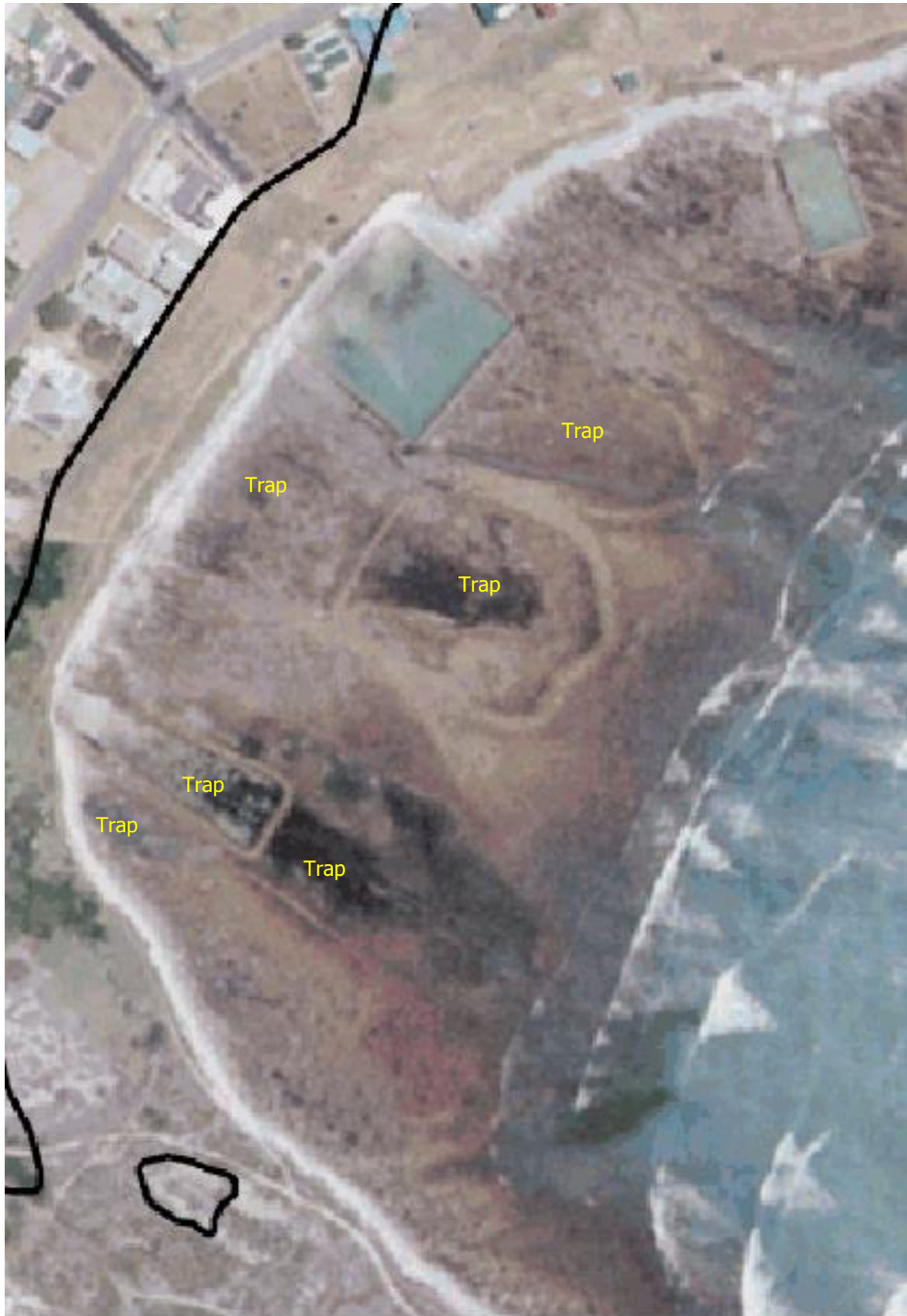
Figure 6. Topographic map of the fish traps near Cape Agulhas.

The traps are distinguished from topography maps and satellite images (Figures 6 to 8).