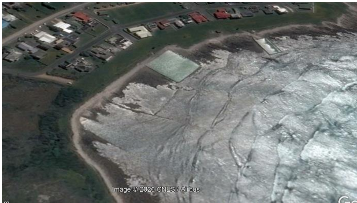
Figure 7. Satellite images of the fish traps near Cape Agulhas. Top – at low tide. Bottom – at high tide.