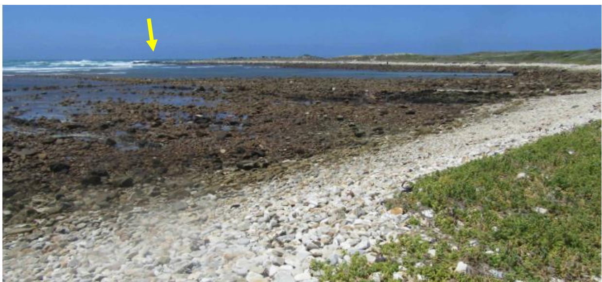
Figure 5. The fish traps near Cape Agulhas. View to the southwest. Arrow points to Cape Agulhas.