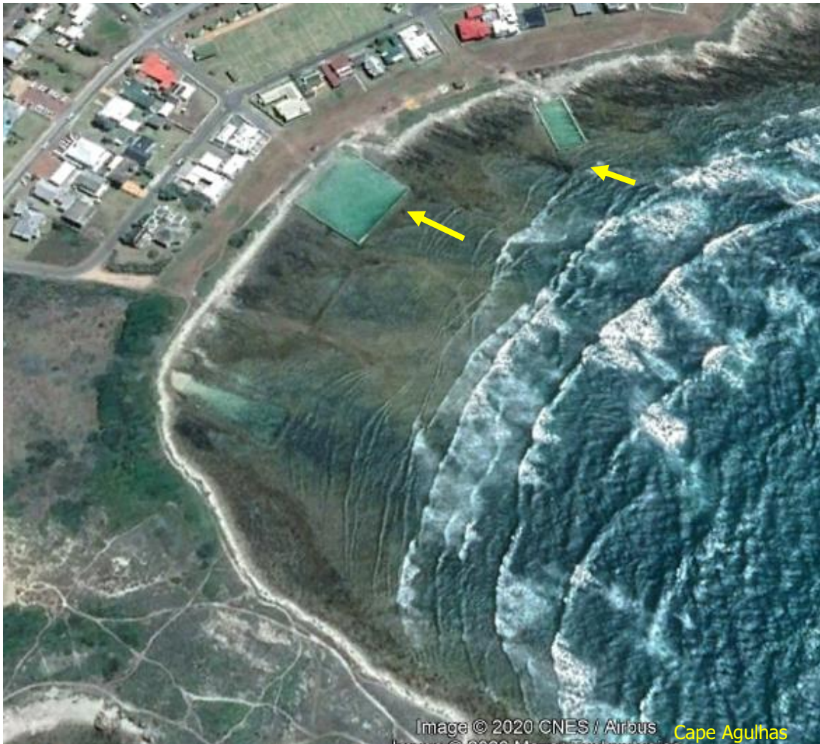
Figure 4. Satellite image of the fish trap cluster immediately north of Cape Agulhas. Arrows point to modern-day tidal swimming pools.