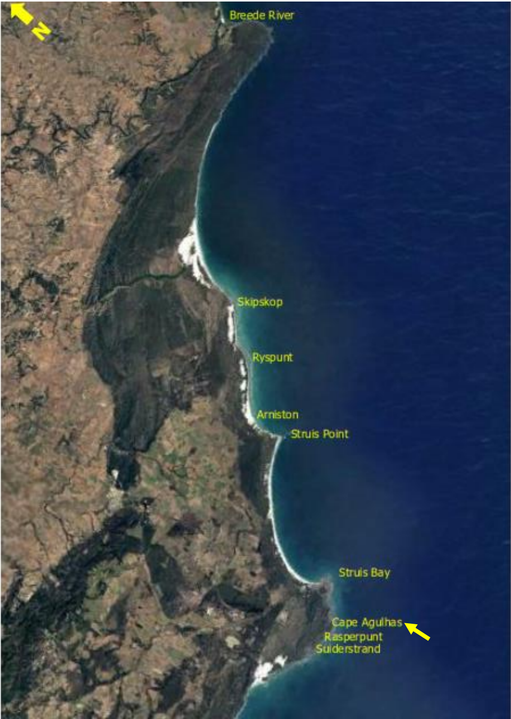
Figure 1. Satellite image (rotated) showing the locations of fish trap clusters in the Study Area. Arrow points to Cape Agulhas.

There are twenty-eight sites of intertidal fish trap clusters along the Cape South Coast, eight of which are along the shores of the Study Area. They are (from southwest to northeast): Suiderstrand, Rasperpunt, Cape Agulhas, Struis Bay, Struis Point, Arniston, Ryspunt, Skipskop and Breede River, containing in total >100 traps of all shapes and sizes (Figure 1). This Field Note is about the trap cluster near Cape Agulhas (Figures 2 to 5).