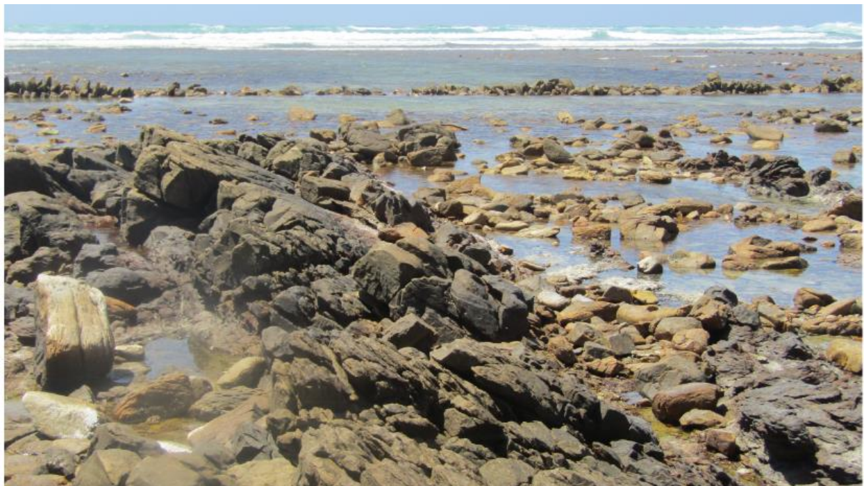
Figure 8. Top, middle and bottom: the fish traps near Cape Agulhas.