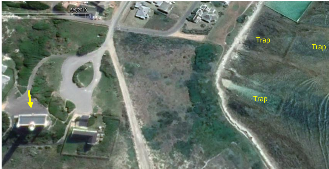
Figure 8. Satellite image of the Cape Agulhas lighthouse (yellow arrow).

The traps are close to, and just below, the Cape Agulhas lighthouse, from which they can be seen at low tide (Figures 8 and 9).