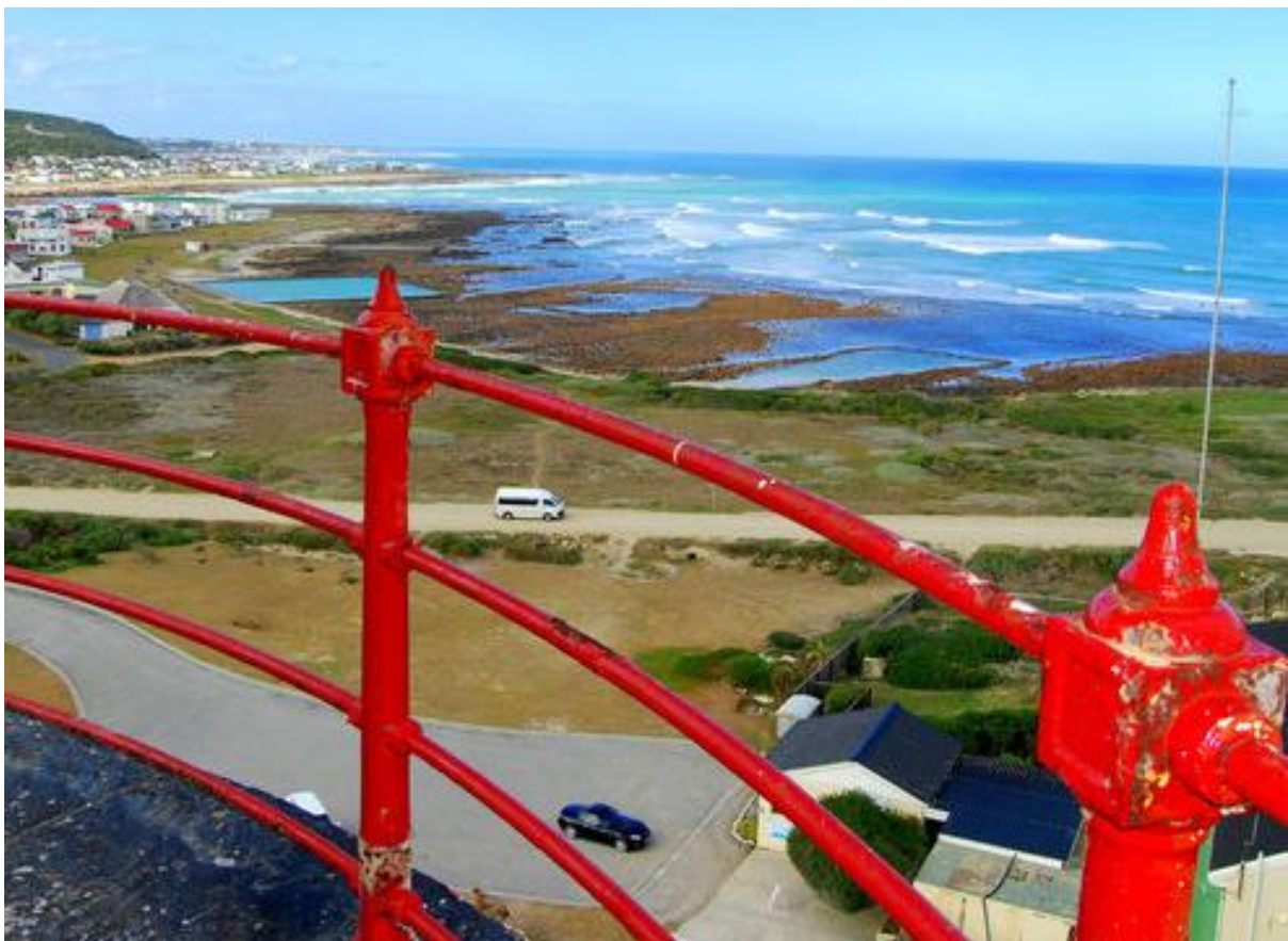
Figure 9. View of the Cape Agulhas fish traps from the top of the lighthouse.