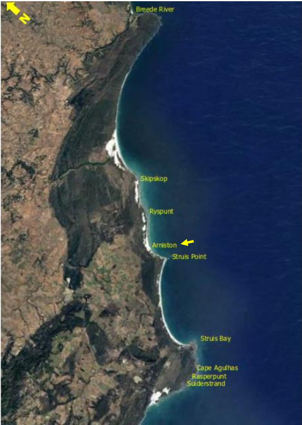
Figure 1. Satellite image (rotated) showing the locations of fish trap clusters in the Study Area. Arrow points to the fish traps at Arniston.

There are twenty-eight sites of intertidal fish trap clusters along the Cape South Coast, nine of which are along the shores of the Study Area. They are (from southwest to northeast): Suiderstrand, Rasperpunt, Cape Agulhas, Struis Bay, Struis Point, Arniston, Ryspunt, Skaapkop and Breede River, containing in total >100 traps of all shapes and sizes (Figure 1). This Field Note is about the traps at Arniston.