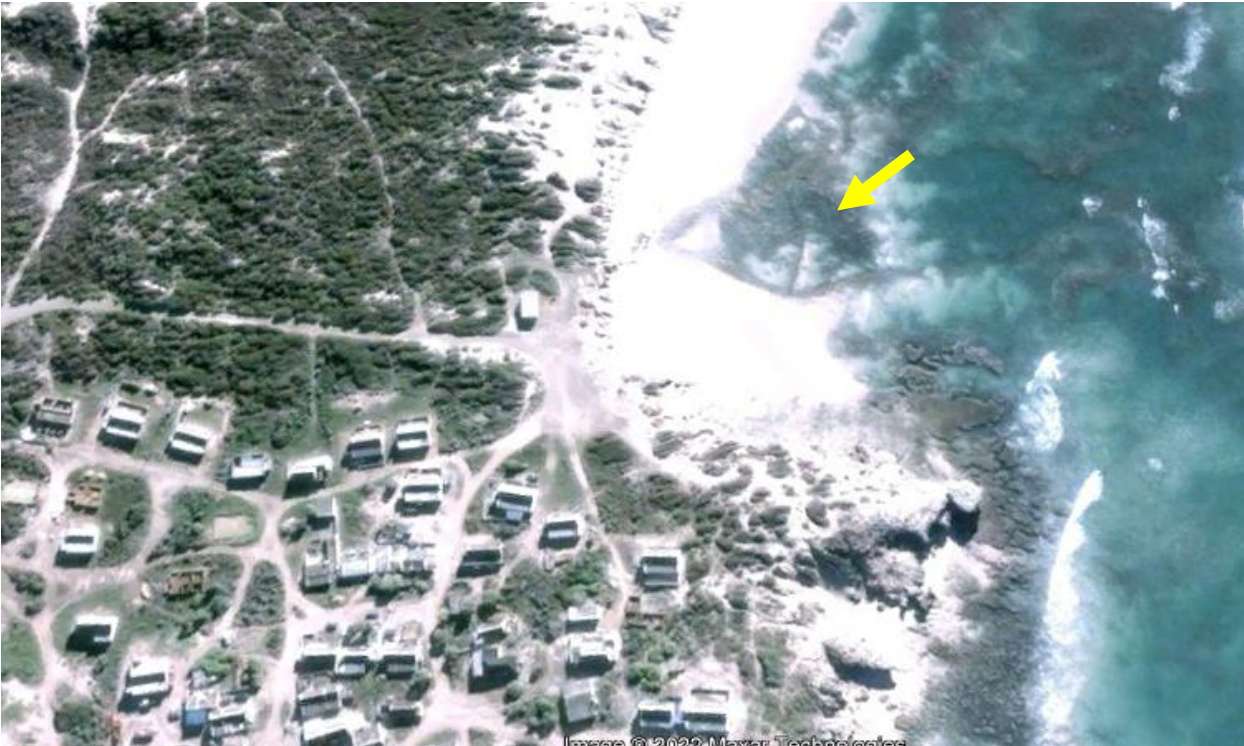
Figure 2. Topography map (top) and satellite image (bottom) of the shore north of Arniston, showing the location of the fish traps (arrow).