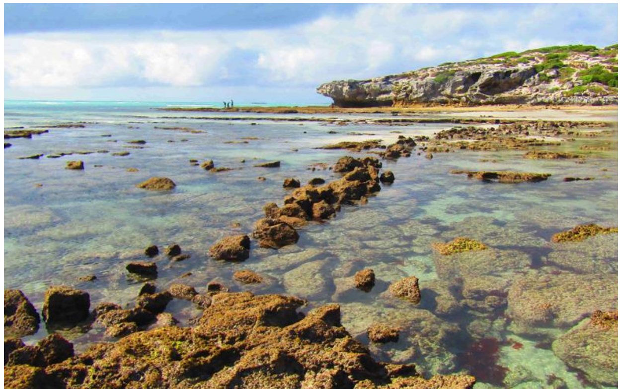
Figure 5. The south fish trap wall. Top – view from the south; bottom - view from the north.