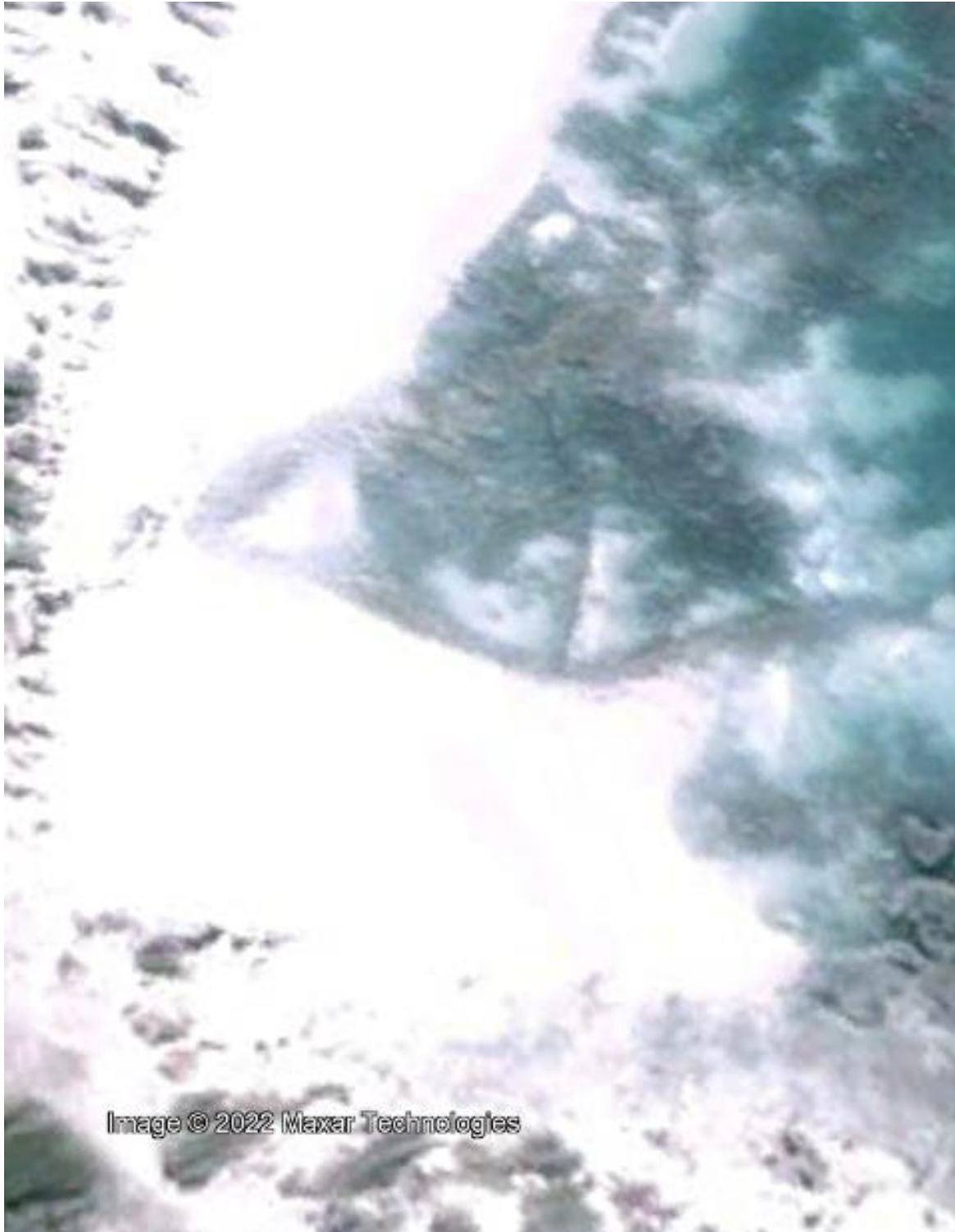
Figure 3. Satellite image (June 2005) of the fish traps at Arniston.

These small fish traps were not noted by other researchers, as the walls are partly destroyed and the traps are filled with sand. They are only visible at very low tide and when the sea is relatively calm. In most available satellite images, except the one from 2005 the traps can hardly be discerned (Figure 3).