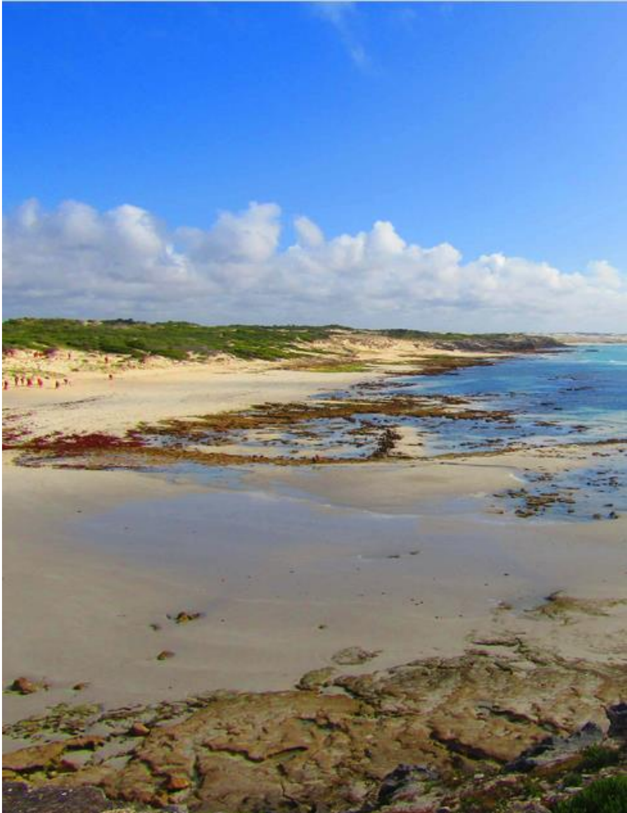
The fish traps north of Arniston. View to the north.