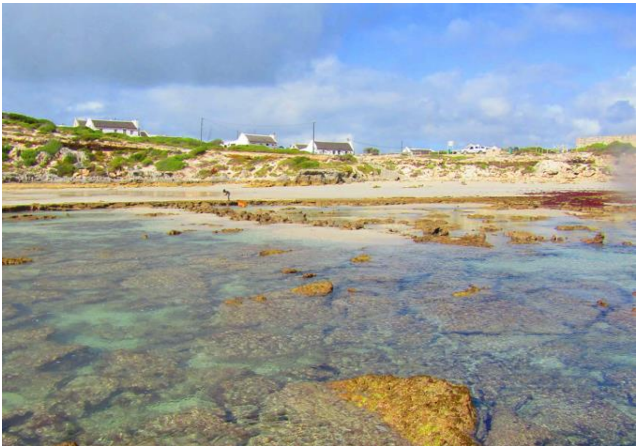
Figure 4. The south fish trap. Top – View from the south; bottom - view from the northwest.