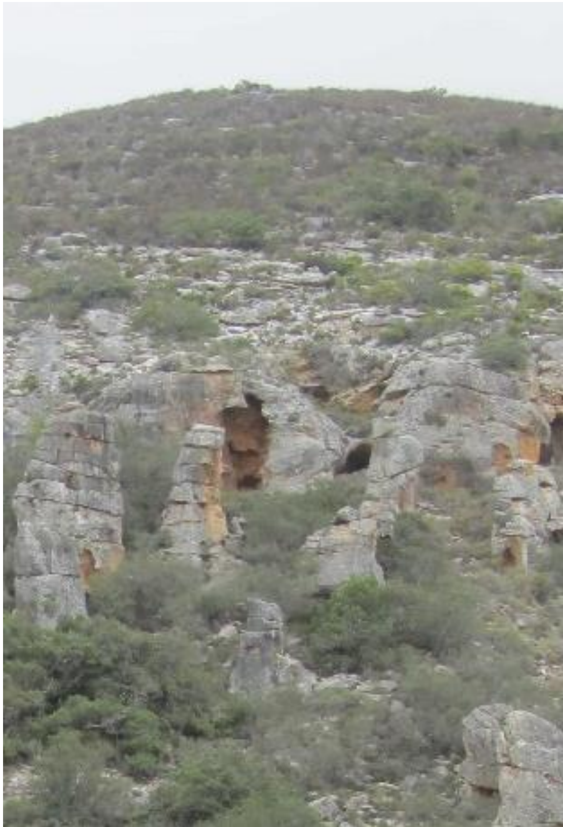
Figure 9. 'Sliced' pinnacles. See Figures 4 and 6.

Most of the pinnacles are 'sliced' horizontally or nearly horizontally (Figure 9).