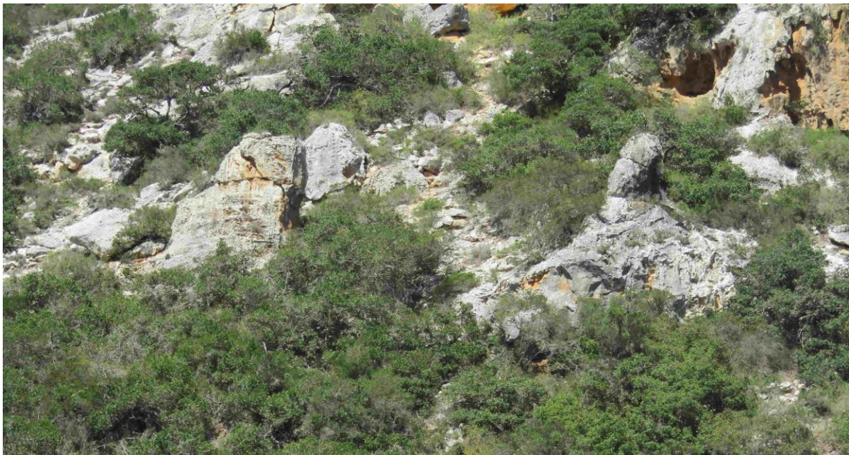
Figure 10. Pinnacles on Aasvoelkrans.

Read on other pinnacles in Chapters E, O and P.