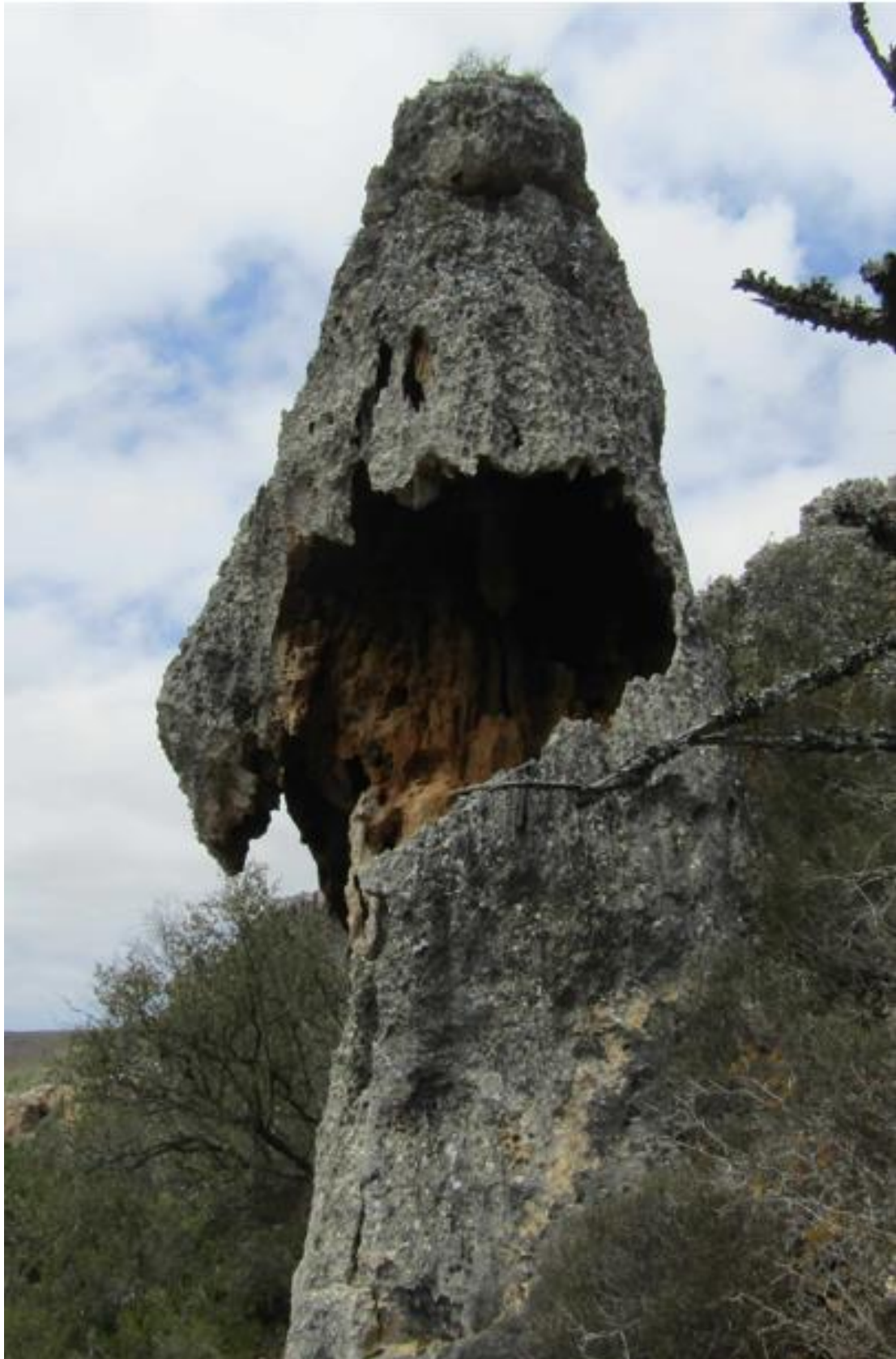
Figure 7. Hollowed-out pinnacle.

Some pinnacles are partly hollowed out by erosion (Figures 7 and 8).