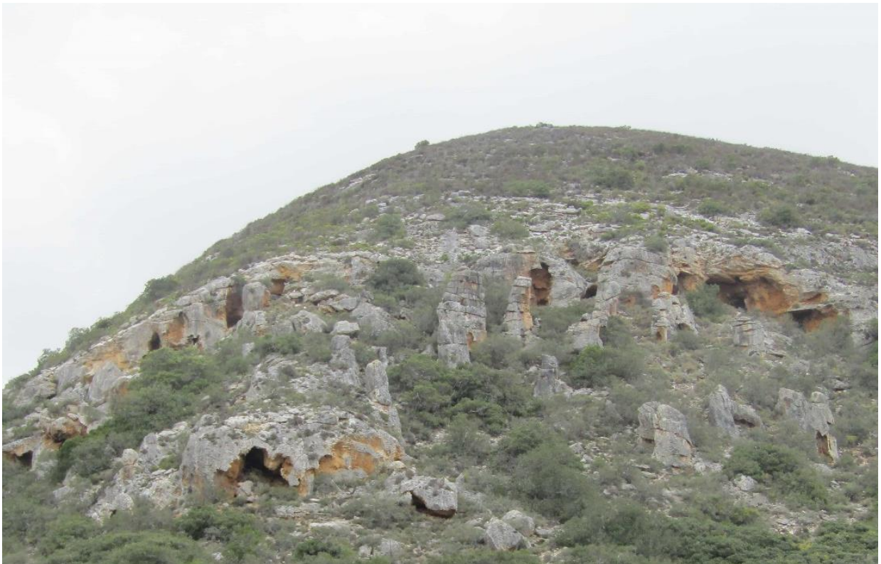
Figure 4. Top and bottom - pinnacles on the slope between Koleskloof and Ghwanogatekloof.