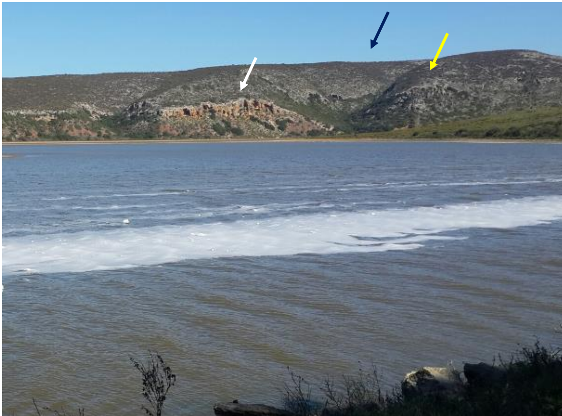
Figure 2. View from the northern bank of the Salt River Gorge across the Salt River Marsh on the pinnacles (yellow arrow), Ghwanogatekloof (black arrow) and the Rooikrans (white arrow).