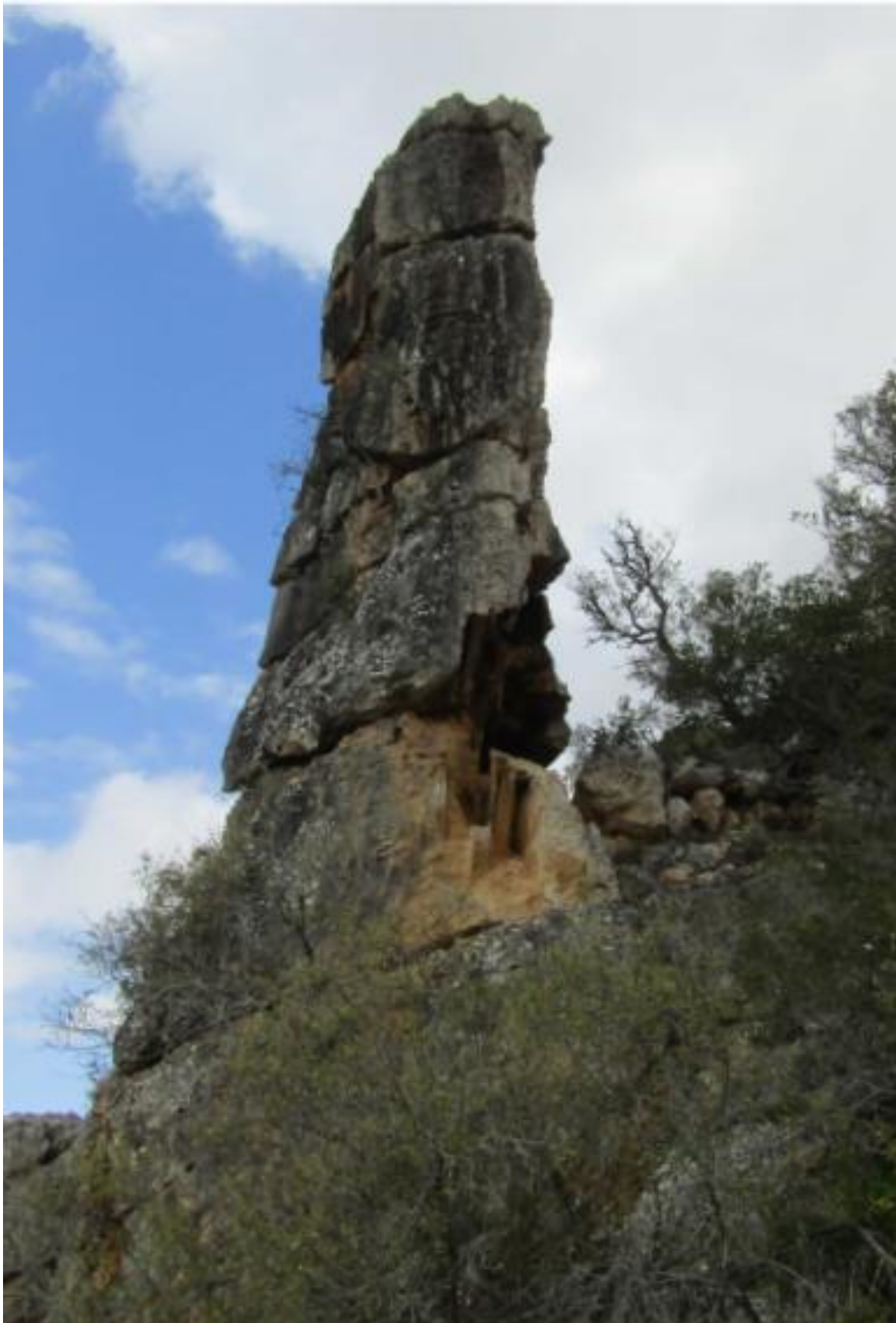
Figure 6. Pinnacle, 5 m high.