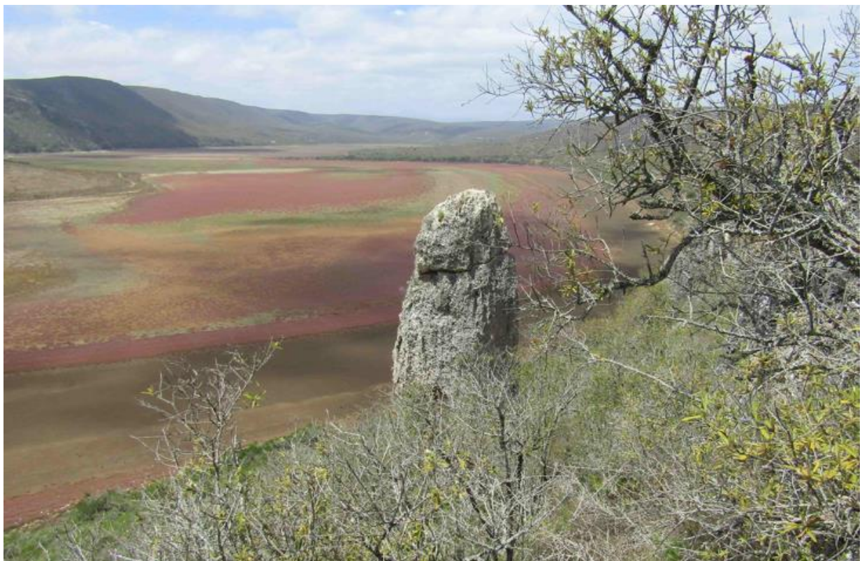
Fig 5. Top and bottom: some pinnacles attain heights of up to 5 m. The dry marsh floor is blooming.