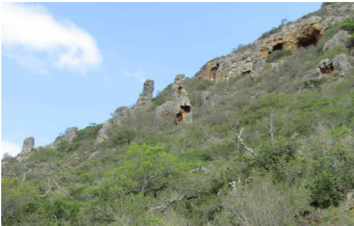
Figure 3. Pinnacles on the slope between Koleskloof and Ghwanogatekloof.