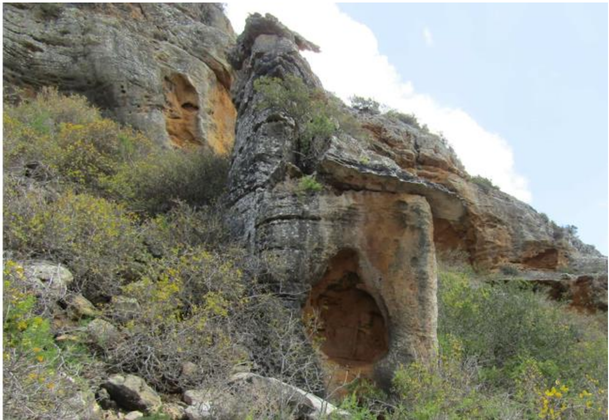
Figure 8. Top and bottom: eroded pinnacle bases.