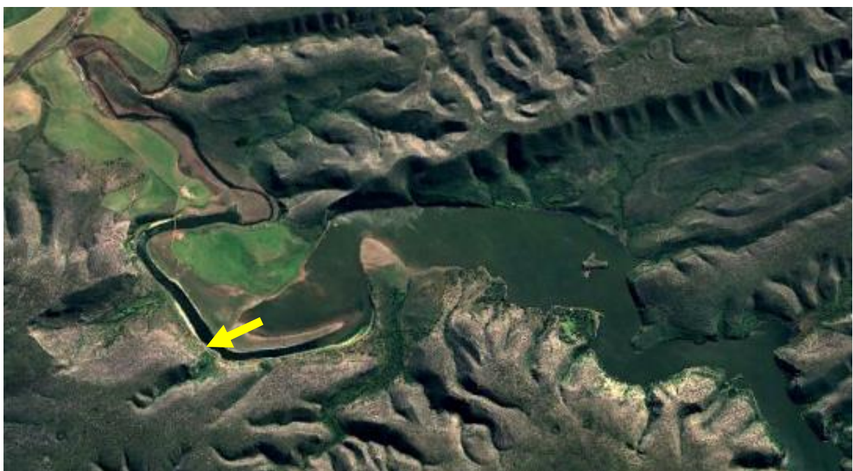
Figure 1. Topography map (top) and satellite image (bottom) of the Salt River Gorge. Arrow points to the pinnacles.