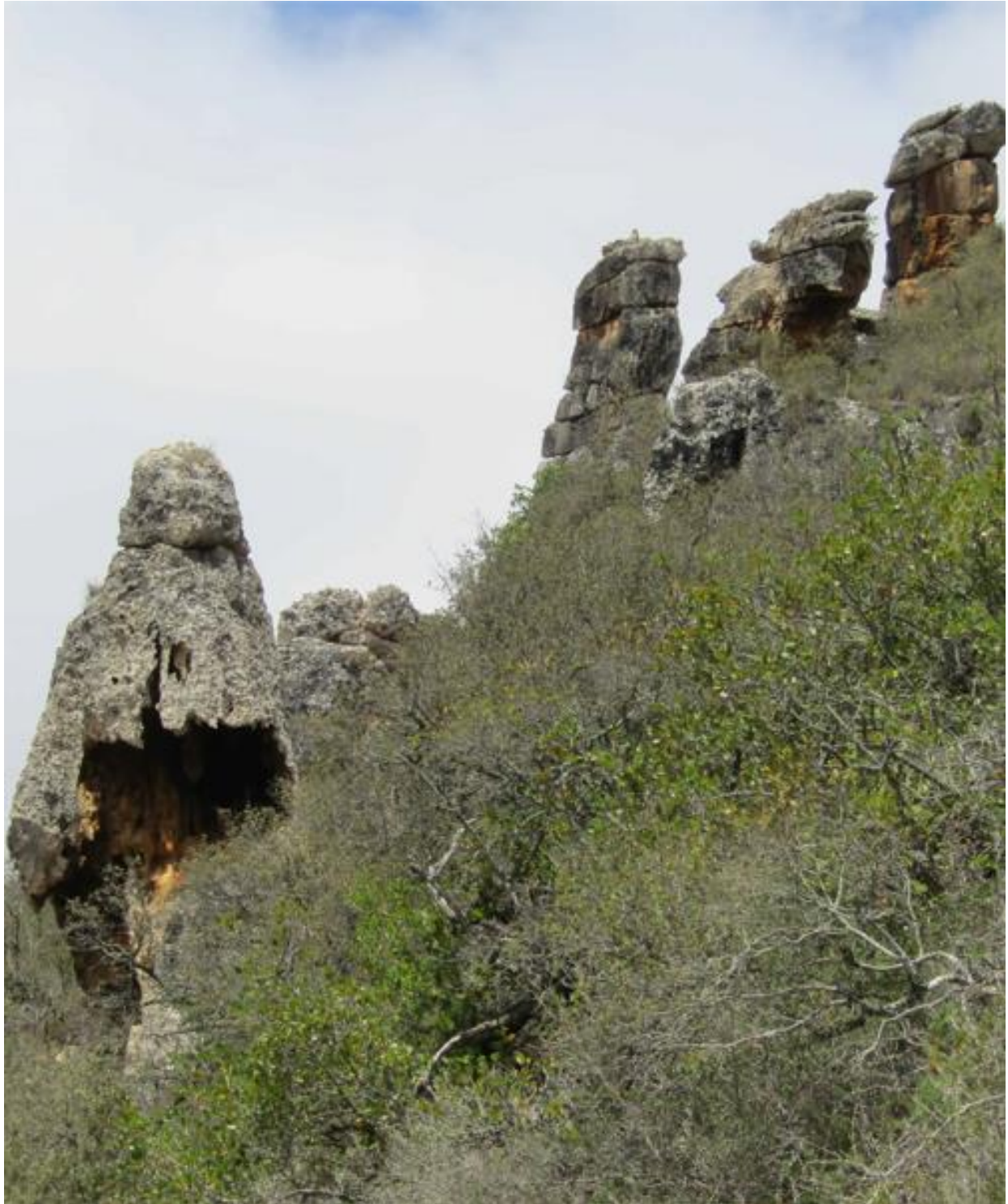
Pinnacles on the southern bank of the Salt River Gorge.