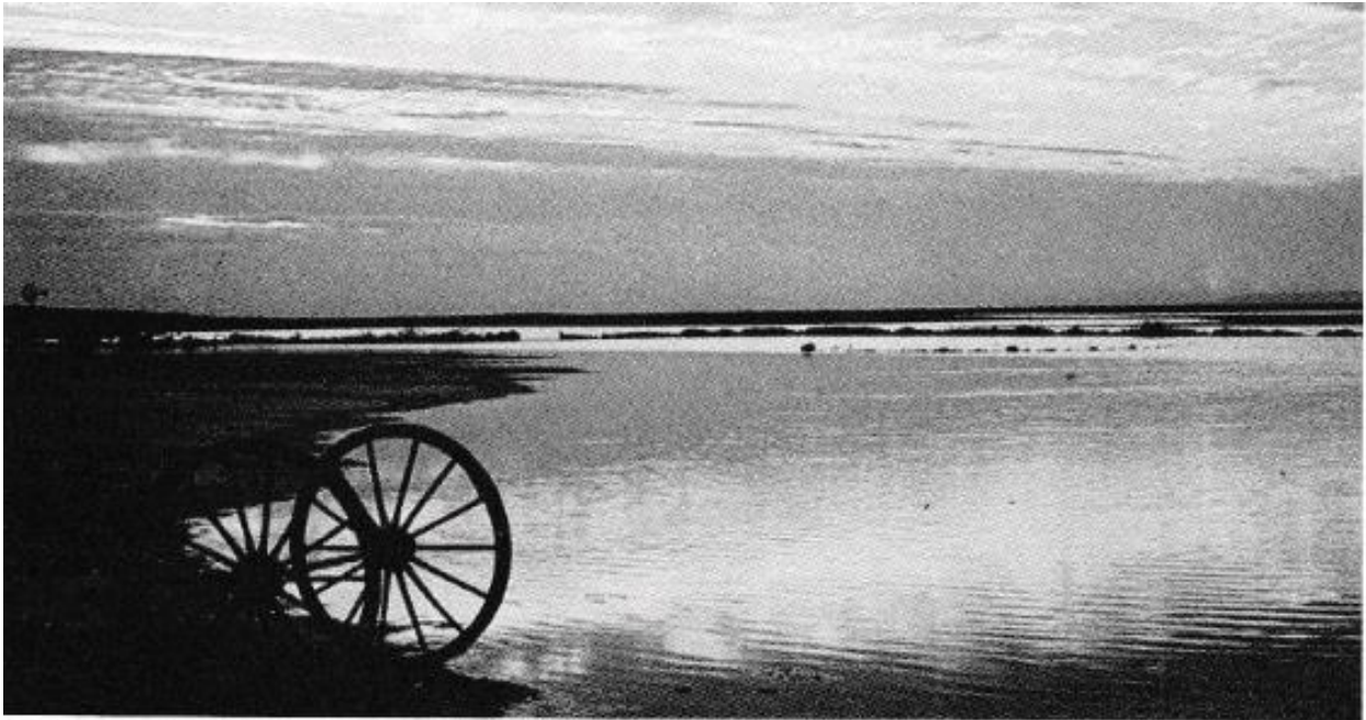
12 months after the flood. Looking north-west on Reimerskraal.