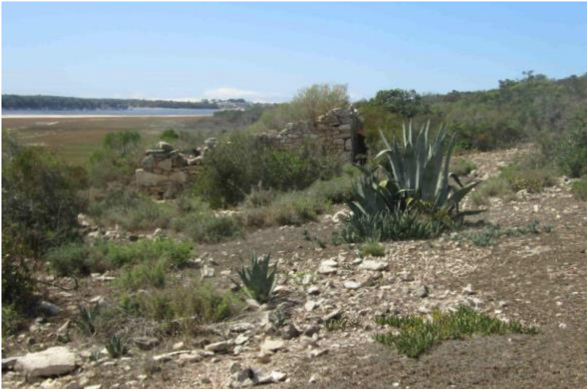
Figure 7. The ruins south of Wasdam se Kloof. View to the southeast.