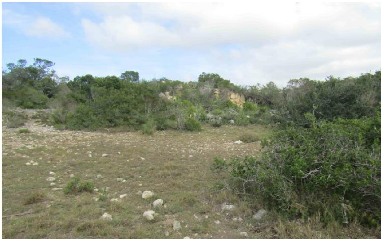
Figure 10. The ruins south of Wasdam se Kloof. View to the north.

The author did not find any information on the Eselkamp and the Wasdam ruins.