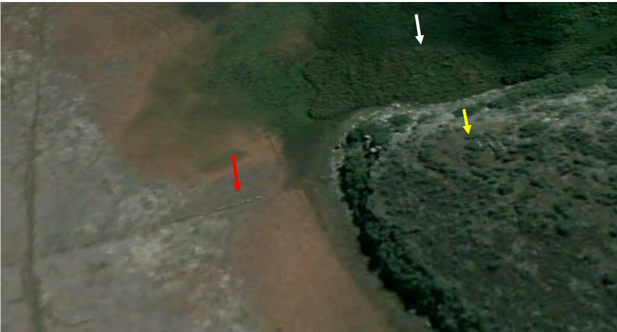
Figure 2. Satellite images of the Eselkamp ruins (yellow arrow) at the outlet of Eselkloof (white arrow). Top – the vlei is full; bottom – the vlei is dry. Note the wall across the gorge south of the Eselkloof outlet (red arrow); see Field Note on roads, dykes and stonewalls.