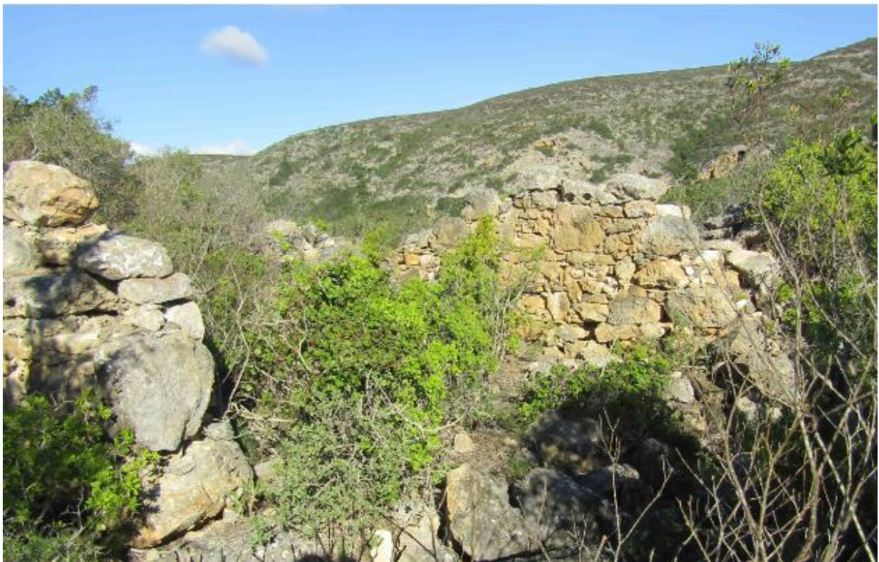
Figure 5. Eselkamp ruins.