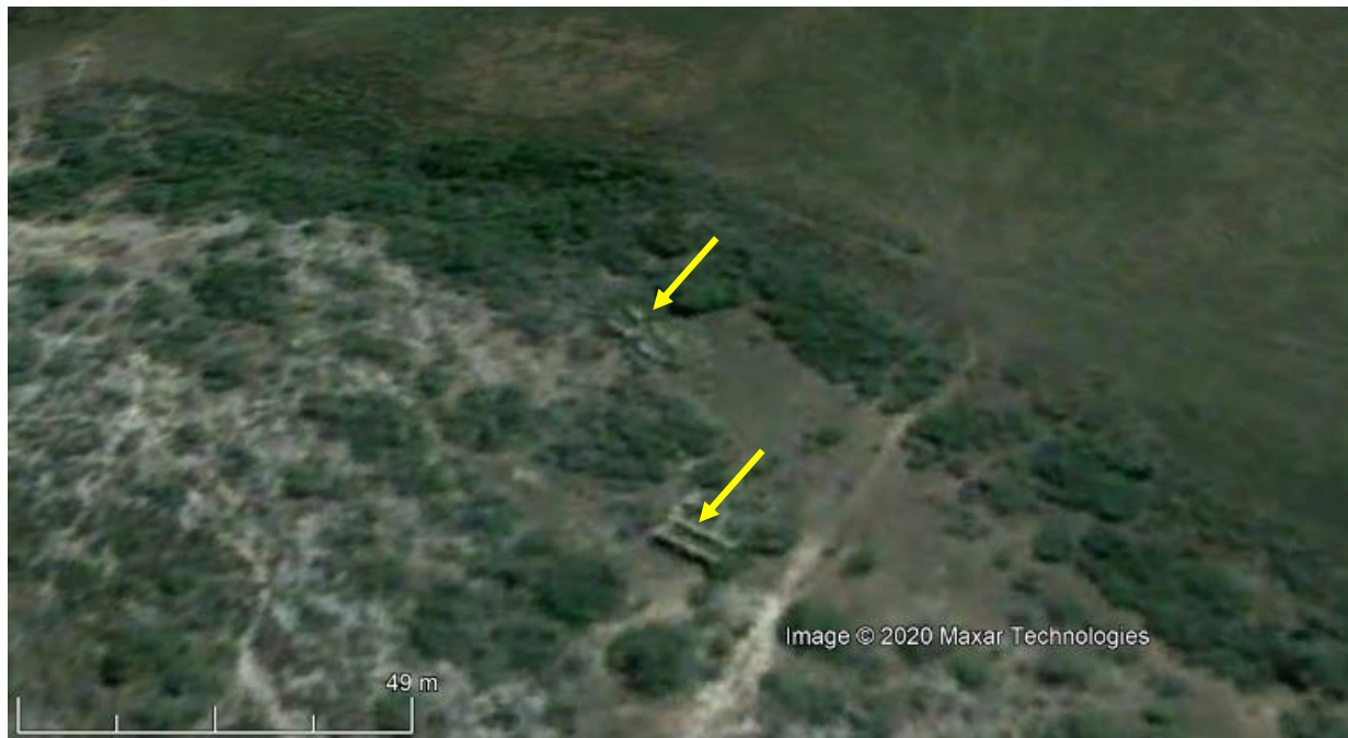
Figure 6. Satellite images of the Wasdam se Kloof ruins (yellow arrows). Top – the vlei is full; bottom – the vlei is dry.