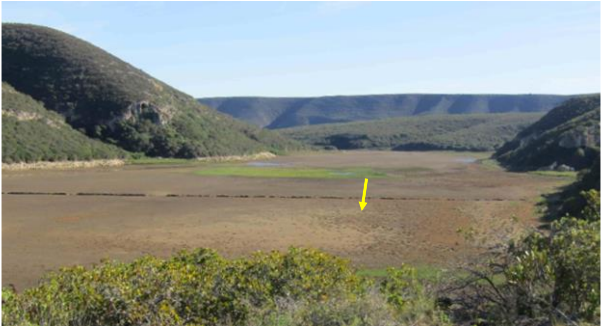
Figure 4. View to the north from the Eselkamp ruins. The wall across the gorge, north of the Eselkloof outlet, is clearly seen (arrow).

The Eselkamp ruins are obscured by thick bushes (Figure 5).