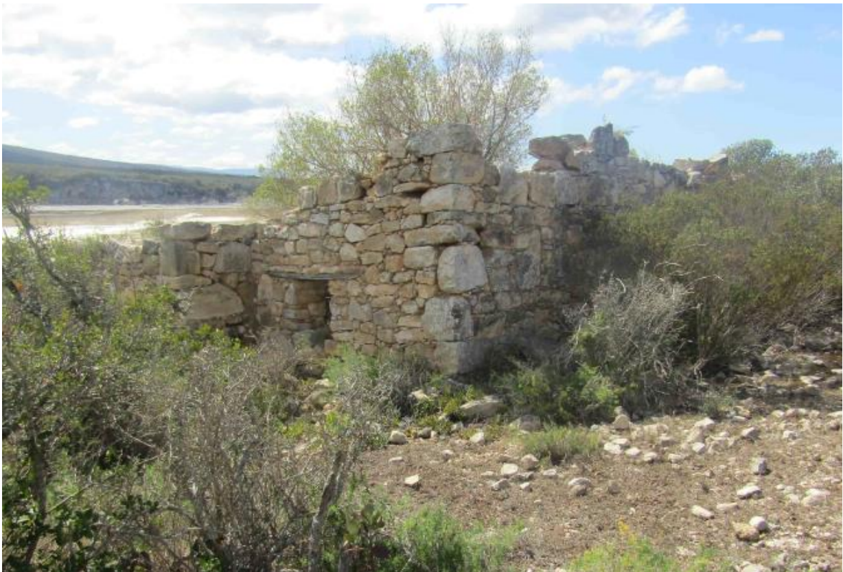
Figure 8. The ruins south of Wasdam se Kloof. View to the southeast.