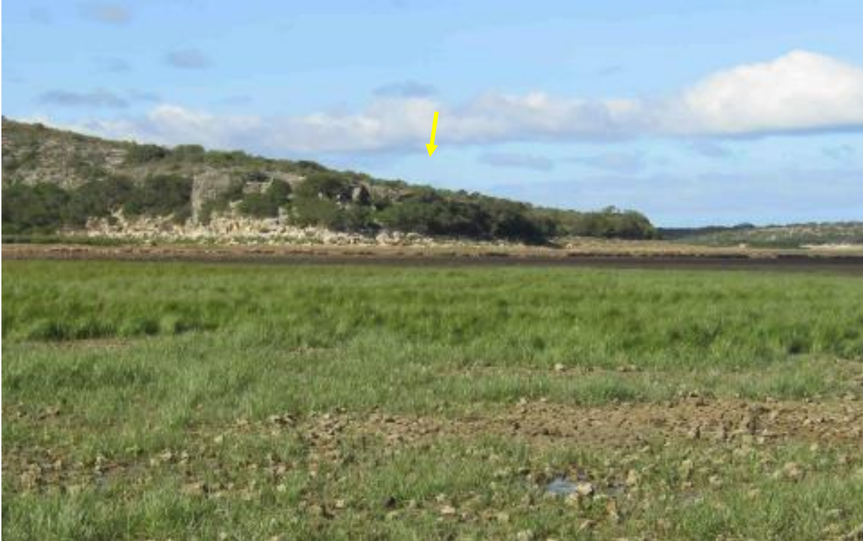
Figure 3. View to the south on the location of the Eselkamp ruins (arrow).

The Eselkamp ruins are situated about 12 m above the vlei floor (Figures 3 and 4).